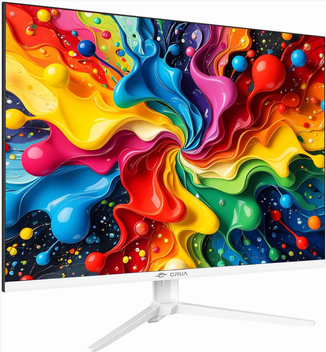
Image: The CRUA 28 Inch White Monitor displaying a vibrant, colorful abstract image, highlighting its IPS panel and color accuracy.