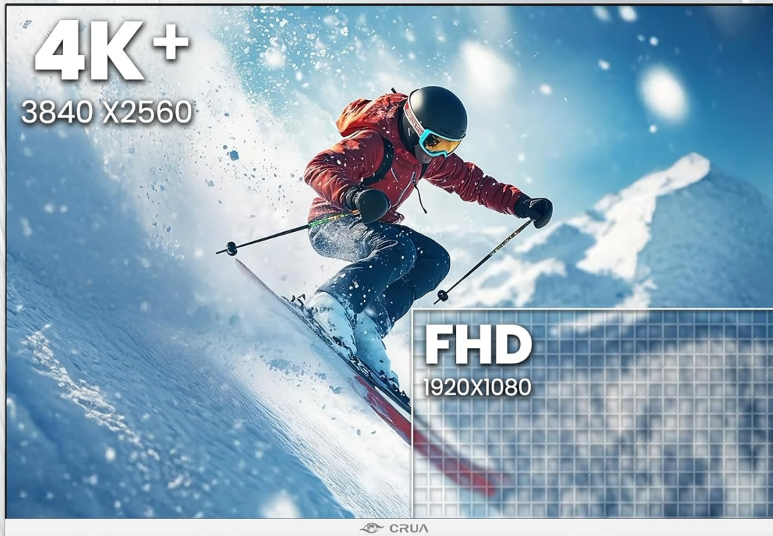
Image: A split screen on the CRUA 28 Inch Monitor comparing 4K+ (3840x2560) resolution to FHD (1920x1080), demonstrating the superior clarity and detail of 4K+ visuals.