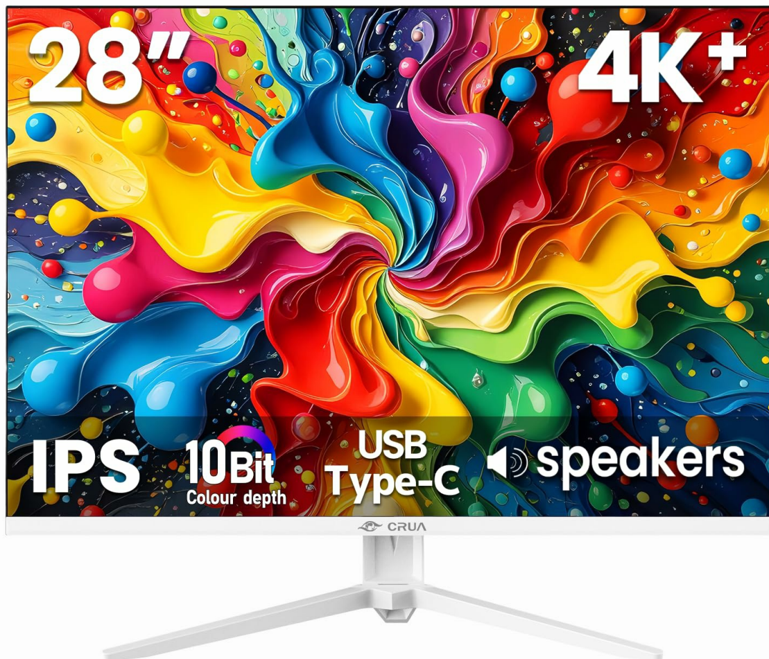
Image: CRUA 28 Inch White Monitor on its stand, showcasing its sleek design and stable base.

Alternatively, the monitor is wall-mountable (75×75mm VESA compatible) for flexible ergonomic setups.