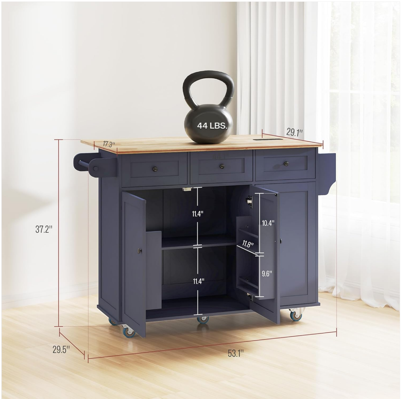
Image: Dimensional drawing of the HOMCOM Kitchen Island, showing key measurements.