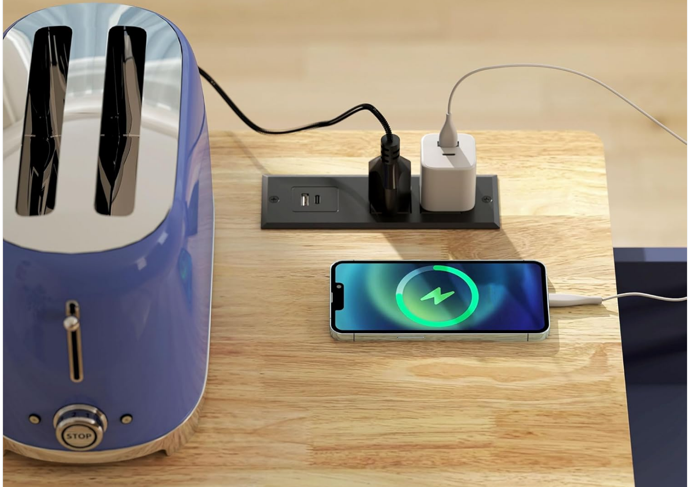
Image: Detail of the integrated power outlet, showing a toaster and a smartphone connected for use.