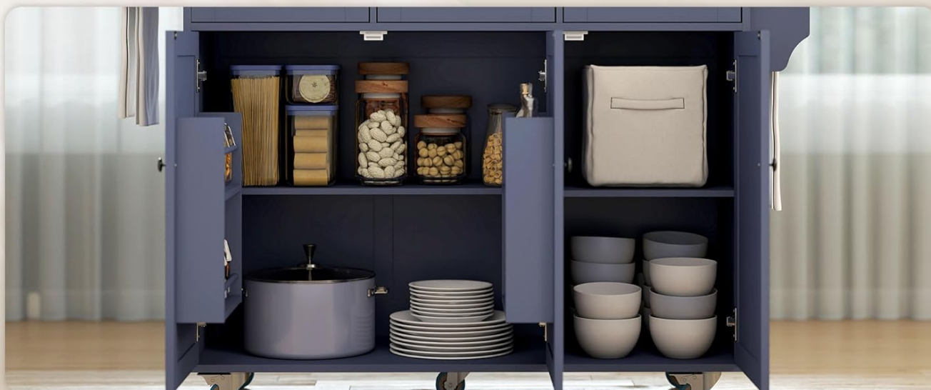
4 Internal Storage Racks