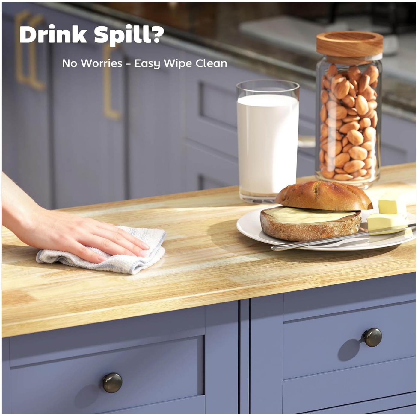
Image: Demonstrating the easy-to-clean surface of the kitchen island countertop.