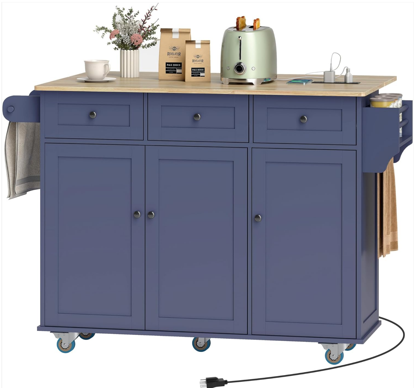
Image: The HOMCOM Kitchen Island in Dark Blue, featuring open cabinets and drawers, positioned in a kitchen environment.