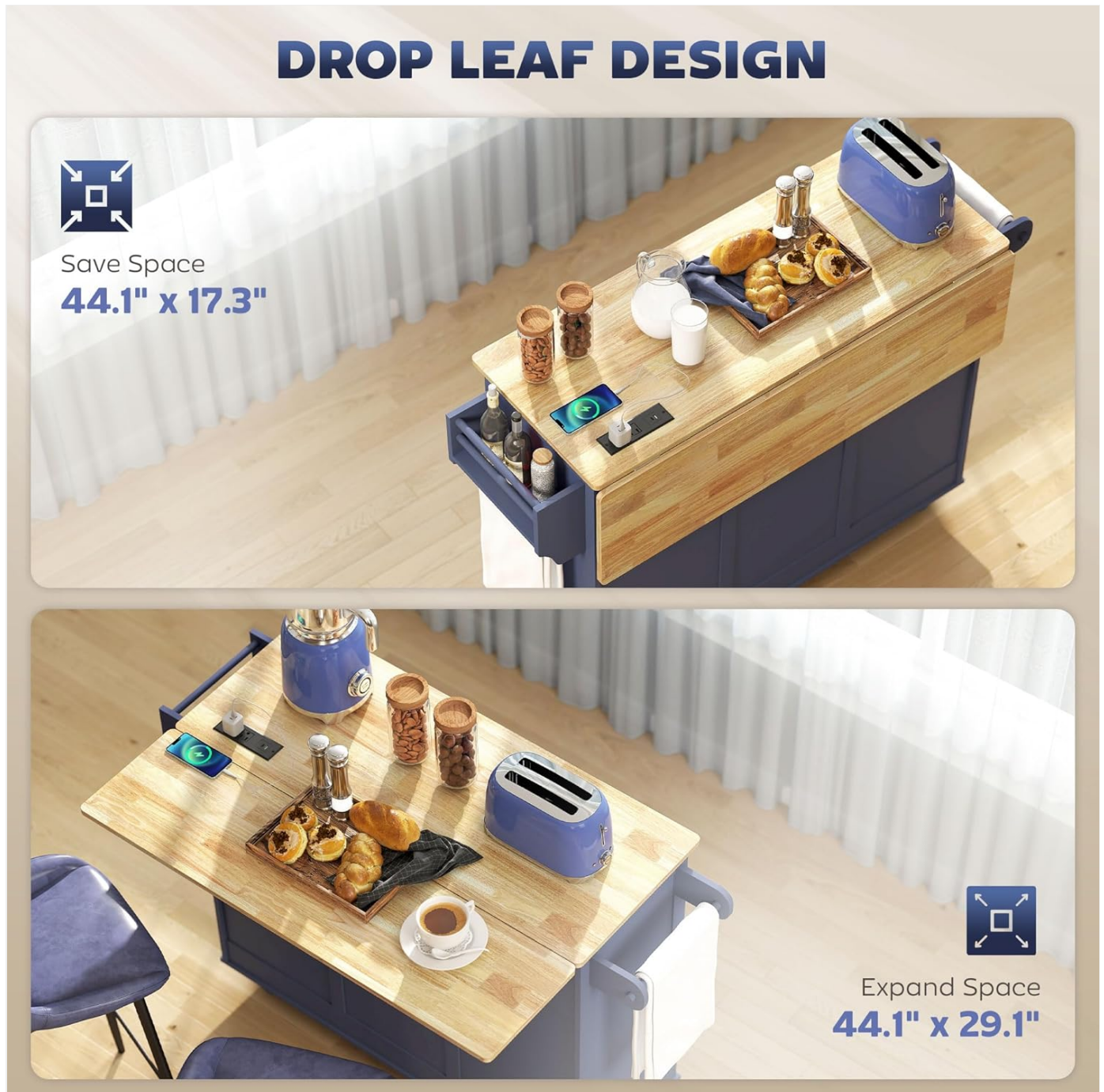
Image: Visual representation of the drop-leaf design, illustrating the countertop in its compact and extended configurations.

The kitchen island features a versatile drop-leaf design. This allows you to extend the countertop for additional food preparation space or a dining area, and then fold it down to save space in smaller kitchens. The expanded countertop measures 44.1" x 29.1", while the folded countertop measures 44.1" x 17.3".