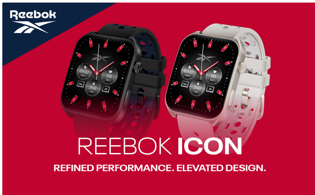
Image: Reebok Icon Smartwatch, highlighting its refined performance and elevated design.

Welcome to the Reebok Icon Smartwatch user manual. This document provides essential information for setting up, operating, and maintaining your new smartwatch. The Reebok Icon Smartwatch is designed to support an active lifestyle with features such as comprehensive health tracking, smart notifications, and a durable, water-resistant design.