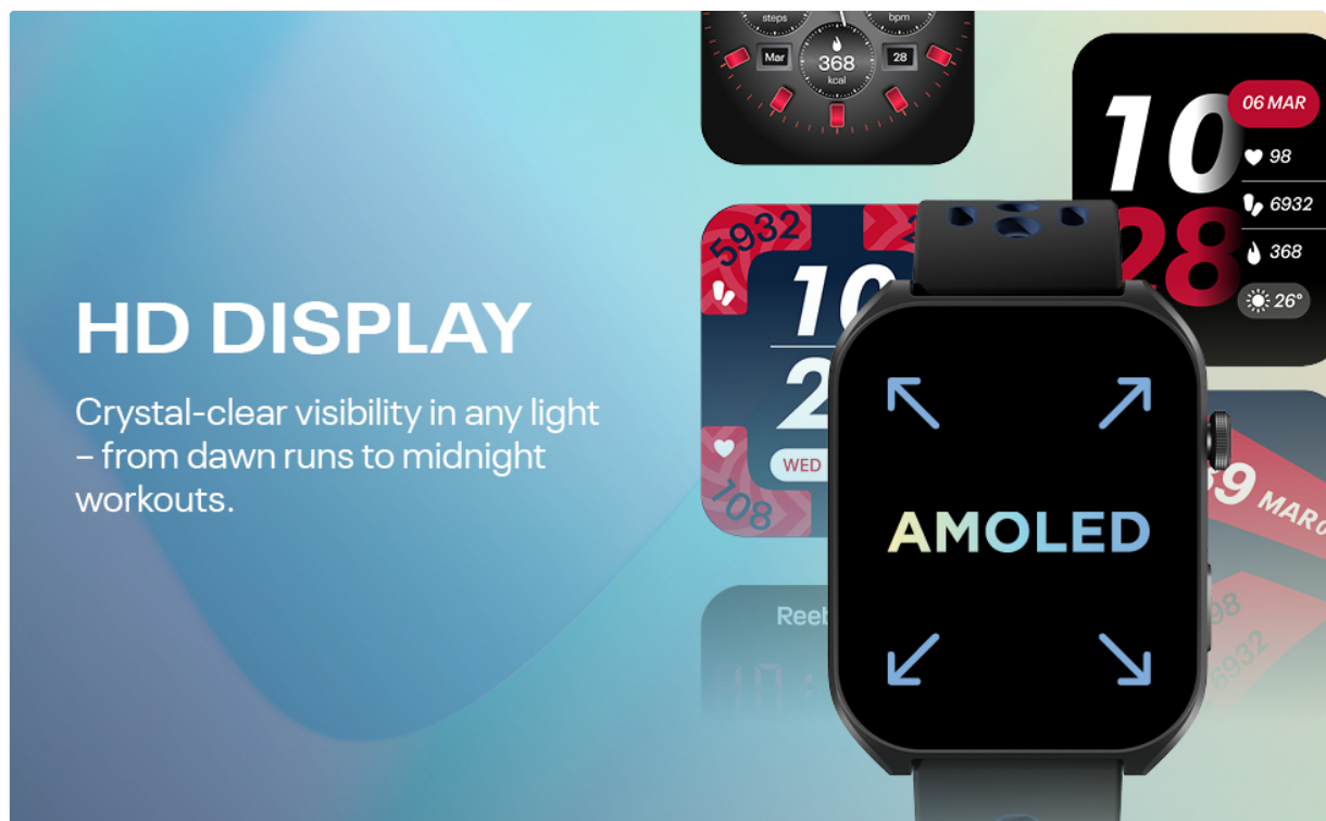
Image: The smartwatch display, emphasizing its high-definition AMOLED screen for clear visibility.