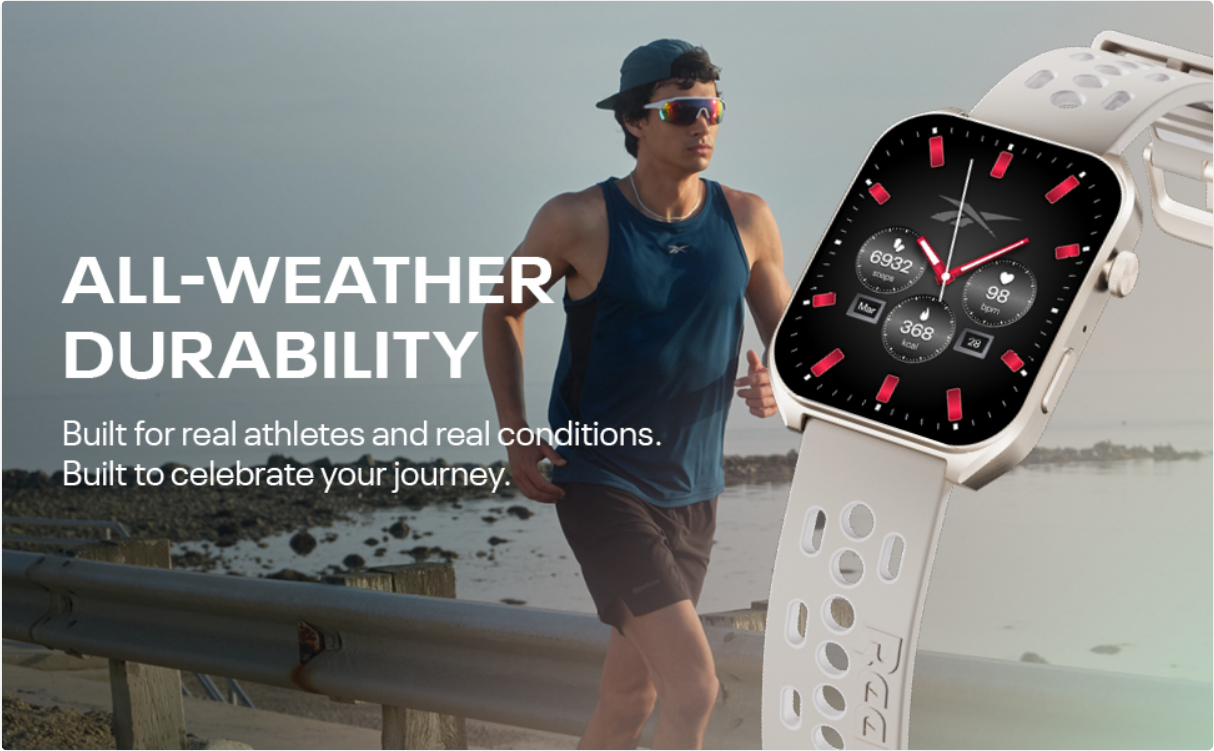
Image: The smartwatch being worn during an outdoor run, showcasing its all-weather durability.