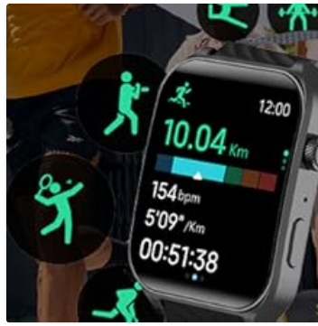
Image: Icons representing different sports and workout modes available on the smartwatch.