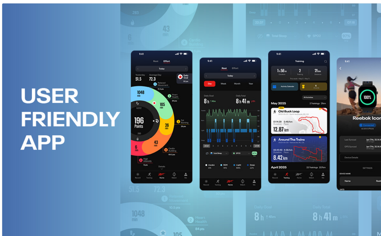
Image: Screenshots of the Reebok Connect app, illustrating its user-friendly interface for managing smartwatch features.

The Reebok Icon Smartwatch is compatible with both iOS and Android devices. To pair your watch, download the 'Reebok Connect' app from your device's app store. Follow the in-app instructions to connect your smartwatch via Bluetooth 5.3.