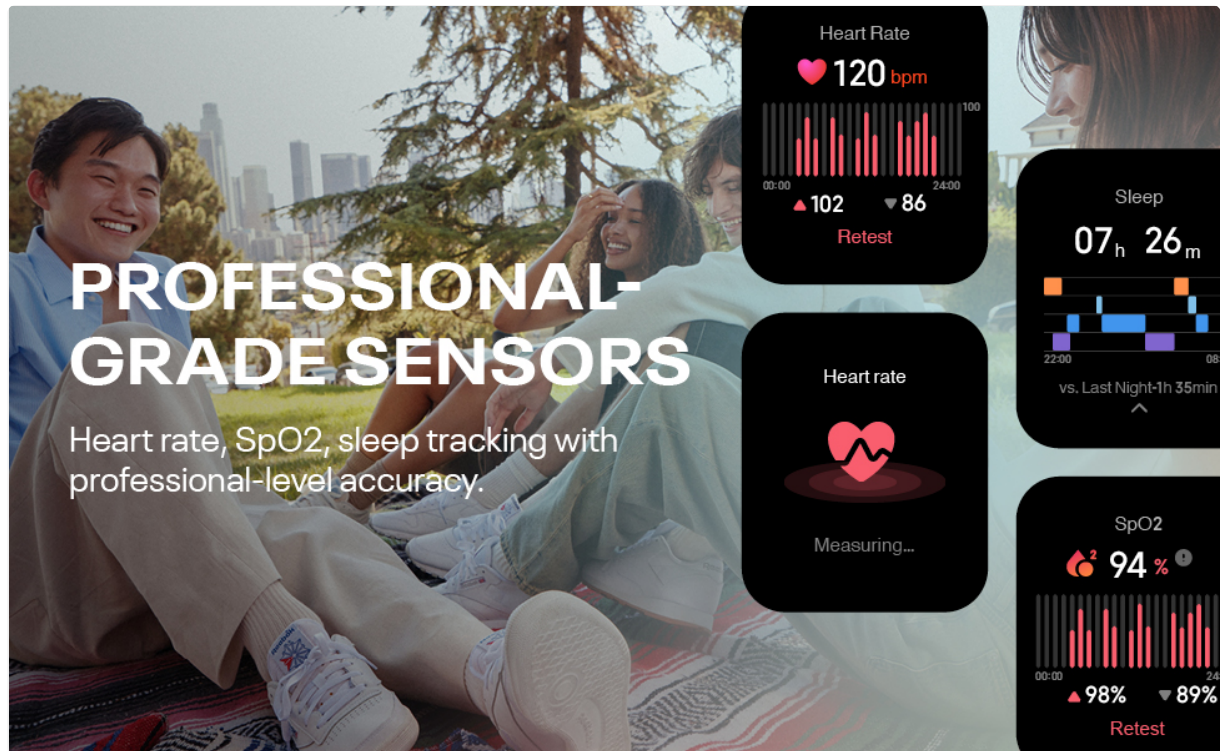
Image: Illustrates the professional-grade sensors for accurate health tracking, including heart rate and SpO2.