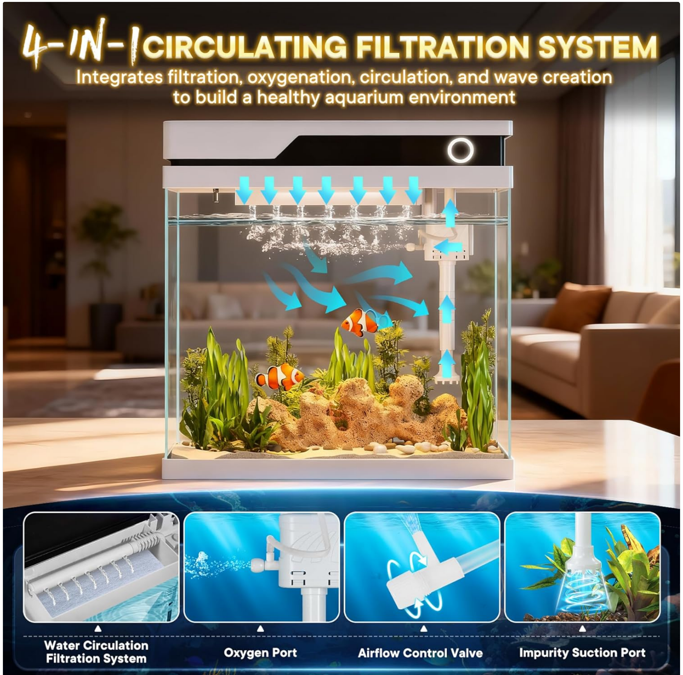
Image: Diagram illustrating the 4-in-1 circulating filtration system, showing water circulation, oxygen port, airflow control valve, and impurity suction port.

Video: This video demonstrates the step-by-step installation process for the Vehipa Smart Fish Aquarium, including placing filter media, assembling the water pump, and securing the top lid.