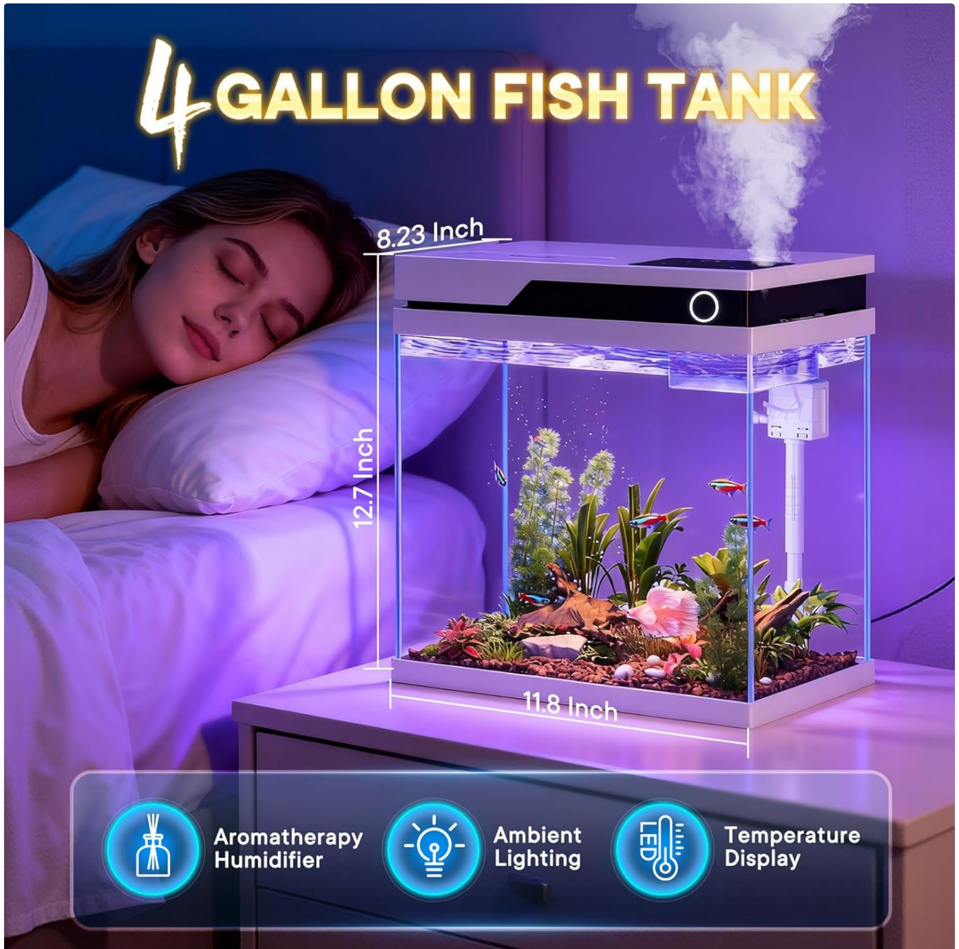
Image: The 4-gallon Vehipa fish tank with its dimensions (11.8 inches length, 8.3 inches width, 12.7 inches height) and key features like aromatherapy humidifier, ambient lighting, and temperature display.