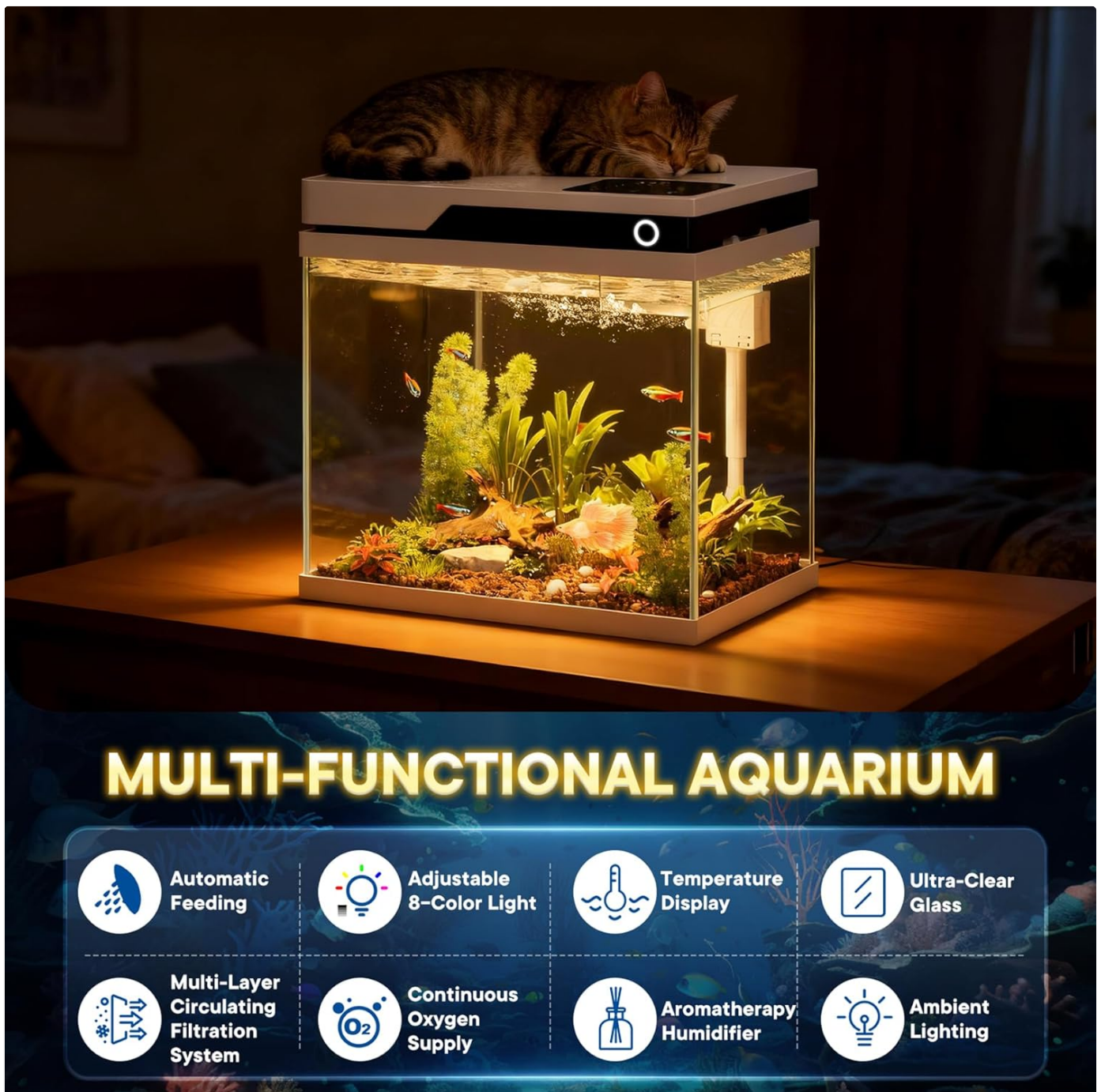
Image: Overview of the Vehipa Smart Fish Aquarium Kit, highlighting its multi-functional features including automatic feeding, adjustable lighting, temperature display, ultra-clear glass, multi-layer filtration, continuous oxygen supply, aromatherapy humidifier, and ambient lighting.