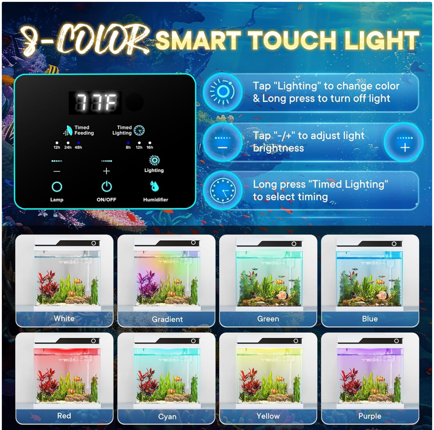
Image: Close-up of the smart touch control panel, showing options for timed feeding, timed lighting, lamp control, on/off, humidifier, and light brightness adjustment. Examples of 8 different LED colors are also shown.

The aquarium features an integrated control panel on the top lid for easy management of its functions. The LCD displays the current water temperature.