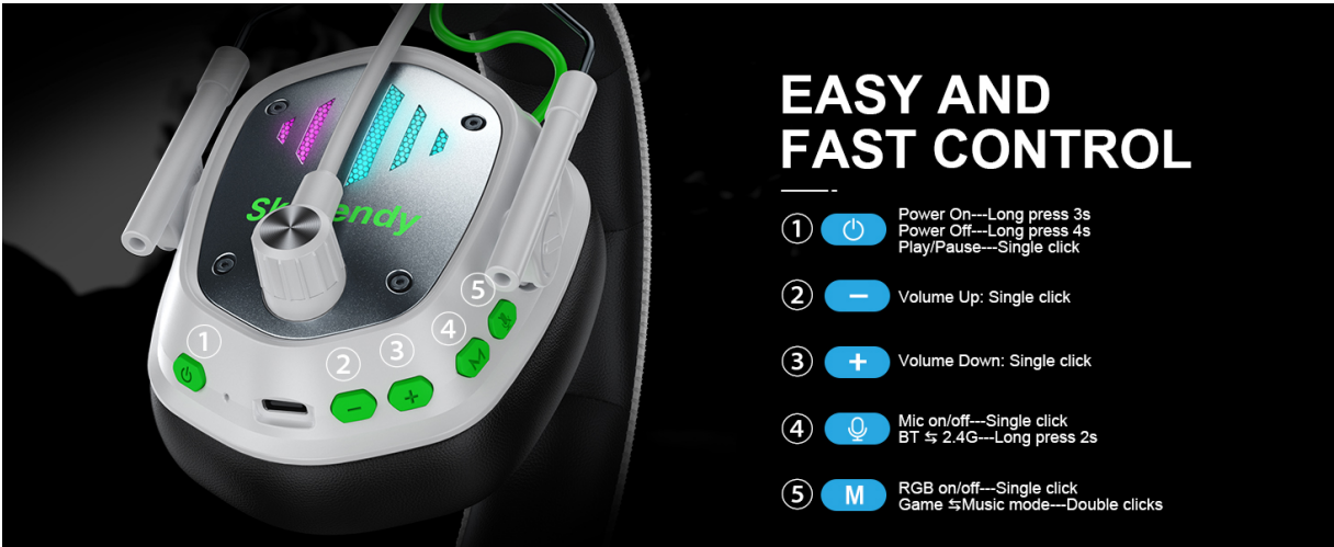
Image: Diagram detailing the control buttons and their functions on the headset.