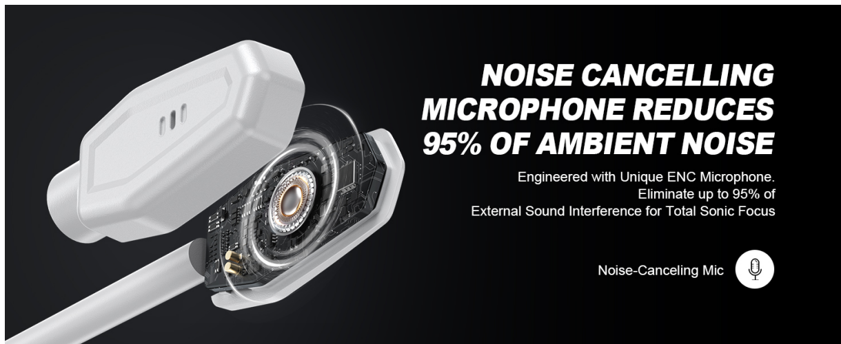
Image: Illustration of the noise-cancelling microphone technology.