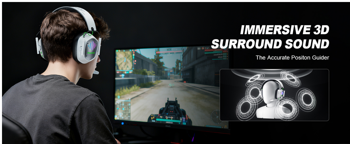
Image: Visual highlighting the immersive 3D surround sound feature.