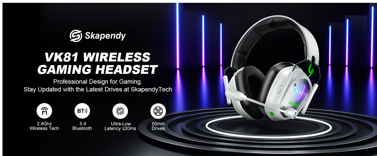
Image: SKAPENDY VK81 Wireless Gaming Headset overview.

Thank you for choosing the SKAPENDY VK81 Wireless Gaming Headset. This manual provides essential information for setting up, operating, and maintaining your headset to ensure an optimal gaming and audio experience. Please read this manual thoroughly before use and retain it for future reference.