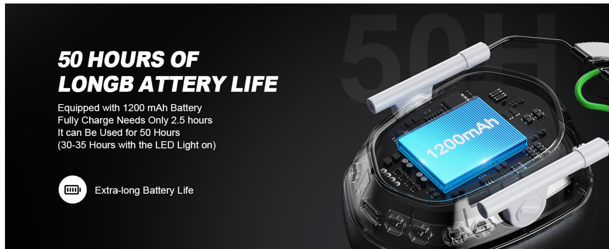
Image: Visual representation of headset charging and battery life.

Before first use, fully charge your headset using the provided Type-C cable. A full charge takes approximately 2.5 hours. The 1200mAh battery provides up to 50 hours of playtime without RGB lighting or 40 hours with RGB lighting enabled. A low battery alarm will notify you when charging is needed.