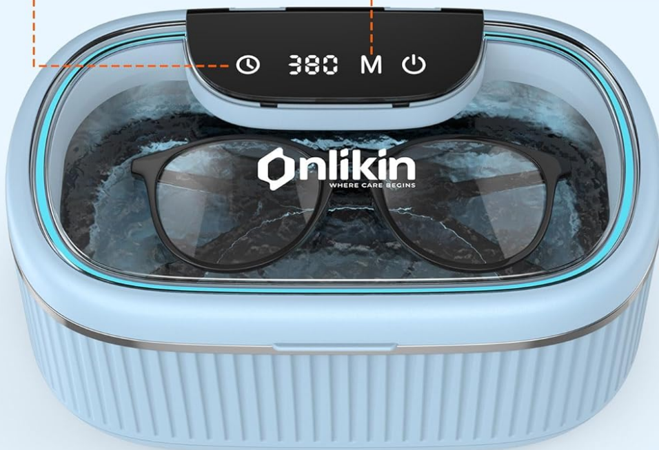
Figure 7: Time and power settings.