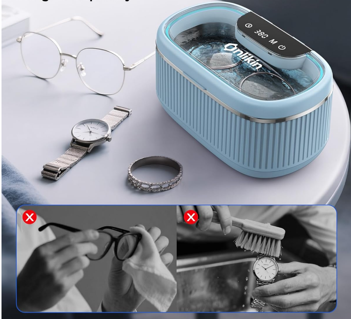
Figure 2: High-frequency ultrasonic cleaning action.