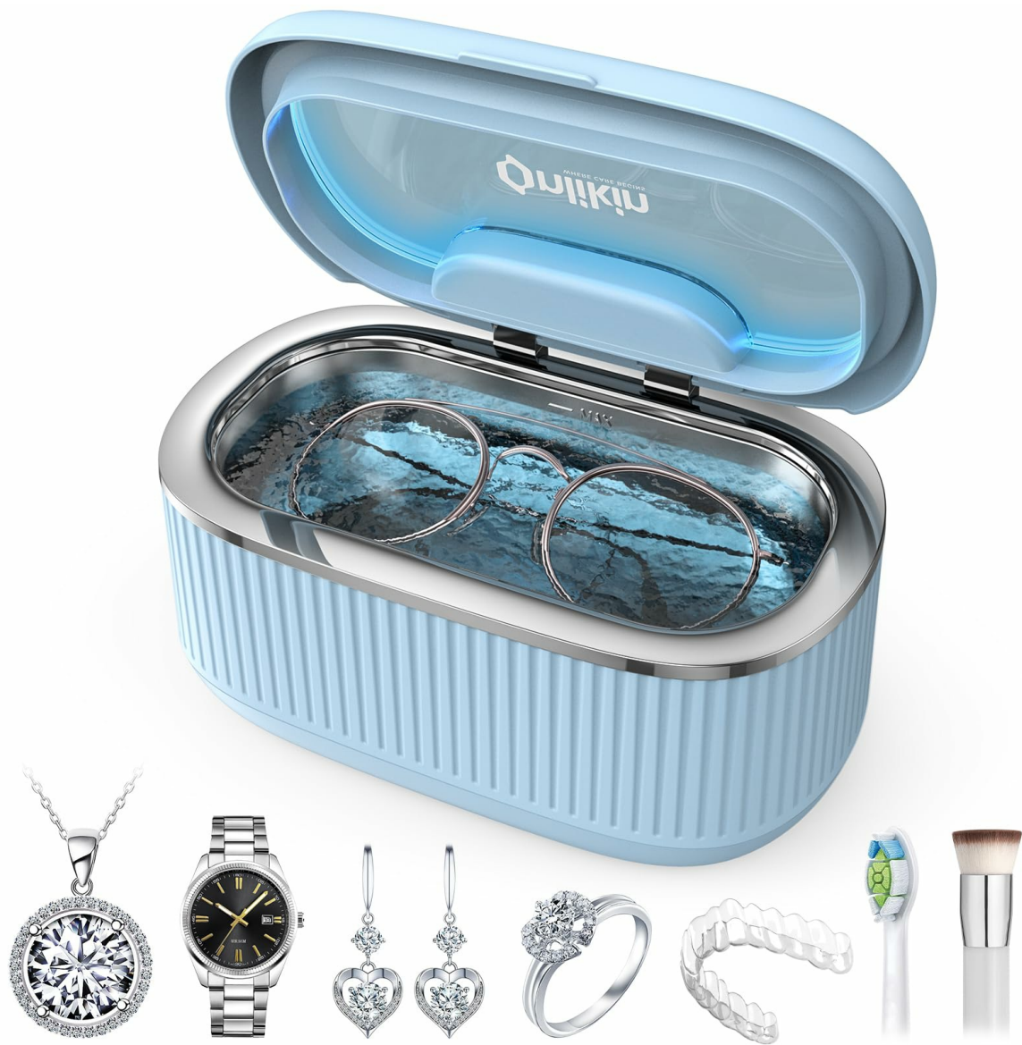
Figure 1: Onlikin HCU01A Ultrasonic Jewelry Cleaner.