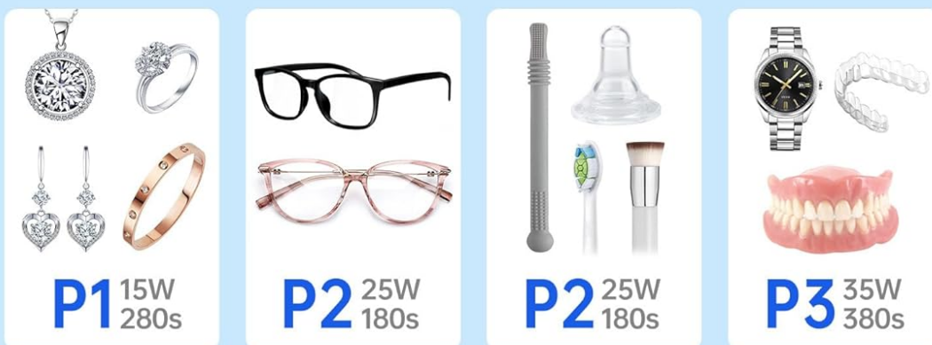
Figure 6: Examples of items suitable for cleaning.