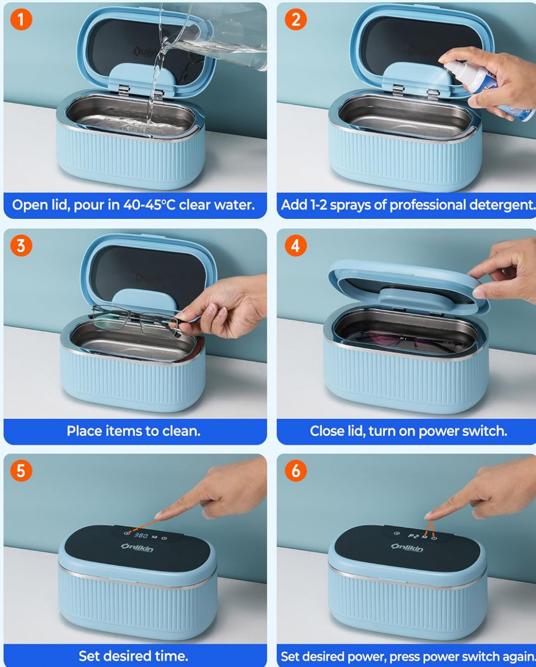
Figure 5: Step-by-step setup and operation guide.