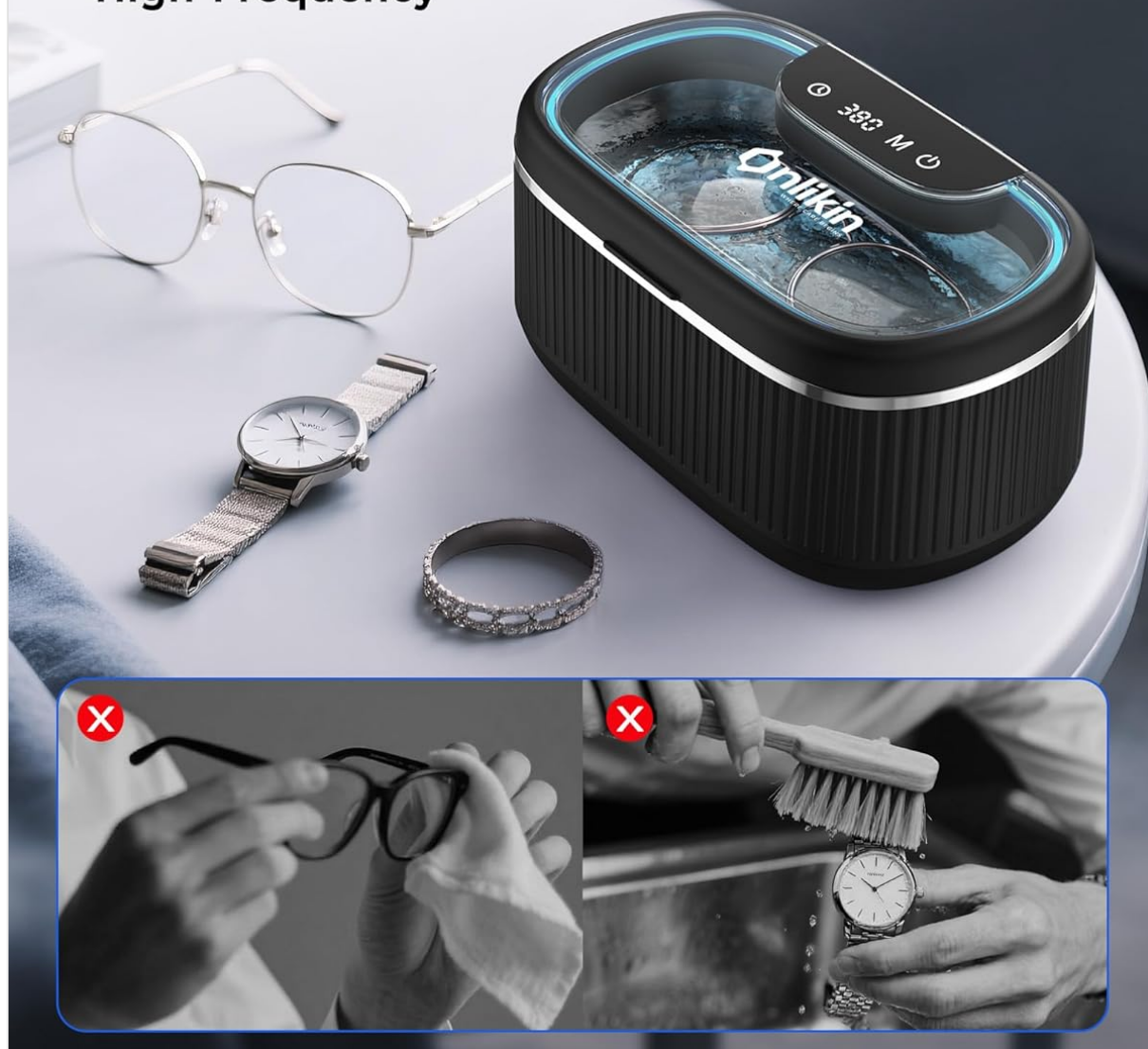
Figure 4: Professional-Grade Cleaning for Various Items