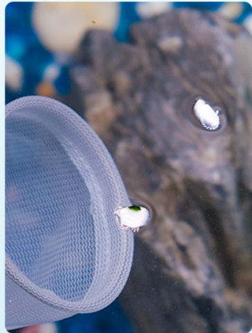
Ladle Out Wastes

Image 6.1: Visual representation of the net's dimensions, including net diameter and handle length.