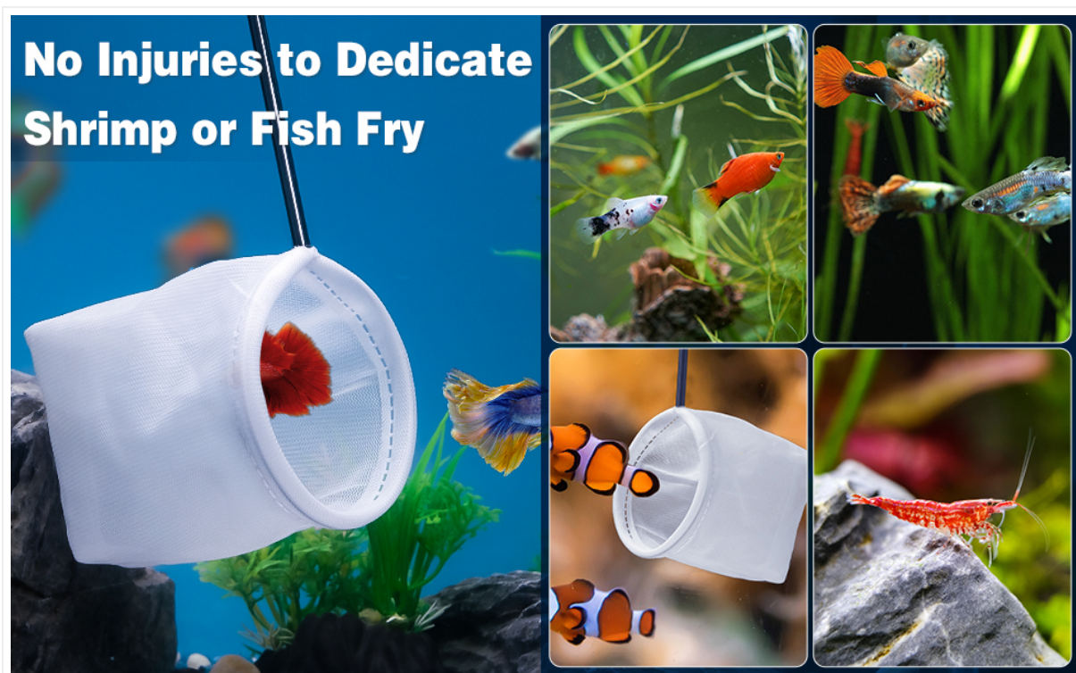
Image 1.1: The Pawfly Aquarium Shrimp Net highlighting its strengthened frame and durable stainless steel rod.

The Pawfly 3 Inch Aquarium Shrimp Net is designed for delicate handling of small aquatic life and efficient cleaning of aquariums and small ponds. It features an extendable stainless steel handle and a soft, fine nylon mesh net.