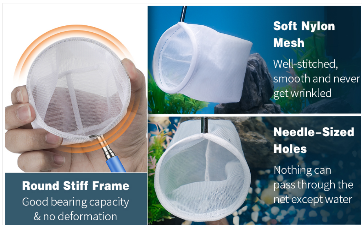
Image 3.1: The fine nylon mesh net designed for safe and gentle handling of delicate aquatic creatures.