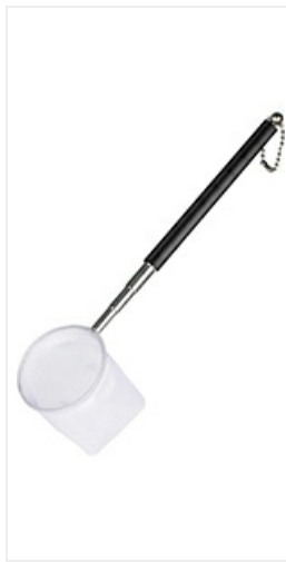
Image 2.1: The telescopic handle extended, illustrating its reach for deeper tanks.