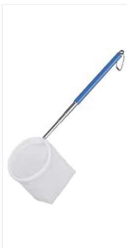
Image 3.2: The net's versatility for skimming various types of debris and waste from aquariums.