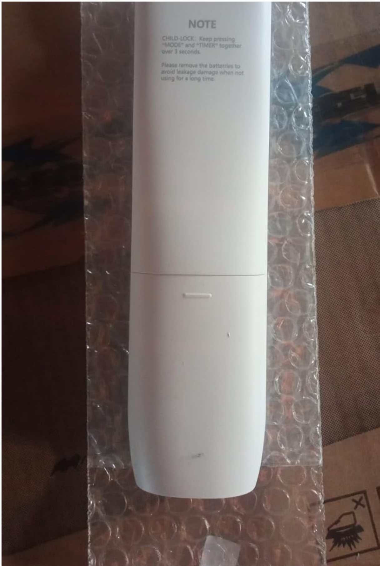
Figure 1: Back view of the remote control with battery compartment.