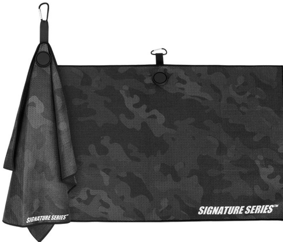
Image: The Signature Series Magnetic Golf Towel, also part of the bundle.