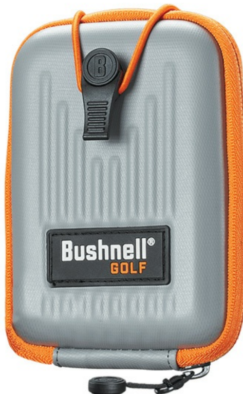
Image: The premium carry case, designed to protect the rangefinder.