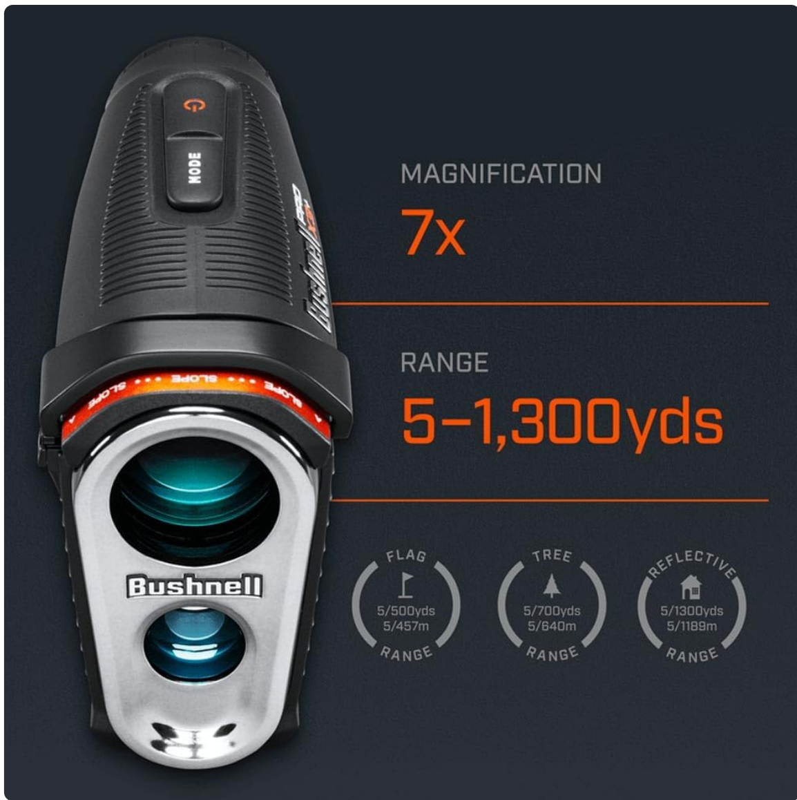
Image: Bushnell Golf Pro X3+Link Laser Rangefinder, showcasing its compact design and optical components.