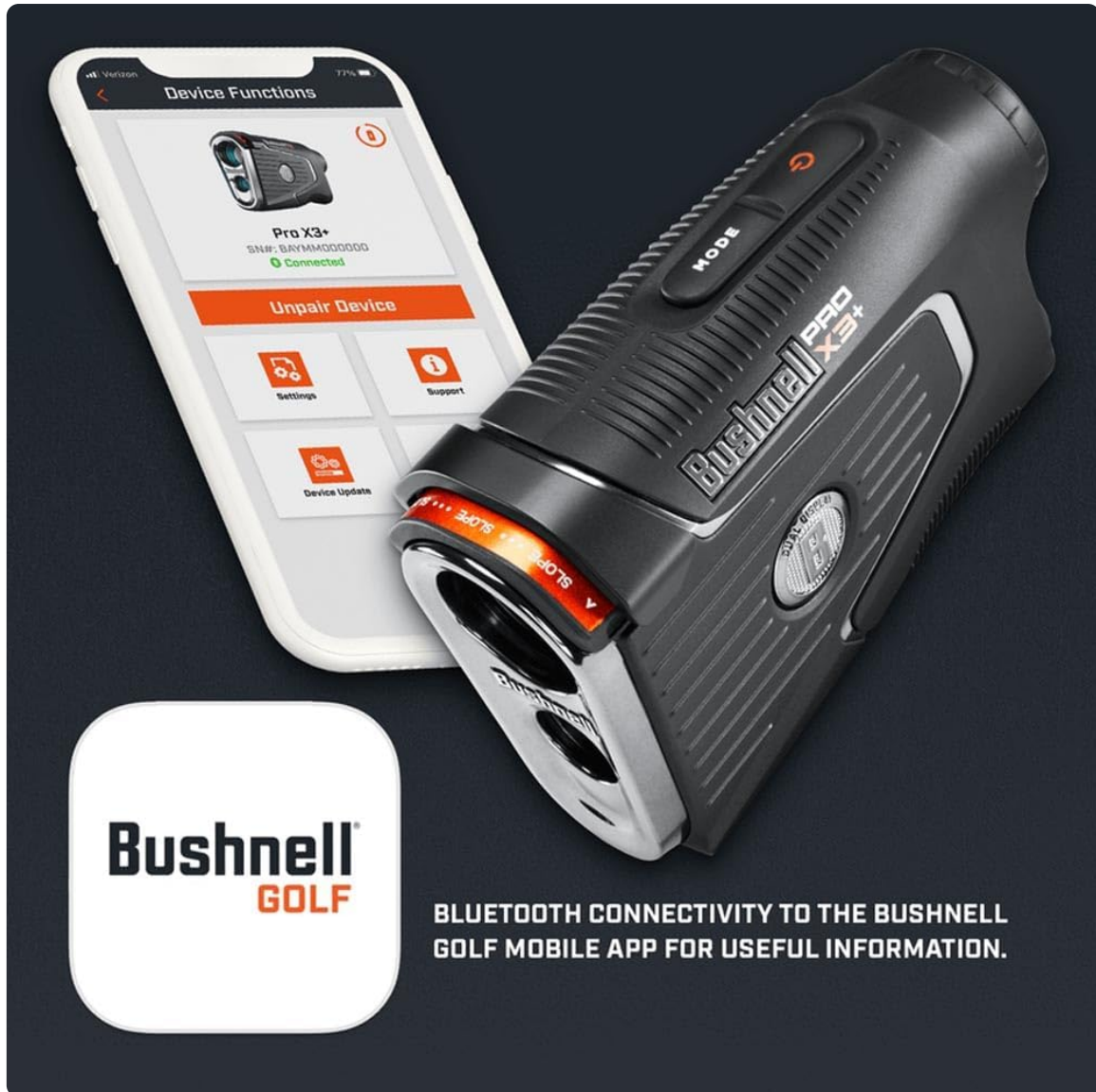
Image: The Bushnell Golf Pro X3+Link rangefinder next to a smartphone displaying the Bushnell Golf app interface, indicating Bluetooth connectivity.

For full functionality, including wind speed/direction and personalized club recommendations, download the Bushnell Golf app on your smartphone. Enable Bluetooth on your phone and follow the app's instructions to pair with your Pro X3+Link rangefinder.