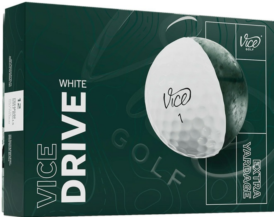
Image: A dozen Vice Drive Golf Balls, included in the bundle.