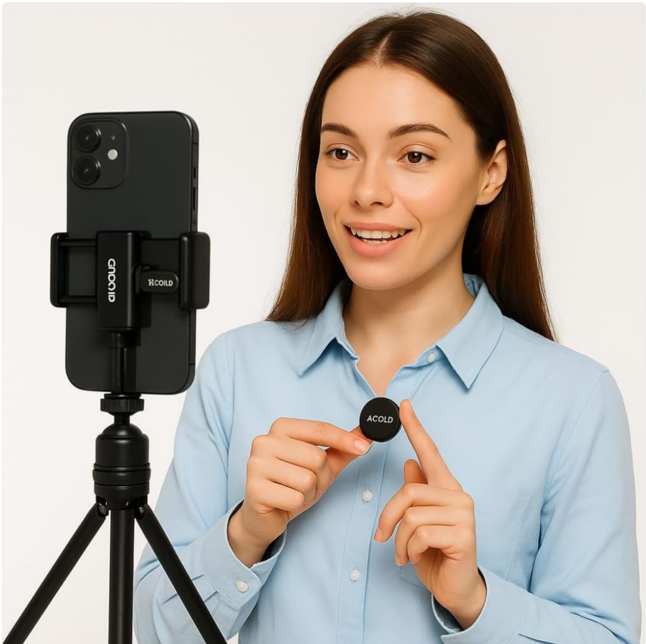
Figure 4.1: A woman is demonstrating the use of the A'GOLD MCF-38D wireless microphone system. She holds a microphone while the receiver is plugged into a smartphone mounted on a tripod, illustrating a typical recording setup.