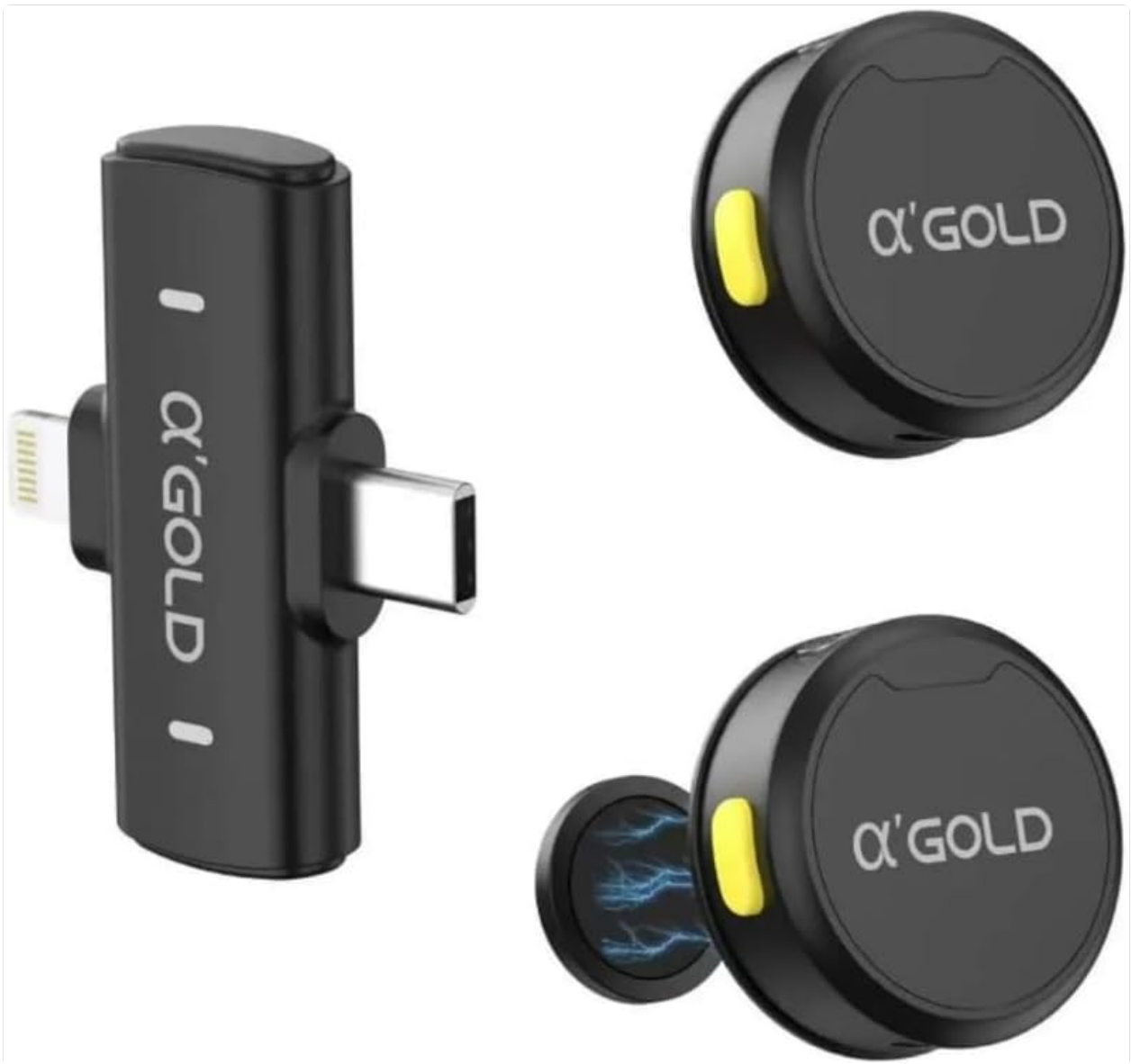
Figure 3.1: This image displays the A'GOLD MCF-38D Wireless Lavalier Microphone system, including two black circular microphones with yellow accents and a dual-connector receiver featuring both USB-C and Lightning ports. The receiver is designed to plug directly into a smartphone or tablet.