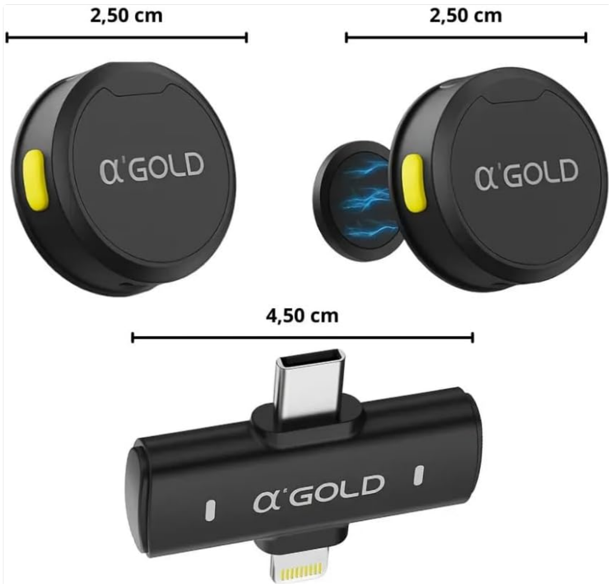
Figure 3.2: This image illustrates the dimensions of the A'GOLD MCF-38D microphone and receiver. Each microphone measures 2.50 cm in diameter. The receiver measures 4.50 cm in length, highlighting the compact size of the devices.