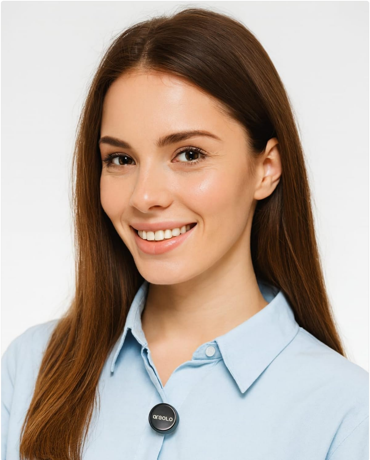
Figure 5.1: A close-up image of a woman wearing the A'GOLD MCF-38D wireless microphone clipped to her shirt collar, showcasing its discreet placement and readiness for use.