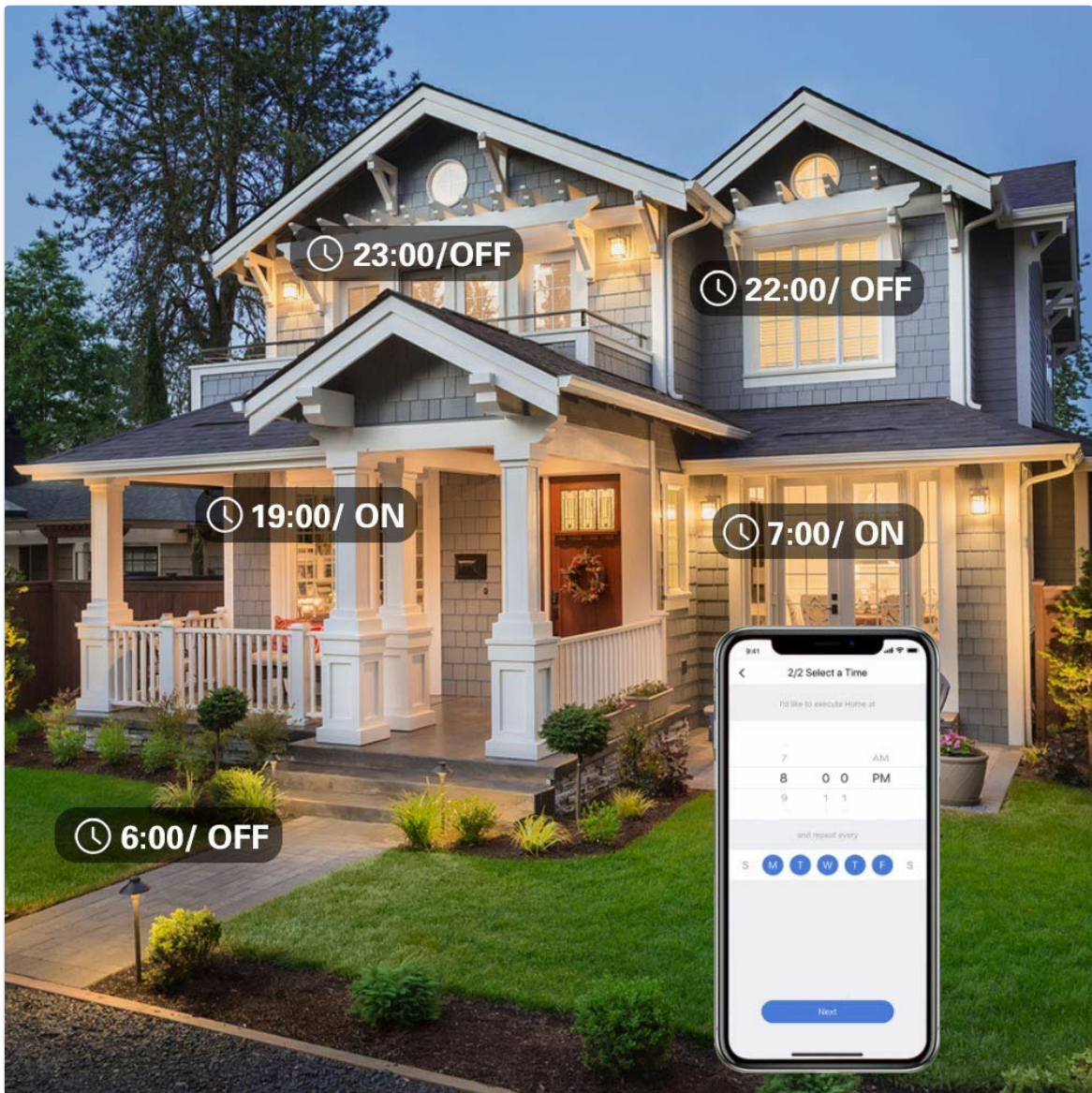
Image 4: Example of setting schedules for outdoor lights using the app.