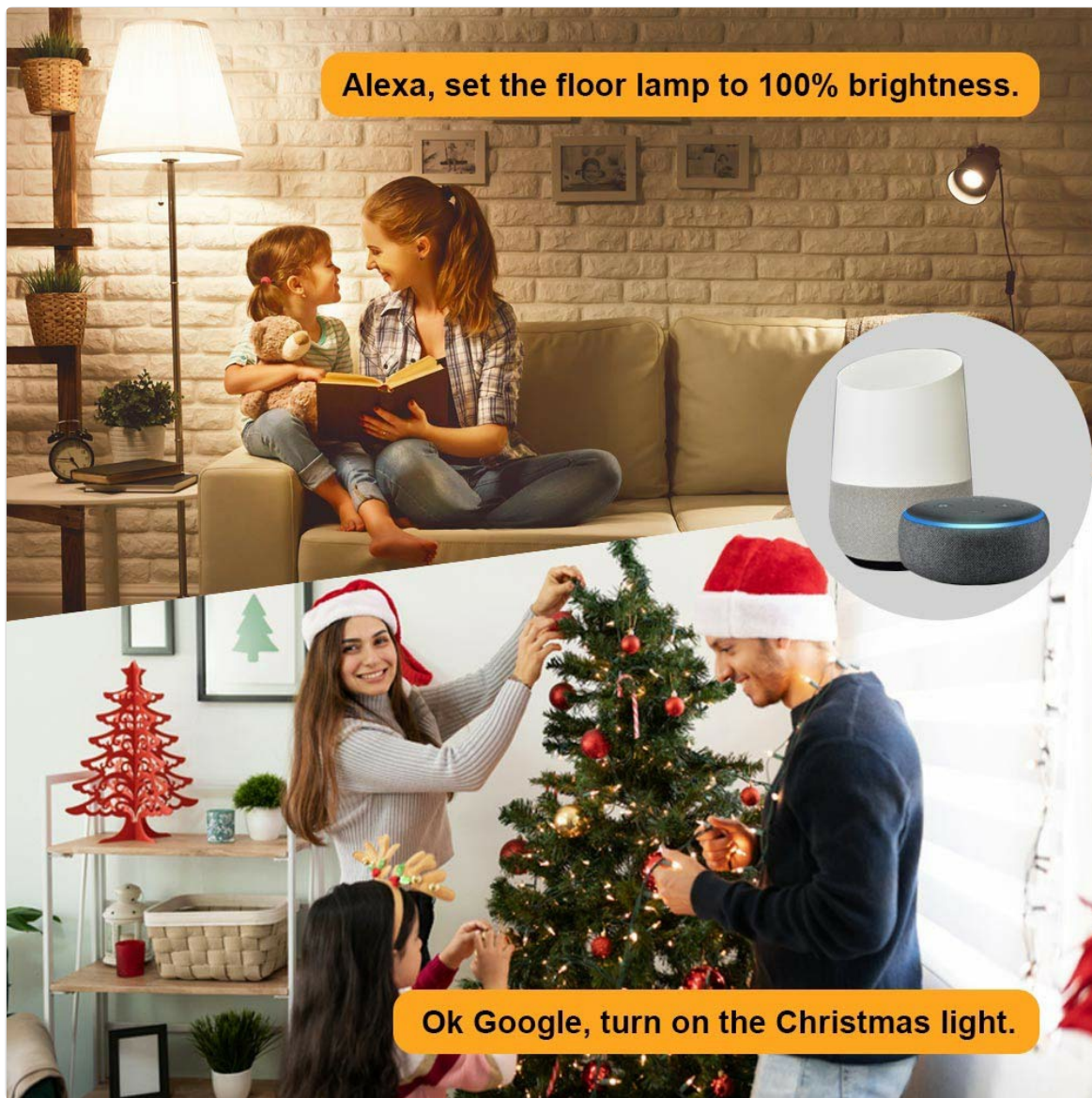
Image 5: Voice control in action, demonstrating interaction with Alexa and Google Home for lighting adjustments.