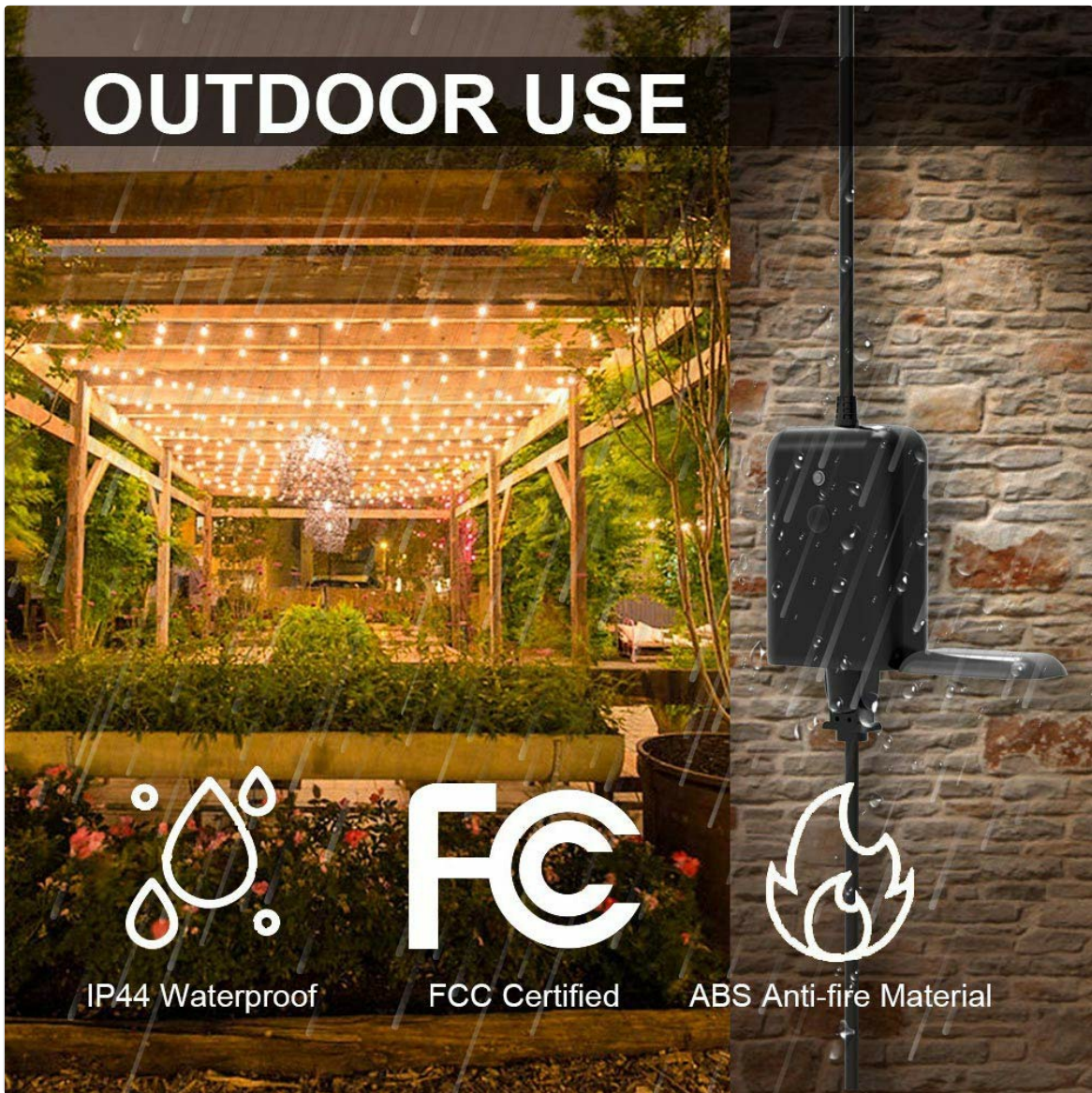
Image 3: Remote control of outdoor lighting via the smartphone application.