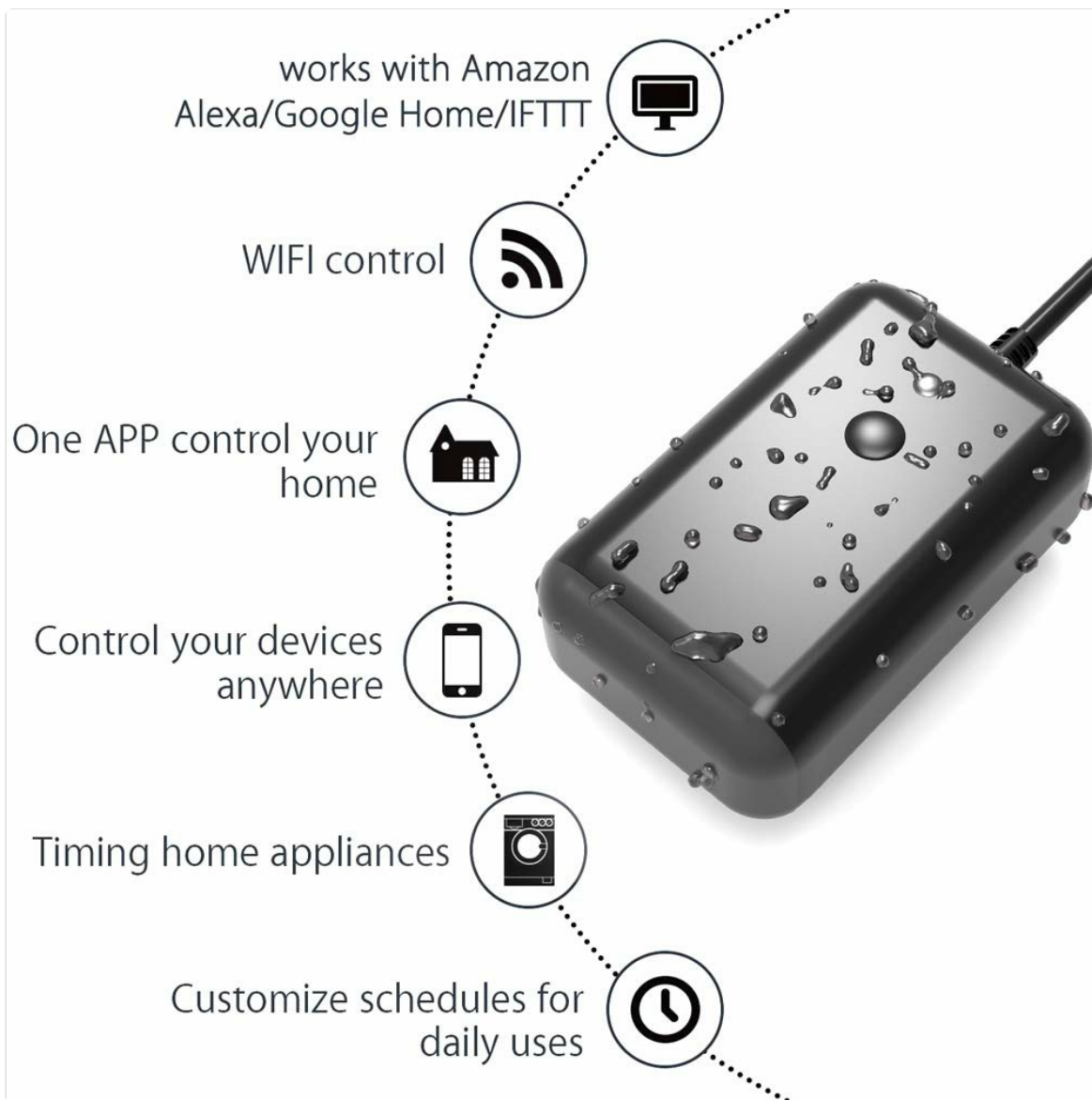
Image 2: Diagram illustrating the smart features of the dimmer, including Wi-Fi control, app control, timing, and compatibility with Alexa/Google Home.