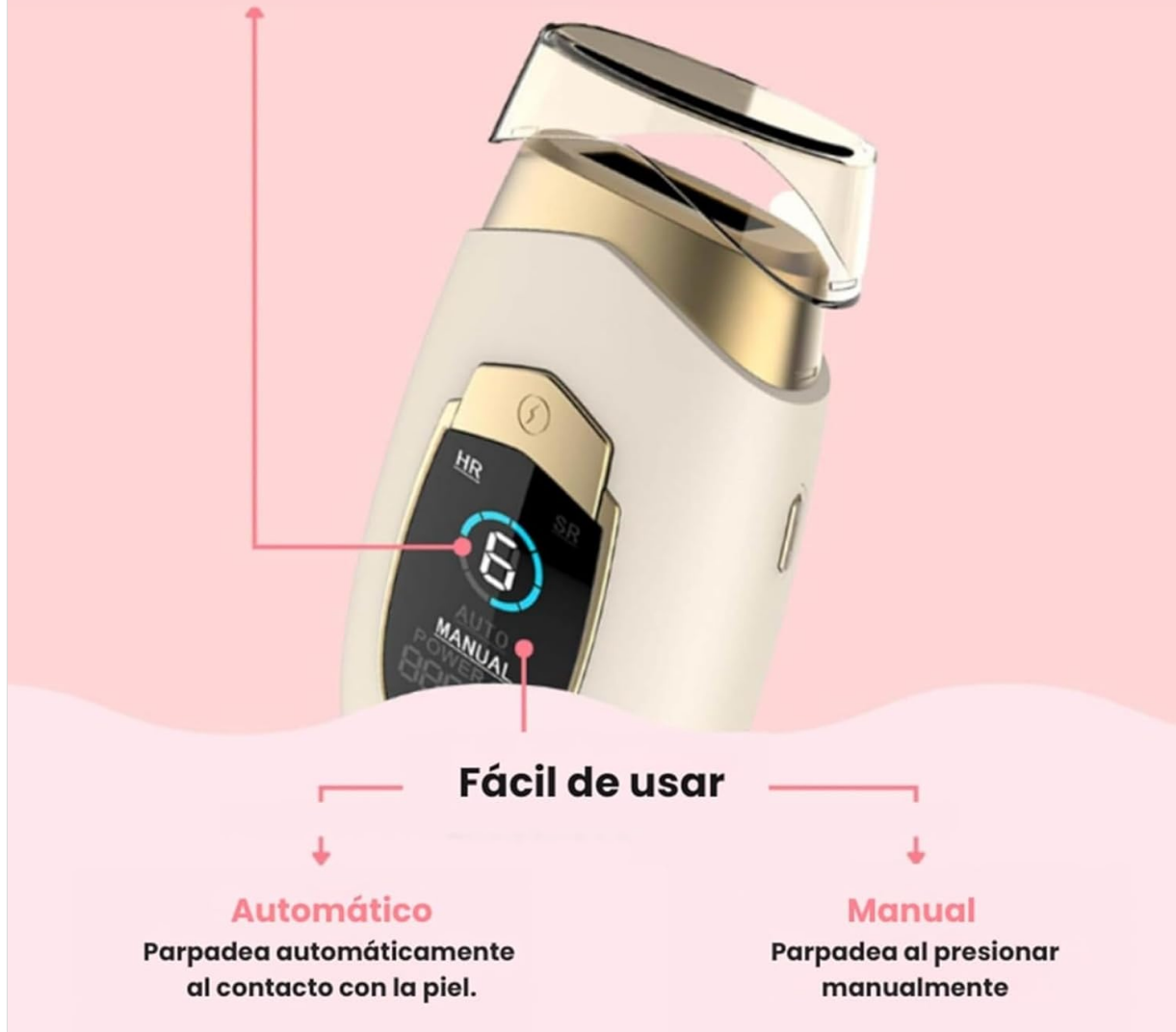
Image 2: Device display and mode selection. This image illustrates the device's LCD screen showing the selected energy level (e.g., 6) and the two operating modes: Automatic (flashes automatically upon skin contact) and Manual (flashes when the button is pressed).