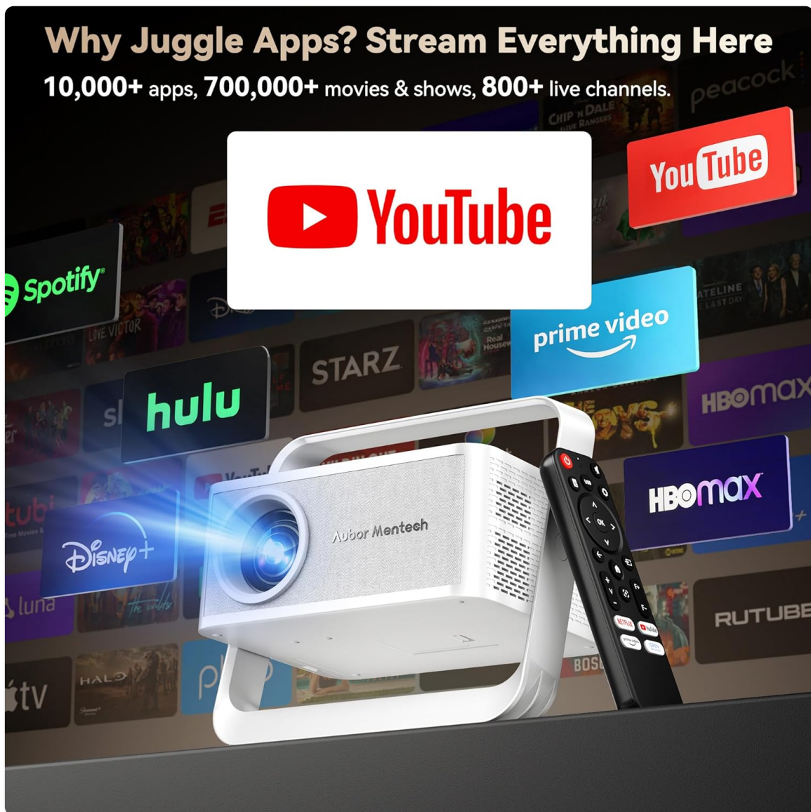
Image: The AUBOR MENTECH P7 Smart Projector, showcasing its compact design and the variety of streaming services it supports.

including wall or ceiling projection. Connect the power cord to the projector and then to a power outlet.