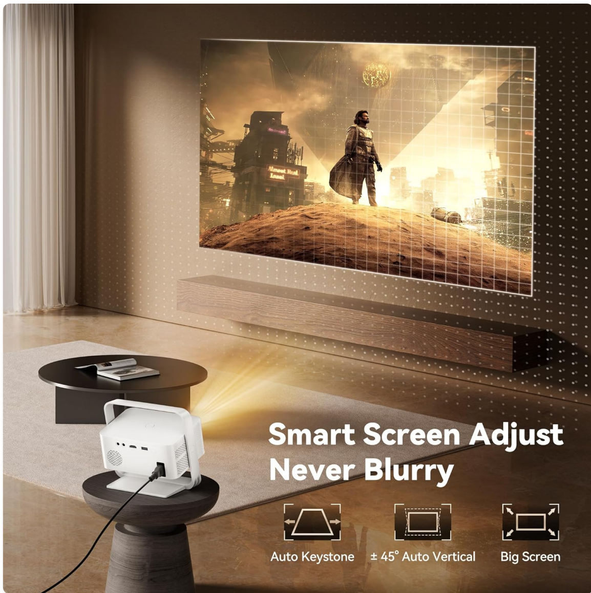
Image: The AUBOR MENTECH P7 Projector displaying a perfectly aligned image on a wall, highlighting its automatic keystone and vertical correction capabilities for a clear, blur-free picture.