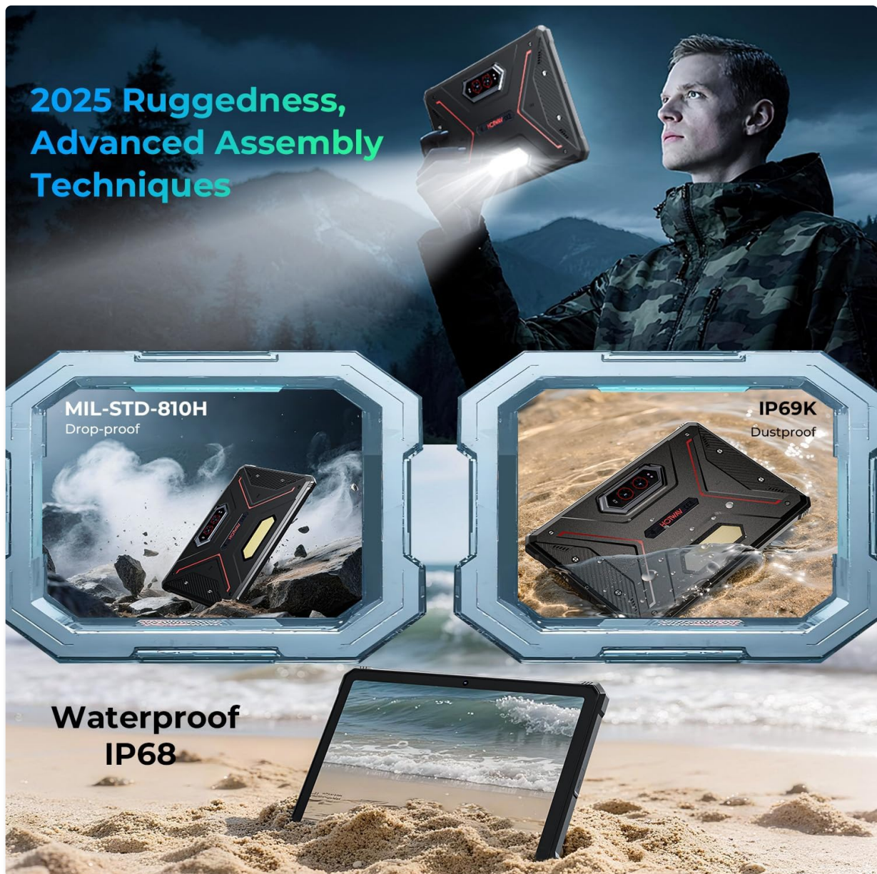
Image 5.6: The tablet's robust design, highlighting its resistance to drops, water, and dust.