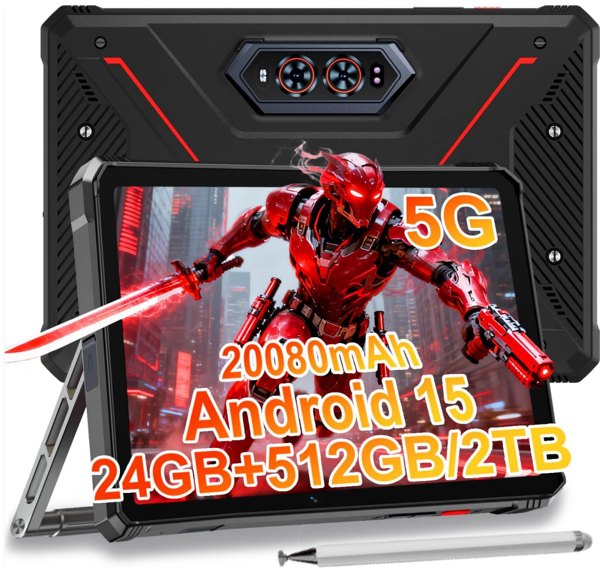
Image 1.1: The HOTWAV R9 Ultra 5G Rugged Tablet with its included stylus and stand.