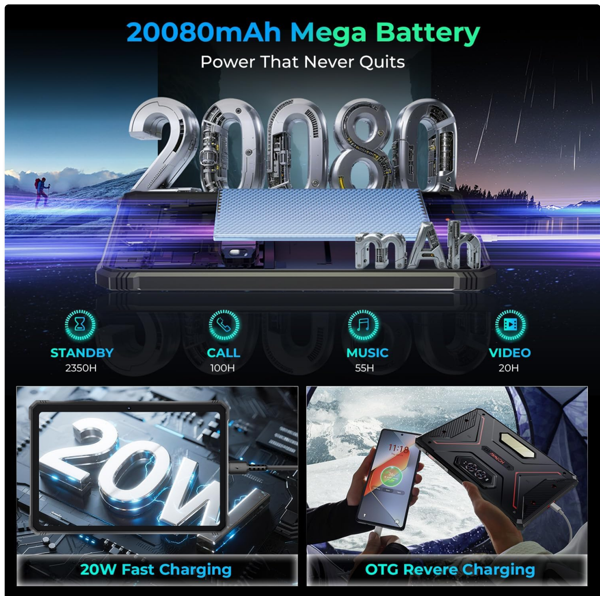
Image 5.3: Visual representation of the 20080mAh battery and 20W fast charging.