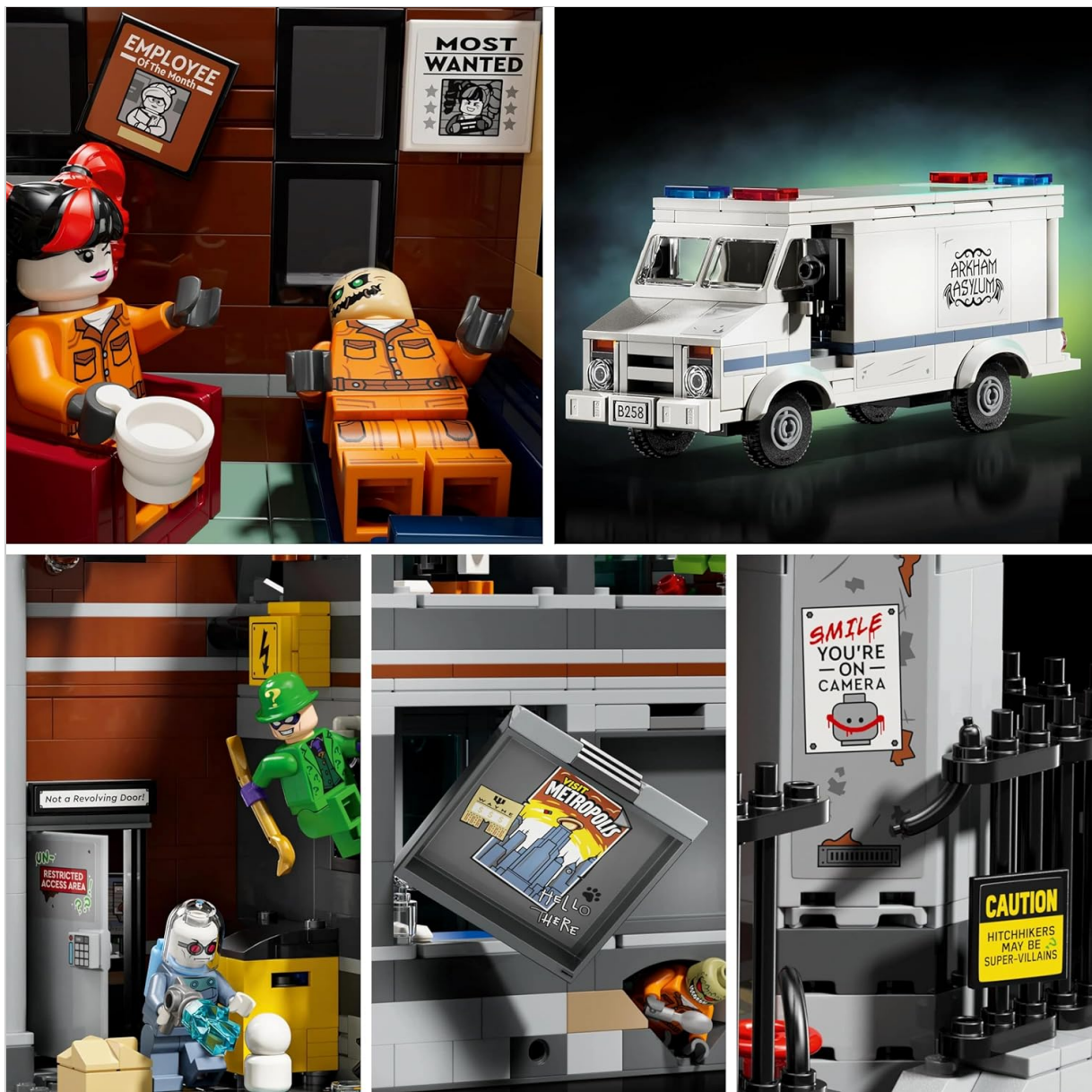
Image: A collage showcasing various interactive elements and detailed sections of the Arkham Asylum set, including the prisoner vehicle.