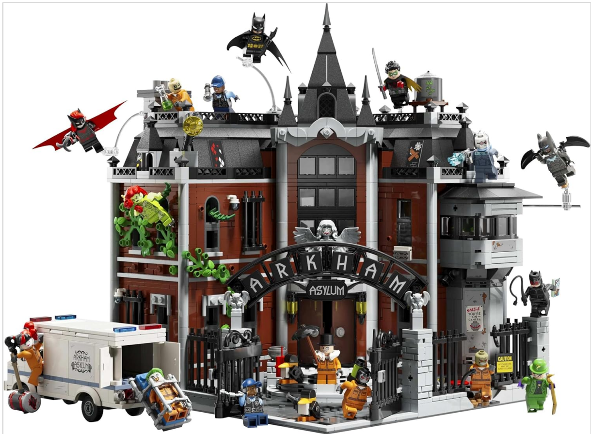
Image: The complete LEGO Arkham Asylum set, showcasing the detailed building, multiple minifigures, and the prisoner transport vehicle.