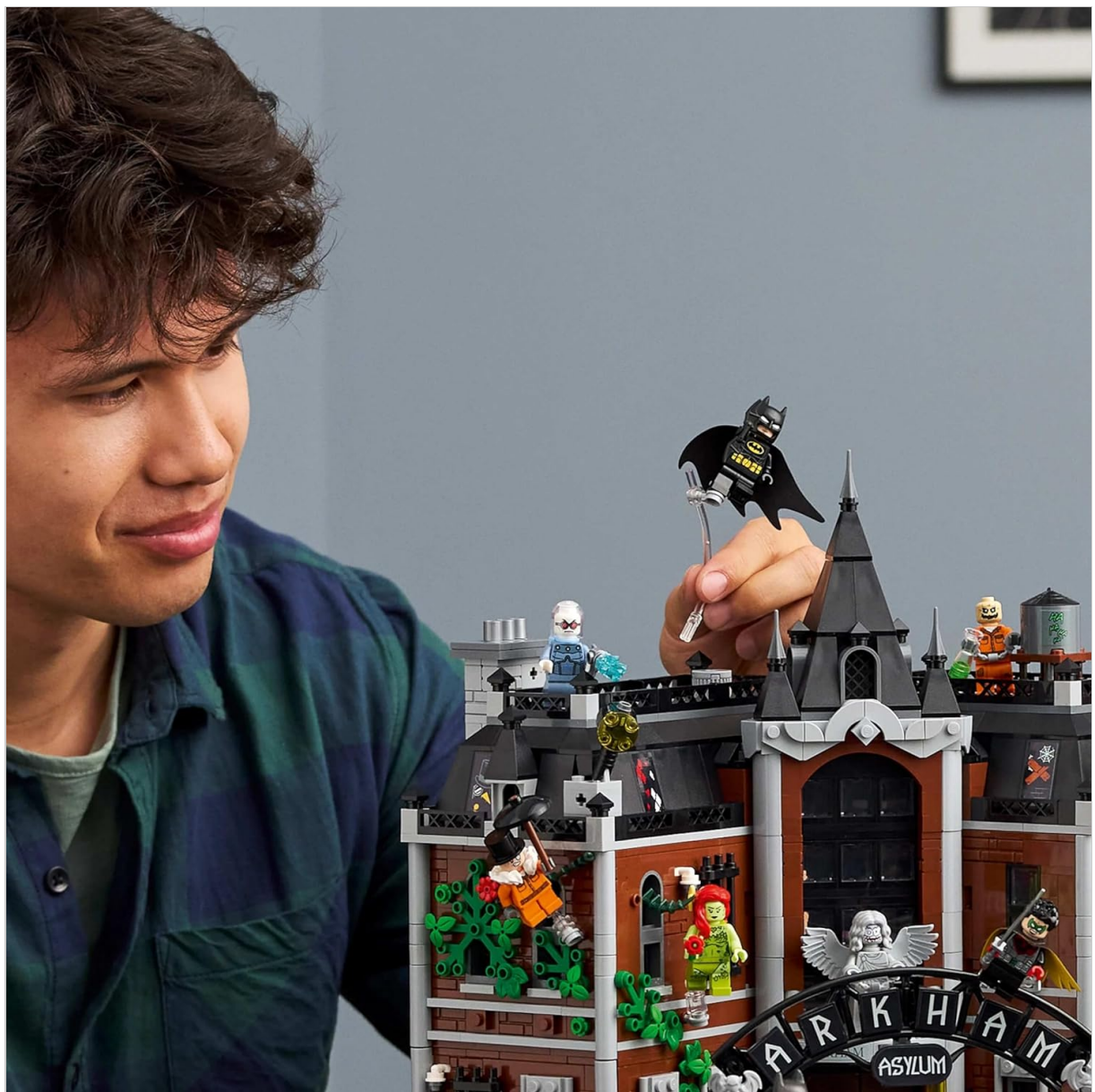
Image: A collection of minifigures from the set, ready for display or interactive play scenarios.