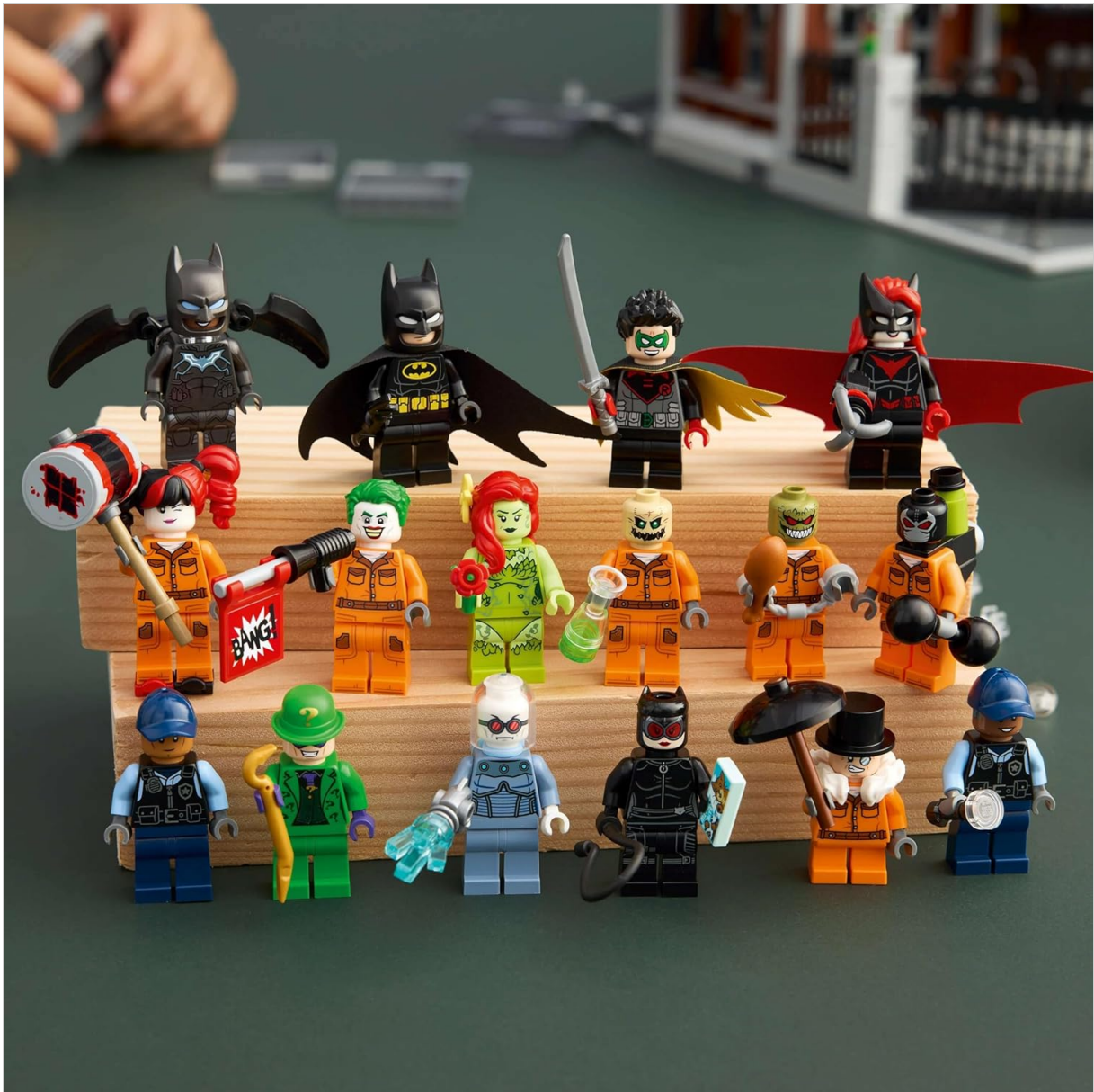
Image: A builder engaged in the assembly of the LEGO Arkham Asylum, highlighting the detailed nature of the construction.