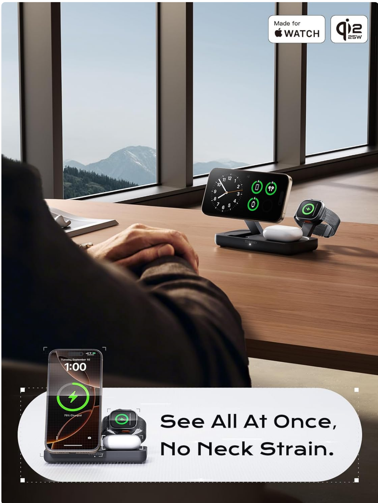
Figure 4.4: iPhone in StandBy mode on the charging station.