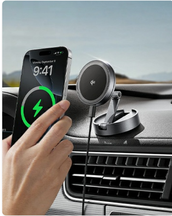
Figure 3.1: Unfolding the charging station for use.

their upright positions. Ensure they are securely locked into place.