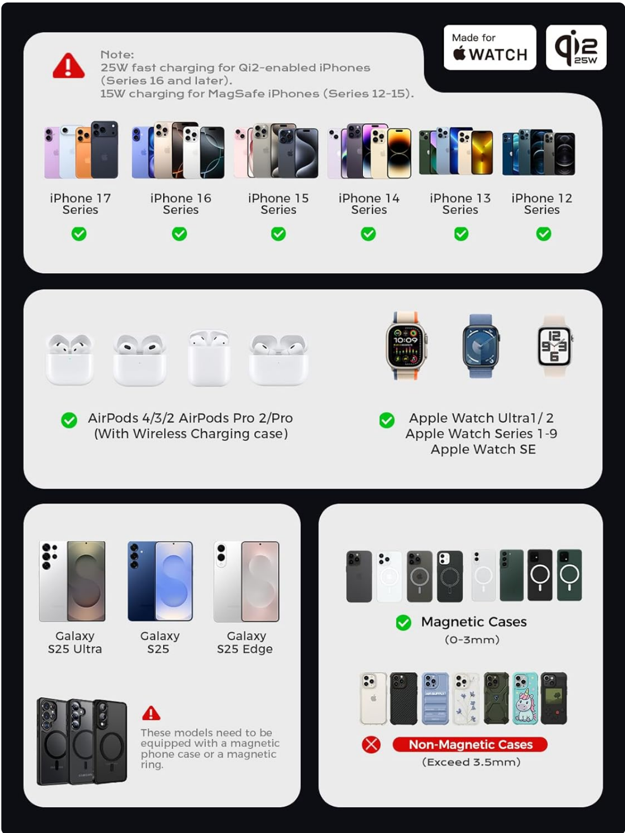
Figure 6.1: Device compatibility chart.