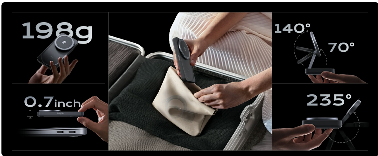
Figure 5.4: Foldable and travel-ready design.