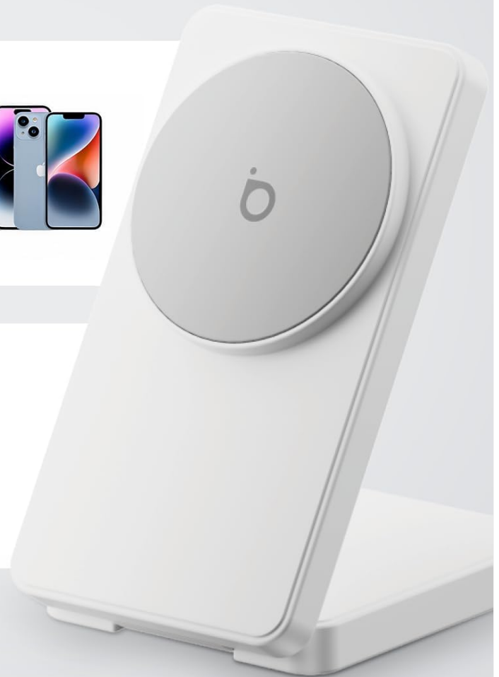
Image: Visual representation of the charger's compatibility with iPhone 12 and newer models, and various AirPods models.