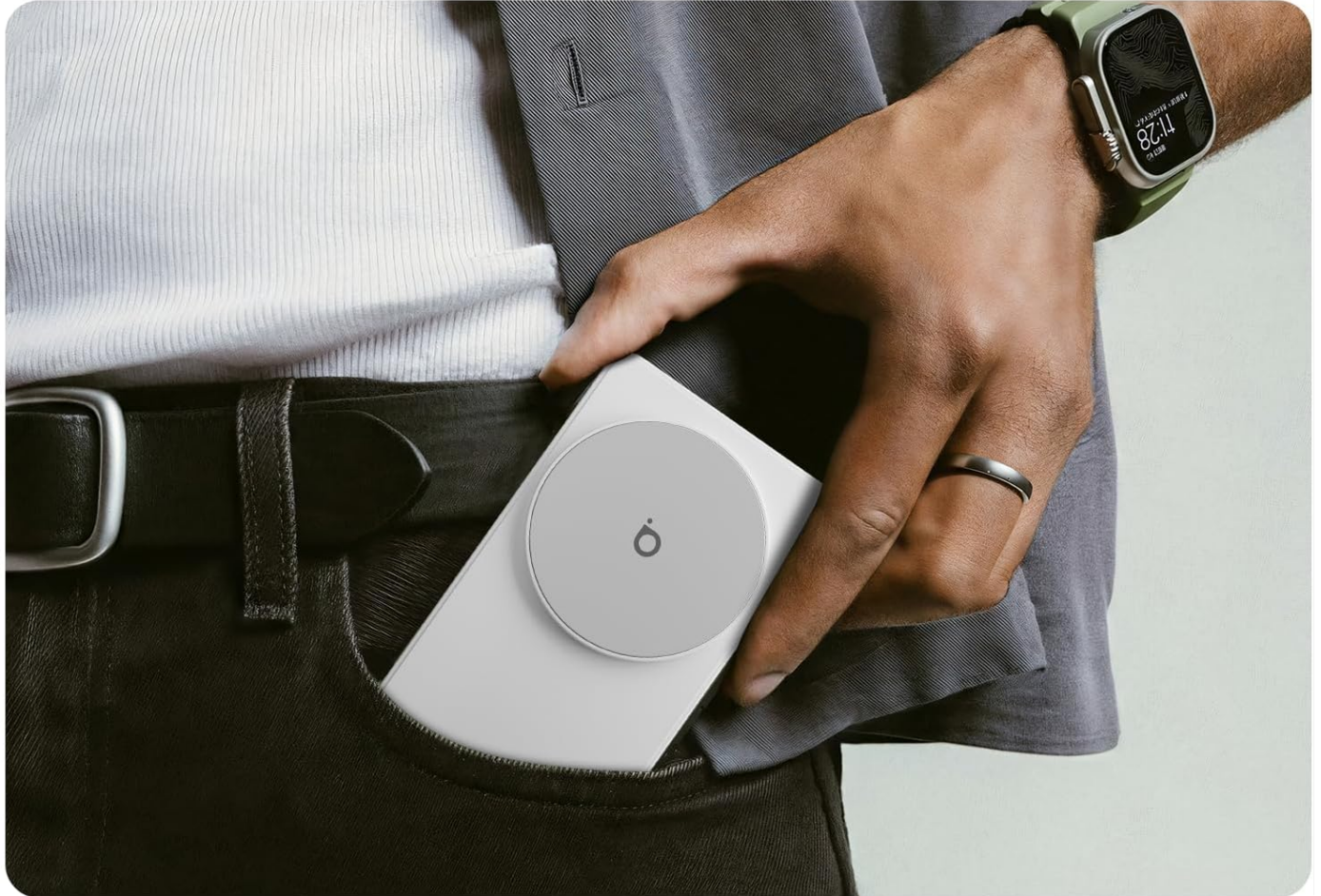
Image: The Basike WXC290 charger shown in its compact, folded state and unfolded as a stand, highlighting its portability.