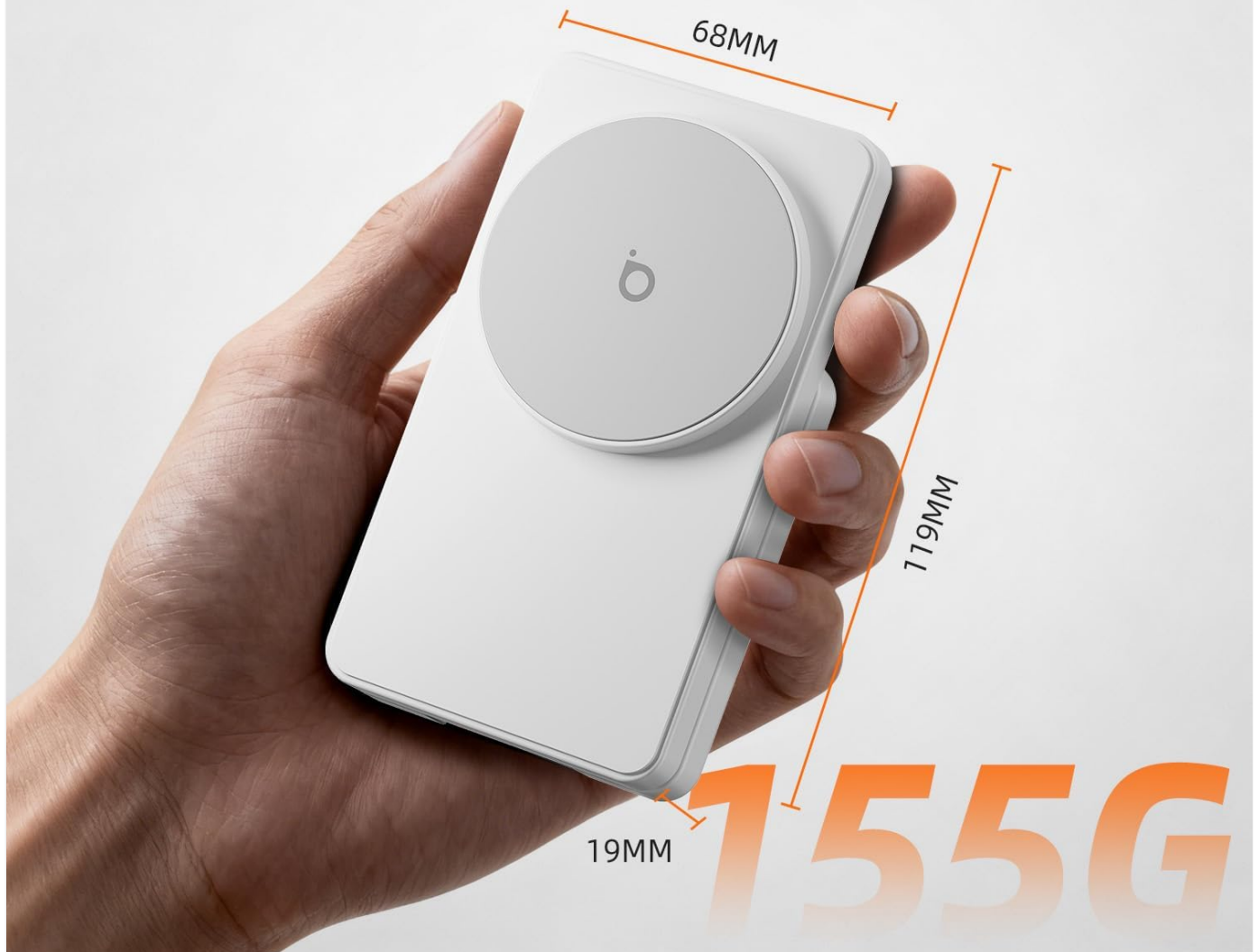
Image: Dimensions (68mm x 119mm x 19mm) and weight (155g) of the Basike WXC290 Wireless Charger.