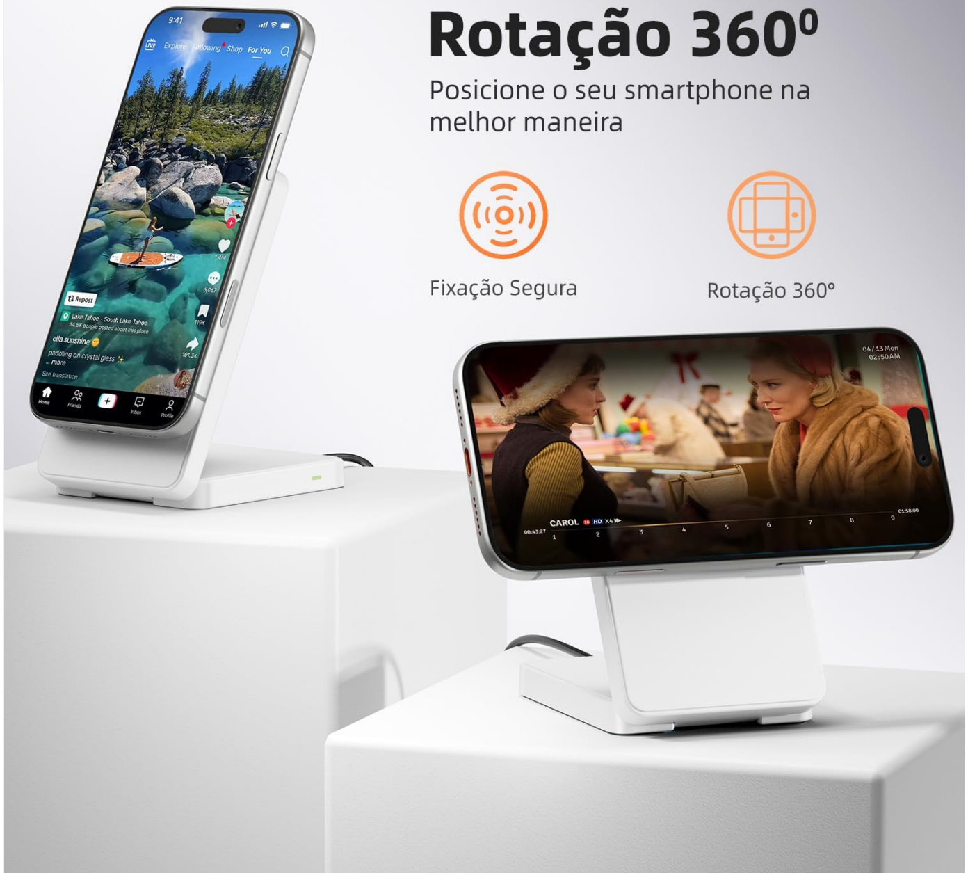
Image: The Basike WXC290 Wireless Charger with its USB-A to Type-C charging cable.