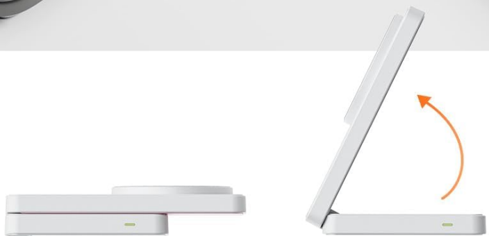
Image: The Basike WXC290 charger connected to a power source via its USB-C cable, ready for use.