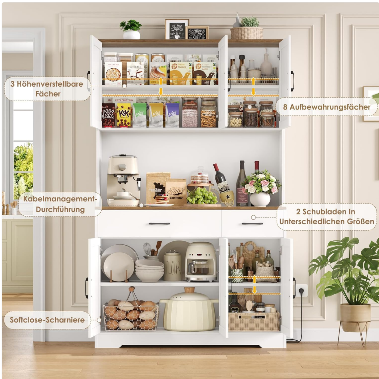
Image 3: Internal storage and features. This view showcases the cabinet's interior, including the upper compartments with adjustable shelves, the central worktop area with cable management, and the lower cabinets and drawers, demonstrating its storage versatility.