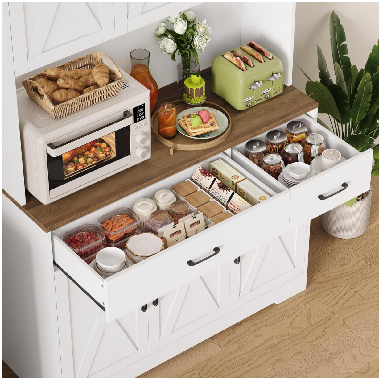
Image 4: HOCSOK Kitchen Buffet Cabinet in a kitchen setting. This image displays the cabinet with a microwave and toaster on its worktop, and its drawers open, revealing organized storage for various kitchen essentials.