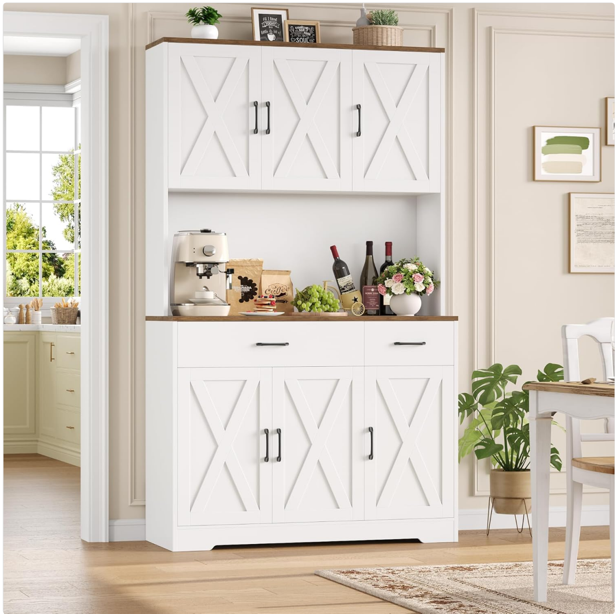
Image 6: Side view of the HOCSOK Kitchen Buffet Cabinet. This image presents the cabinet from a slightly angled perspective, highlighting its depth and how it integrates into a dining room setting, showcasing its versatility beyond just the kitchen.