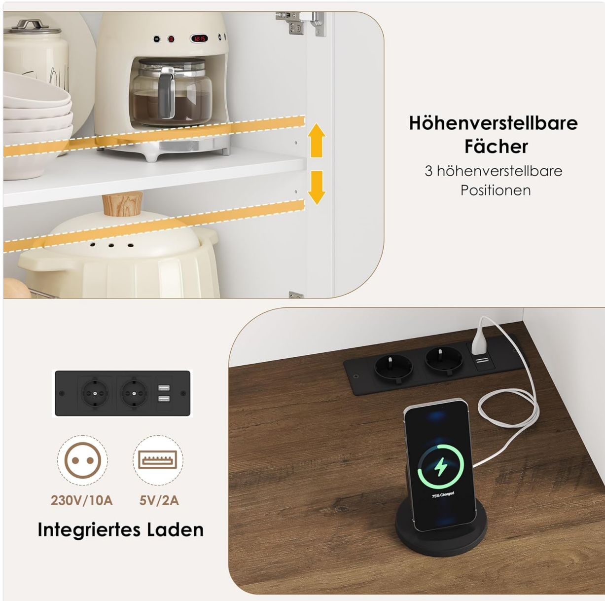
Image 2: Adjustable shelves and integrated charging station. This image highlights the three adjustable height positions for the shelves and provides a detailed view of the built-in electrical sockets and USB ports, along with their power specifications.

The cabinet doors are fitted with soft-close hinges, which prevent slamming and reduce wear and tear. This feature ensures quiet operation and protects your fingers.