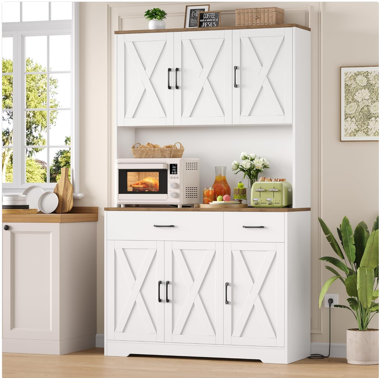
Image 5: Full front view of the HOCSOK Kitchen Buffet Cabinet. This image shows the complete cabinet with its barn-door style panels, central worktop, and overall design in a typical kitchen environment.