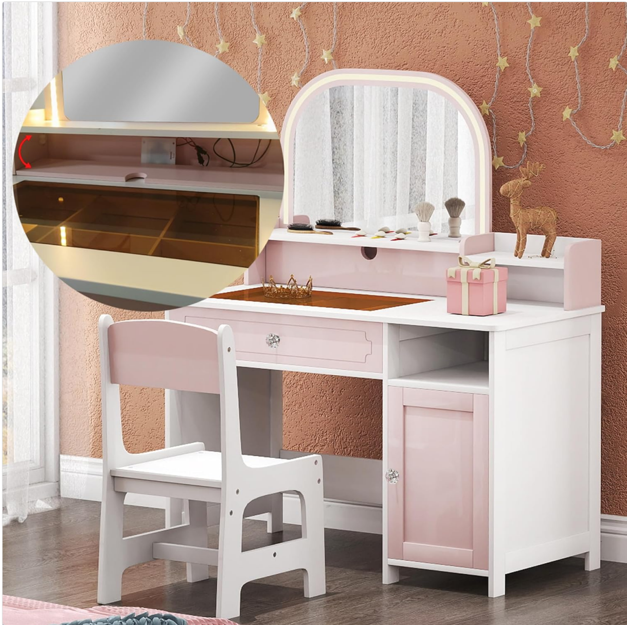
Figure 4.1: Detail of the LED mirror, crystal handle, and display glass.