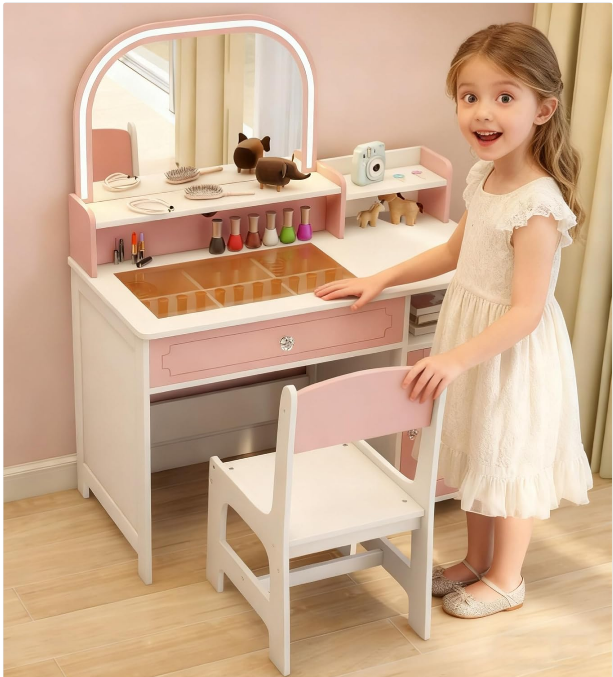
Figure 3.1: Overview of the TaoHFE Pink Kids Vanity Table and Chair Set.