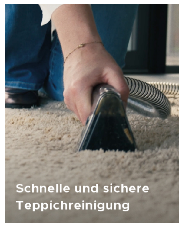
Image: A person demonstrating the use of the Motionflow Pro Steam Cleaner to clean a carpet, showcasing its effectiveness on soft surfaces.