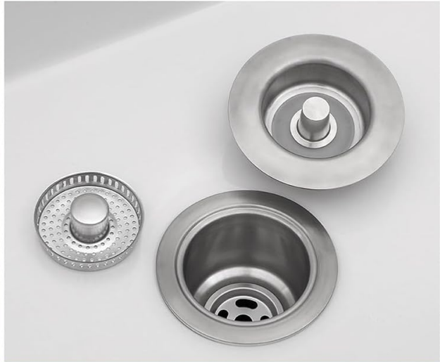
Updated type of drain set