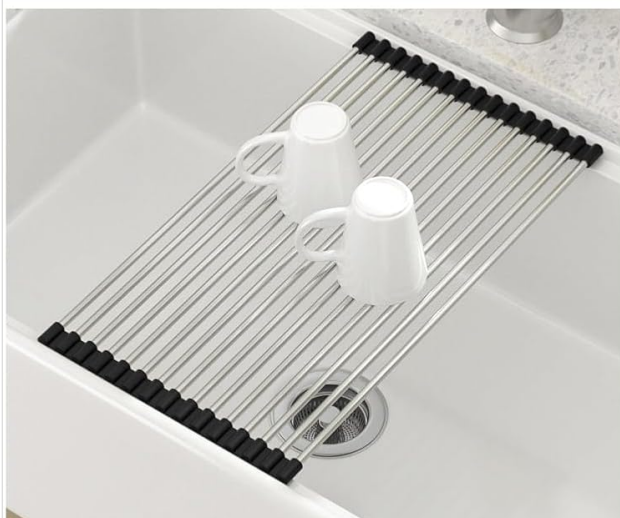
Roll Up Rack