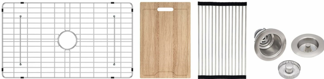
Figure 1: Lordear 33-inch white fireclay farmhouse sink workstation.