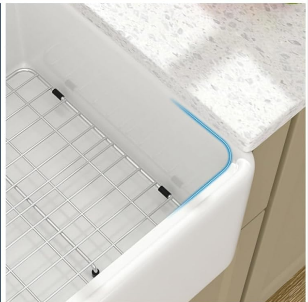
Figure 6: Water flow cushioning and easy cleaning features.

Sleek design with seamless lines reduces dirt accumulation, making it easier to clean.