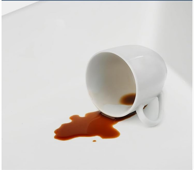
Figure 5: Durability features of the fireclay sink.