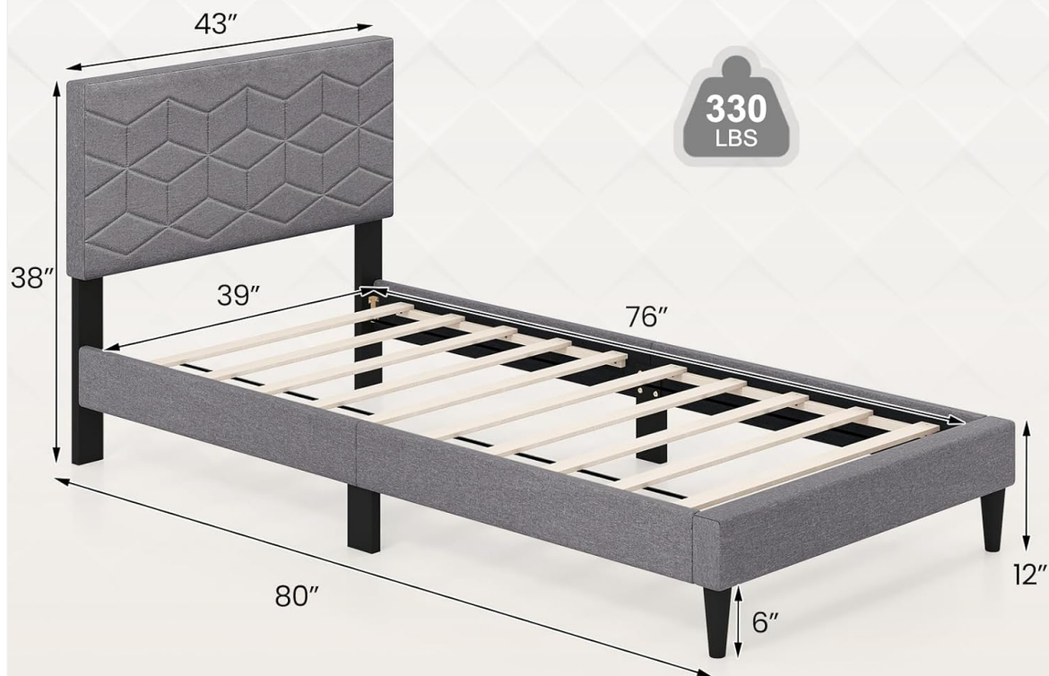
Figure 6: Product Dimensions. This diagram provides a clear visual representation of the bed frame's key measurements, including overall length (80"), width (43"), headboard height (38"), bed surface width (39"), and under-bed clearance (6").