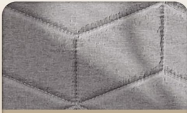
Breathable Linen Fabric

Transform your sleeping space into a haven of luxury and softness