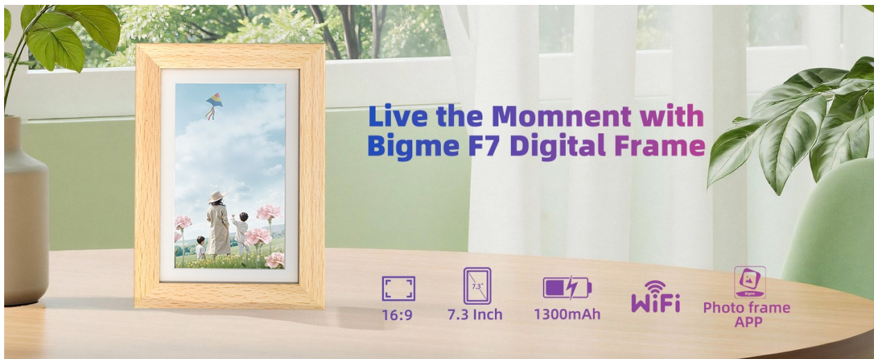
Image: Bigme F7 Digital Photo Frame highlighting 16:9 aspect ratio, 7.3-inch screen, 1300mAh battery, WiFi, and Photo Frame APP support.

The Bigme F7 Digital Photo Frame features a 7-inch color ePaper screen, designed for displaying cherished memories with clarity and energy efficiency. It supports seamless photo sharing via a mobile app and Wi-Fi connectivity, powered by a long-lasting 1300mAh battery. Its sleek wooden design complements various home or office decors.