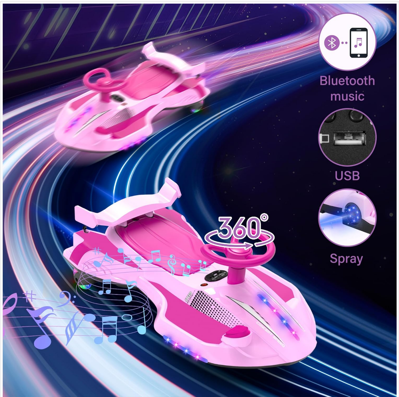
Figure 3: Illustrates the Bluetooth music, USB port, 360-degree steering, and spray features.