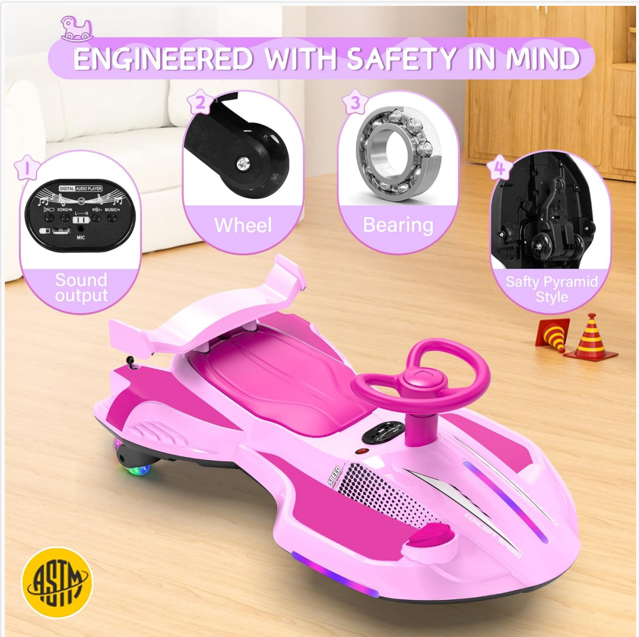
Figure 5: Key safety components including the anti-tip design and robust wheel construction.