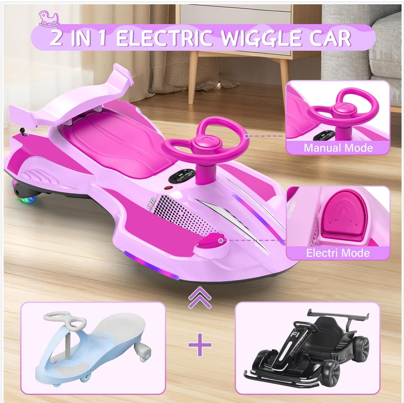
Figure 1: Overview of the 2-in-1 Electric Wiggle Car, highlighting manual and electric mode components.