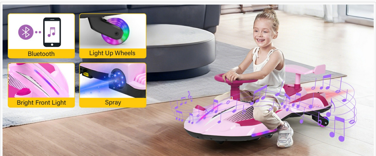
Figure 4: Detailed view of the interactive features including Bluetooth, light-up wheels, front light, and spray.

Your browser does not support the video tag.