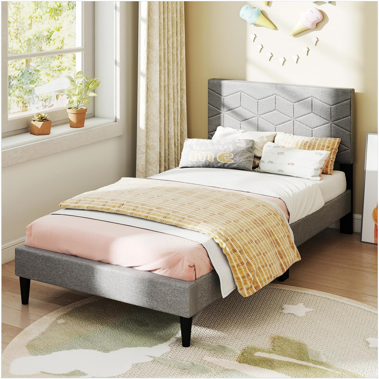
An assembled view of the Giantex Twin Size Upholstered Bed Frame, showcasing its modern design and geometric headboard.