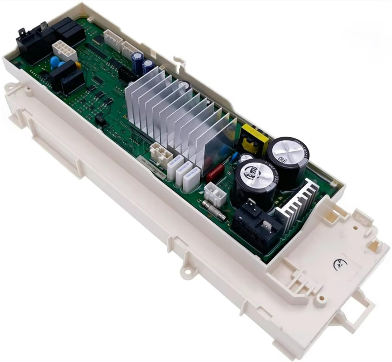
Figure 2: Angled perspective of the control board, highlighting the heat sink and larger capacitors.