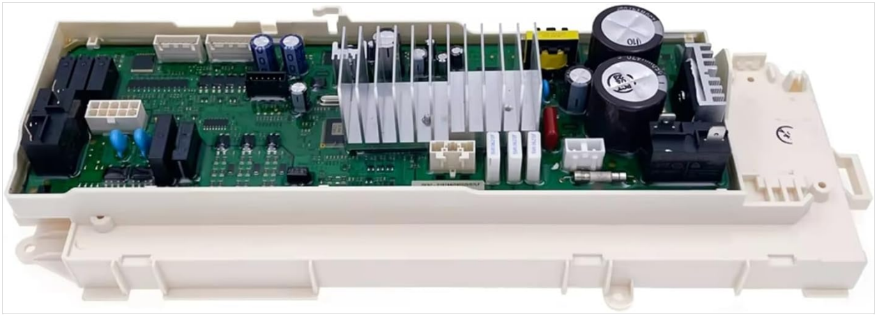
Figure 1: Top-down view of the DC92-01874A control board, showing various connectors and components.