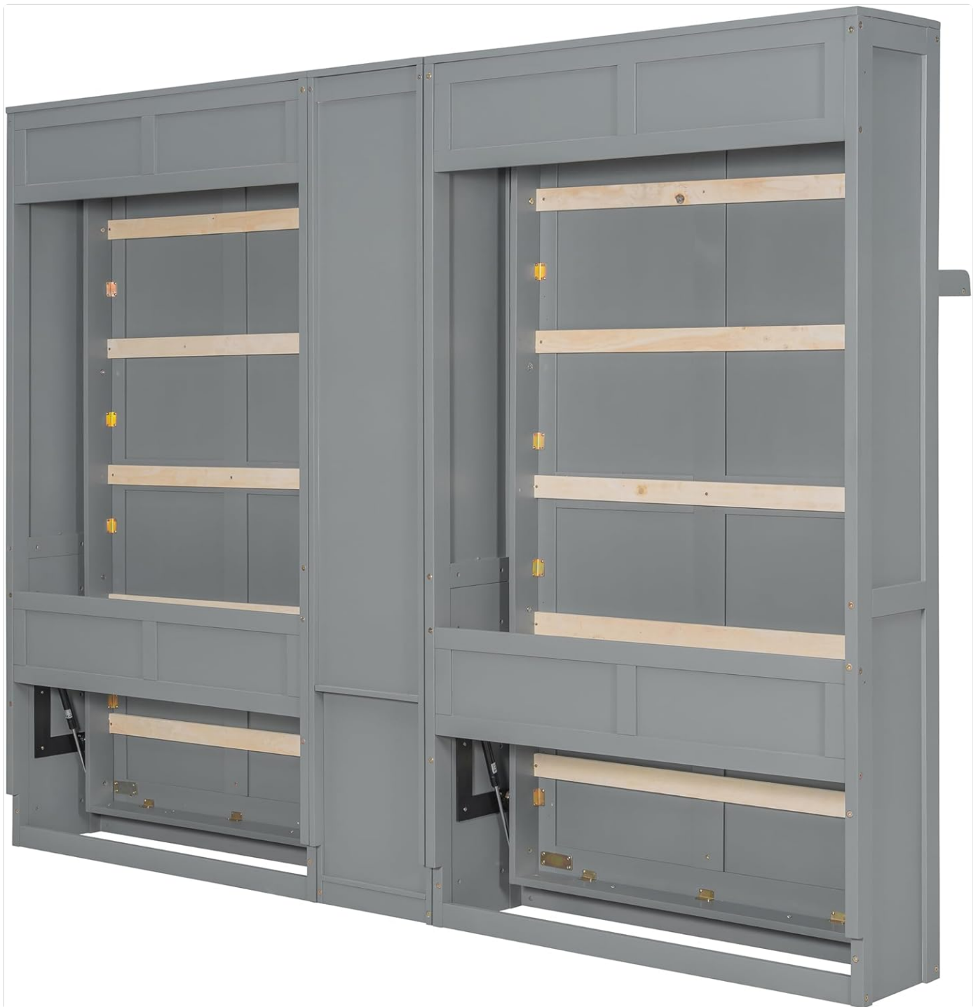
Image: The MERITLINE Dual Twin Murphy Bed unit shown in its folded-up position, revealing the back panels and the central storage section.

Note: Your order will arrive in 4 separate packages, which may not be delivered simultaneously. Please wait for all packages before beginning assembly.