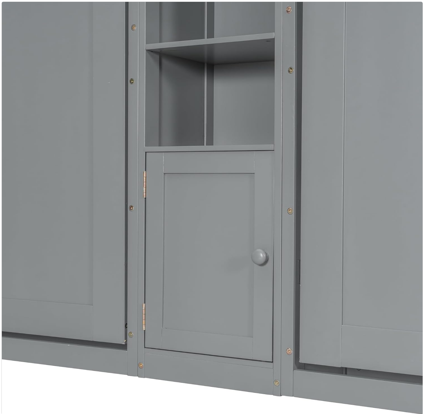
Image: A close-up of one of the closed cabinet doors on the central storage unit, highlighting the knob and panel design.