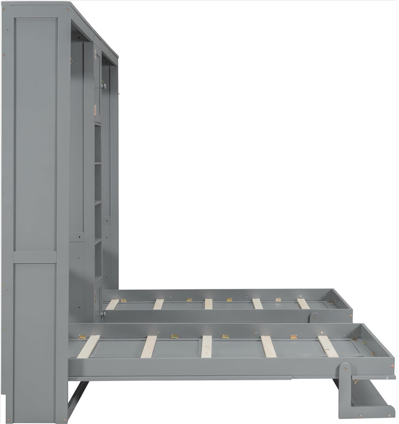
Image: A side view of the MERITLINE Dual Twin Murphy Bed, illustrating one bed partially extended from the main unit, demonstrating the folding mechanism.