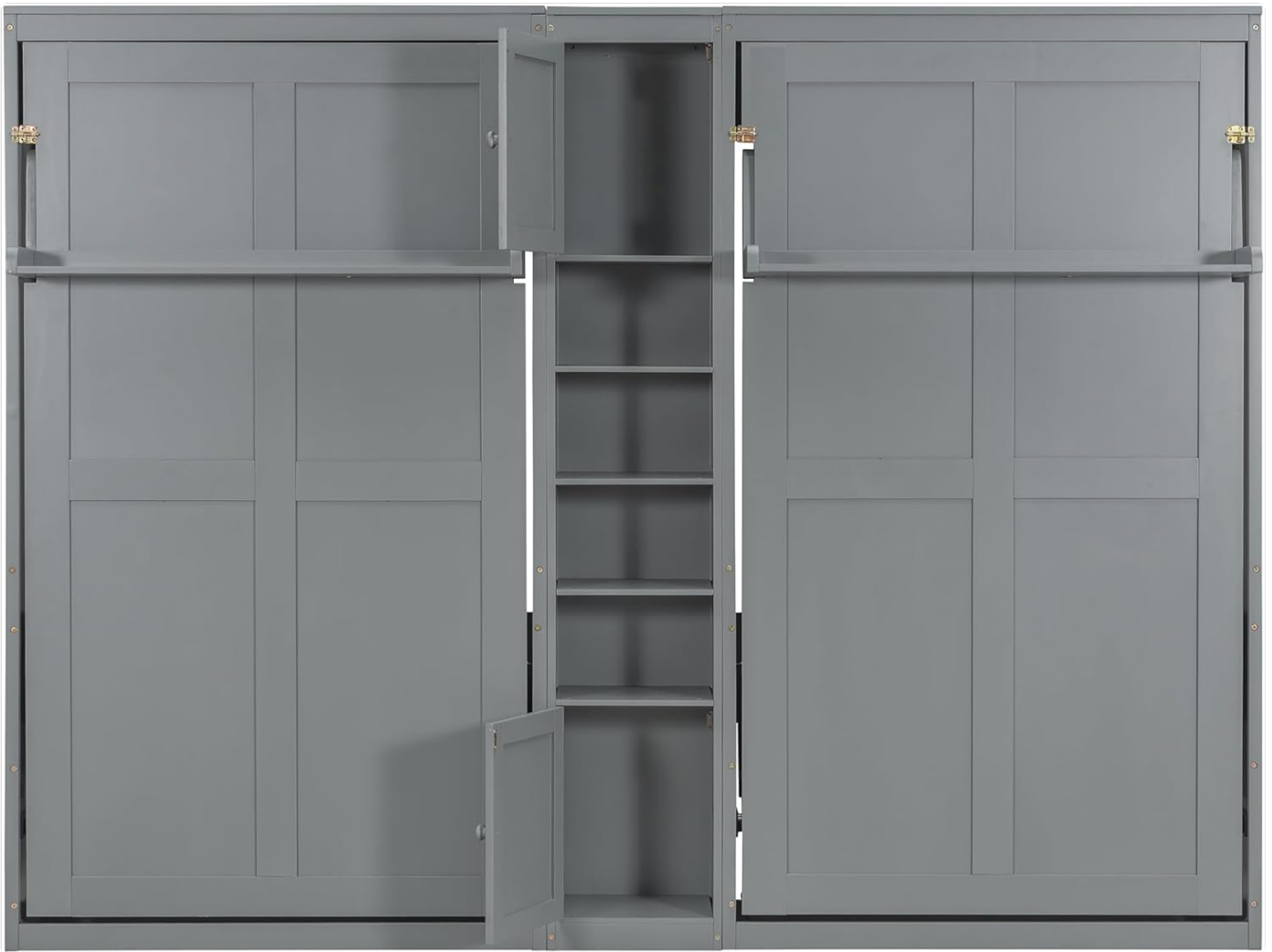
Image: The central storage unit of the MERITLINE Murphy Bed with all cabinet doors open, showcasing the interior shelving for organization.