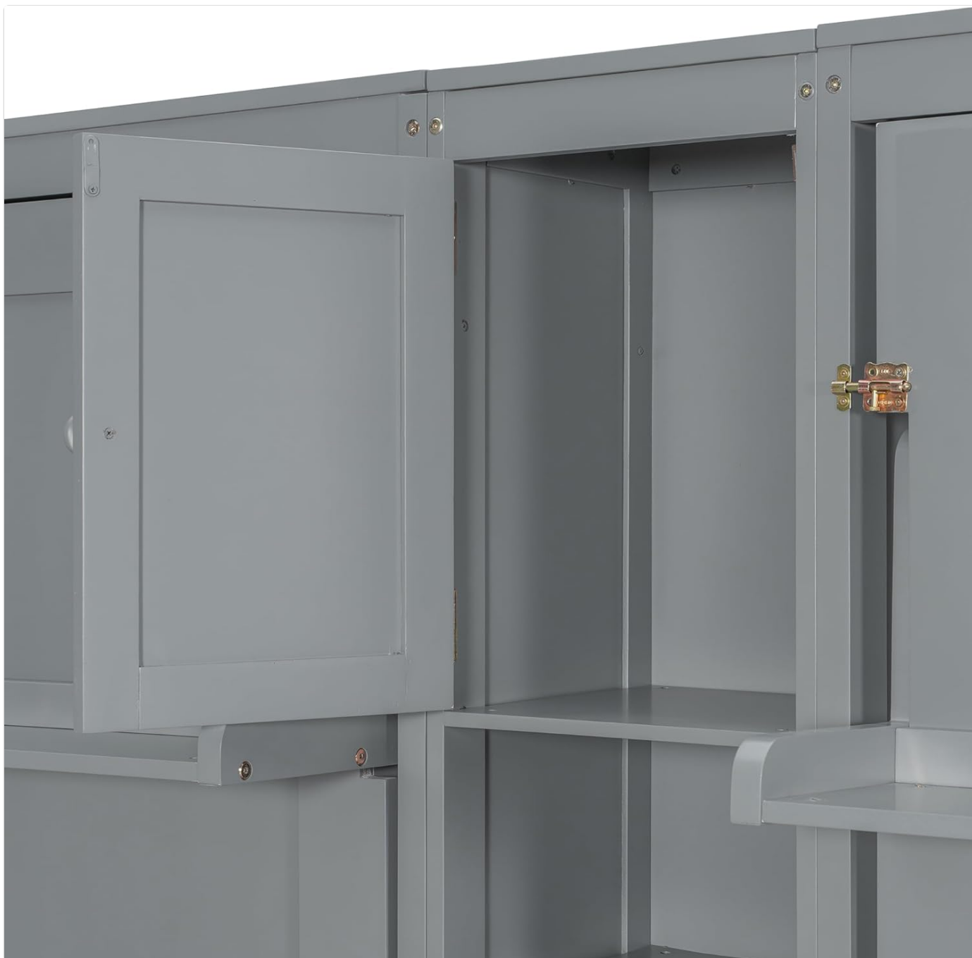
Image: A detailed view of the interior of an open cabinet, showing the shelving space available for storage.