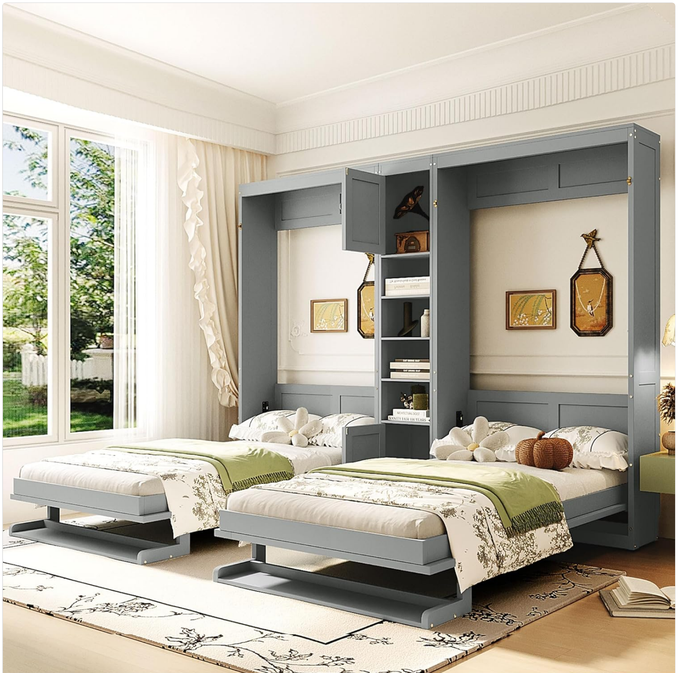
Image: The MERITLINE Dual Twin Murphy Bed system shown in a room with both twin beds extended for use. The central unit features shelves and cabinets.