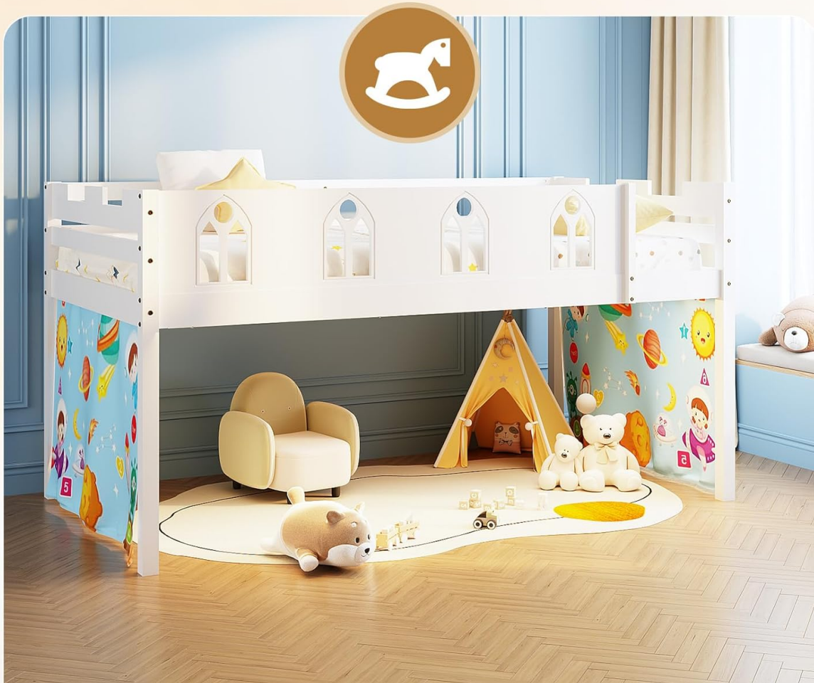
Image: The under-bed area configured as a play space, highlighting its versatility.

A Great Place for Playing, Reading or Storage