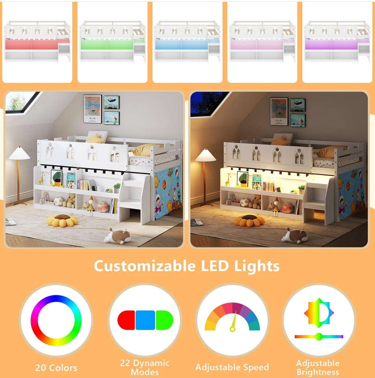
Image: The bed's LED lights showcasing different color options and dynamic modes.