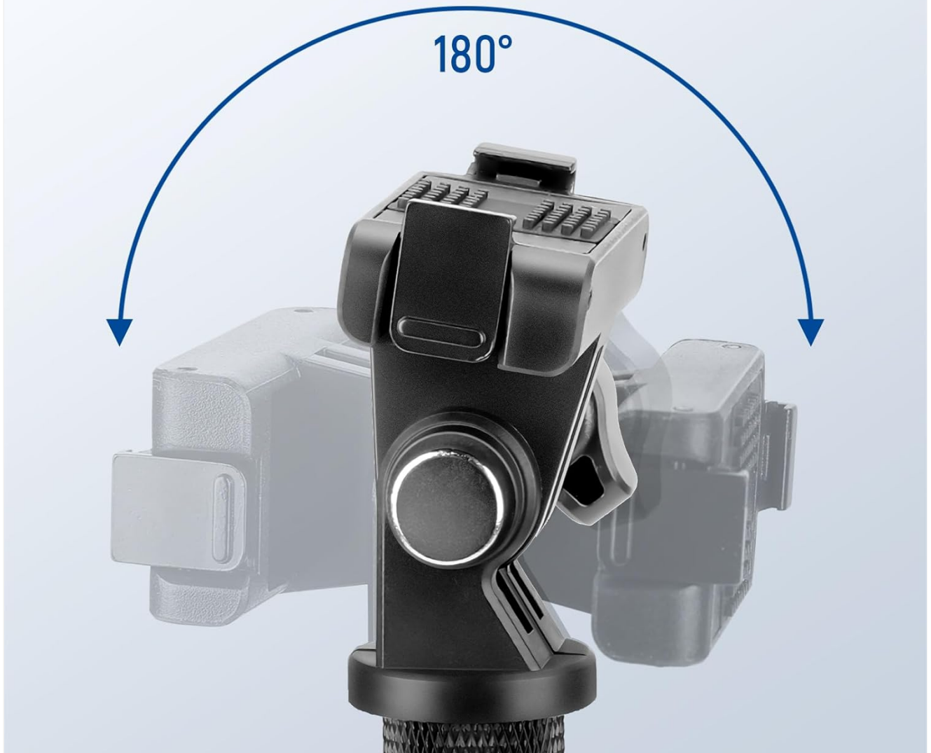
Image: A diagram illustrating the 180-degree tilt functionality of the camera mount on the extension rod.

The extension rod enables a 180° tilt for back and forth adjustments.