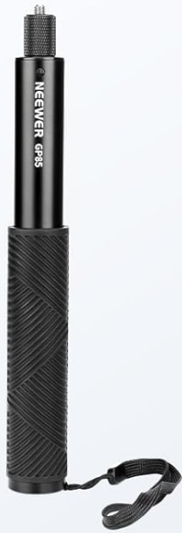
1 x Extension Rod