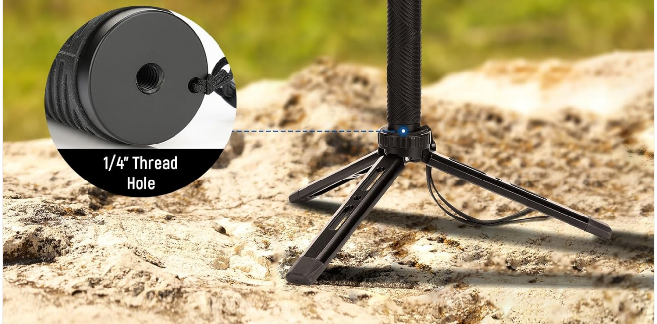
Image: The extension rod mounted on a tripod, showcasing the 1/4" threaded hole at its base.

The selfie stick features a 1/4" threaded hole on the bottom, allowing you to easily attach it to a tripod.