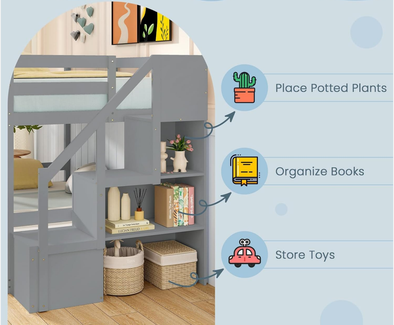
Image: Detailed view of the three open storage compartments within the staircase, suitable for organizing various items.

Provide classified storage space for a variety of items