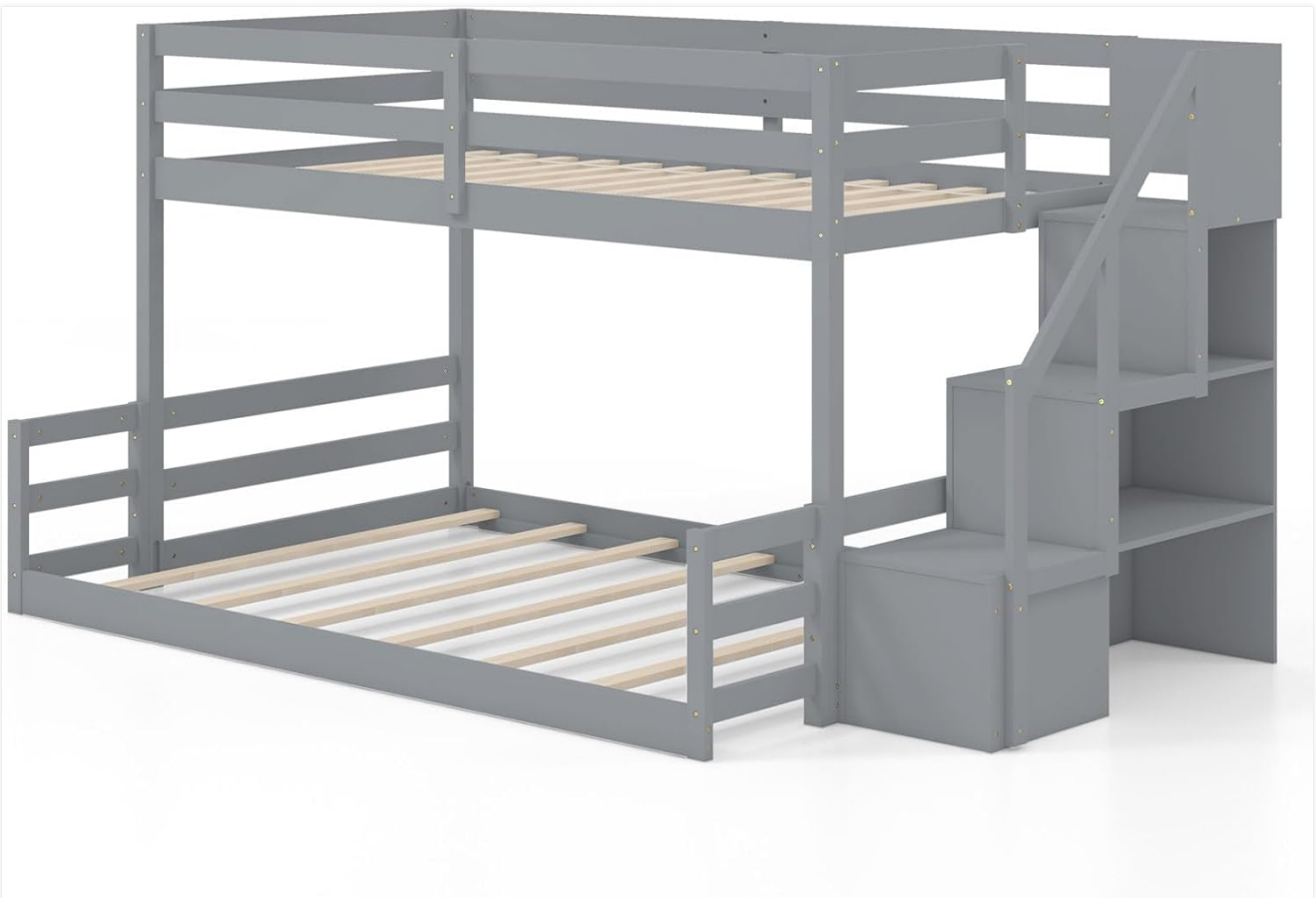
Image: The bunk bed frame fully assembled, showcasing the wooden slats and the integrated staircase.