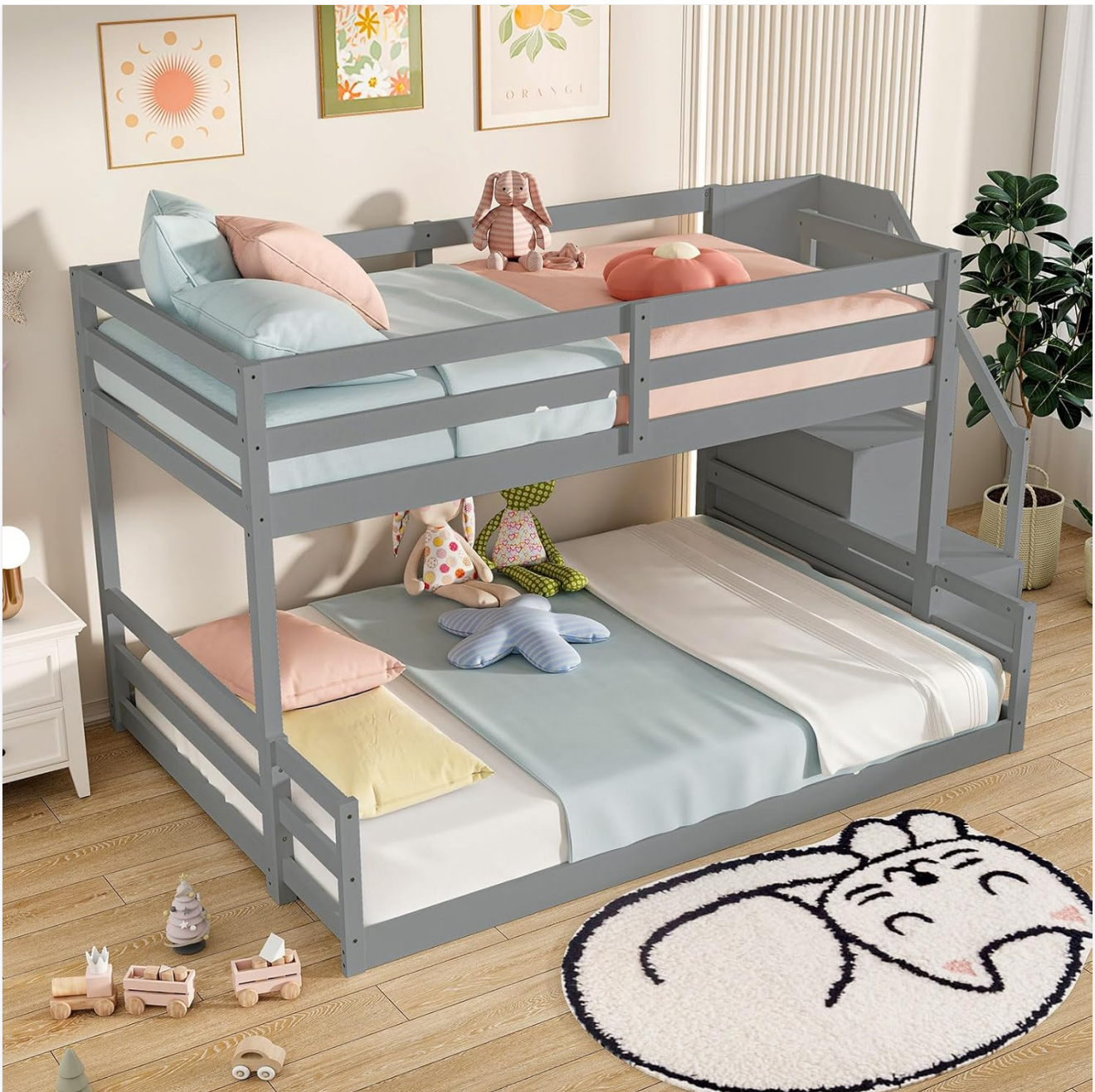
Image: Full view of the IFANNY Twin Over Full Bunk Bed with Stairs and Storage in Grey.