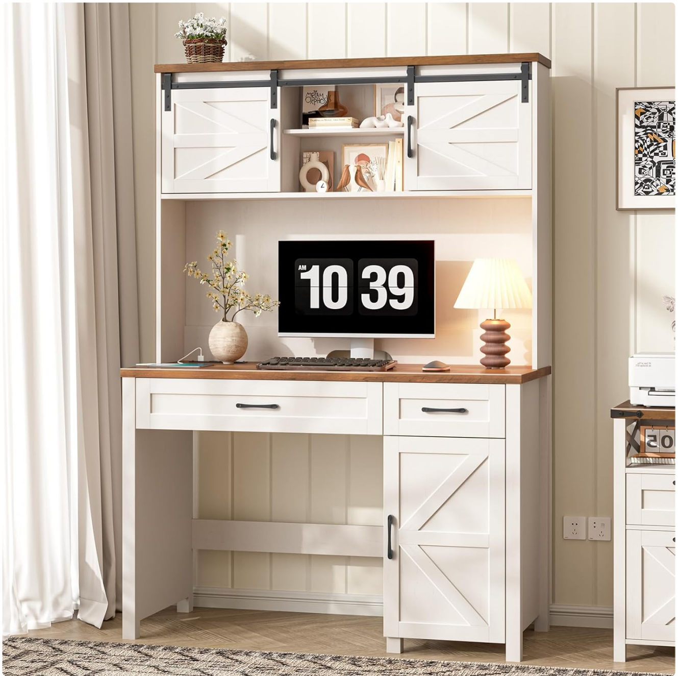
Figure 1: Vabches Farmhouse 47" Executive Desk in a home office setting.