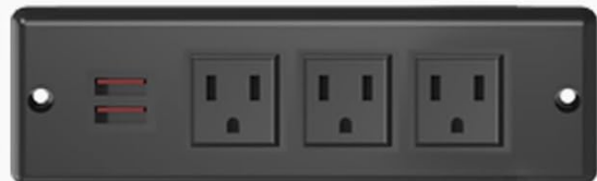
Figure 4: Close-up of the charging hub with power outlets and USB ports.