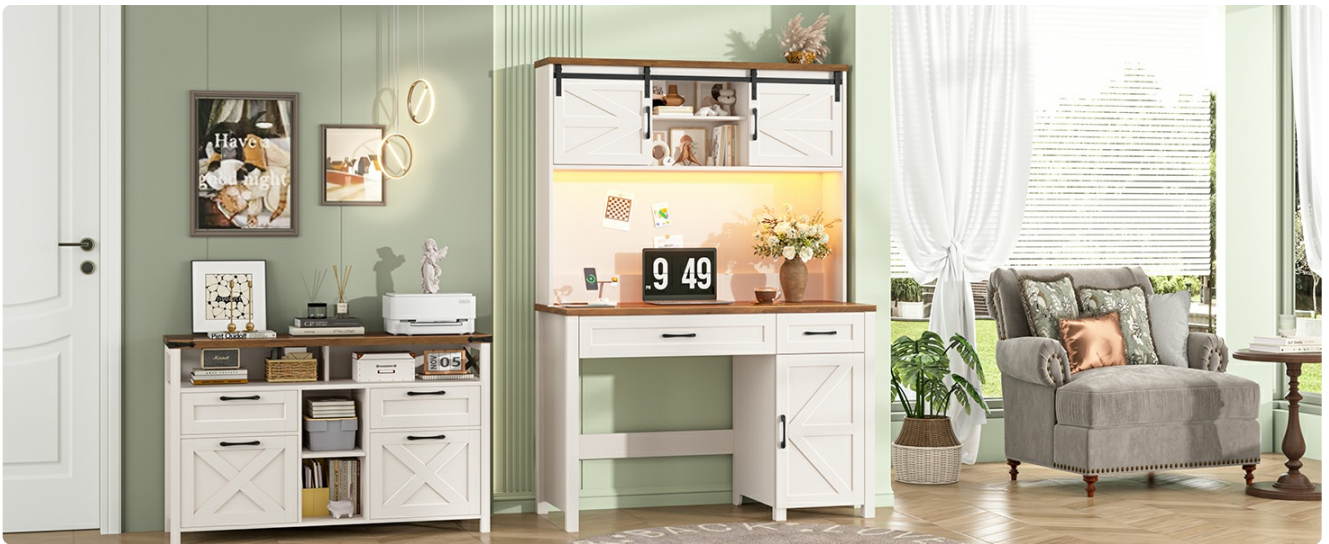
Figure 2: Desk showcasing monitor stand, charging station, and printer shelf.