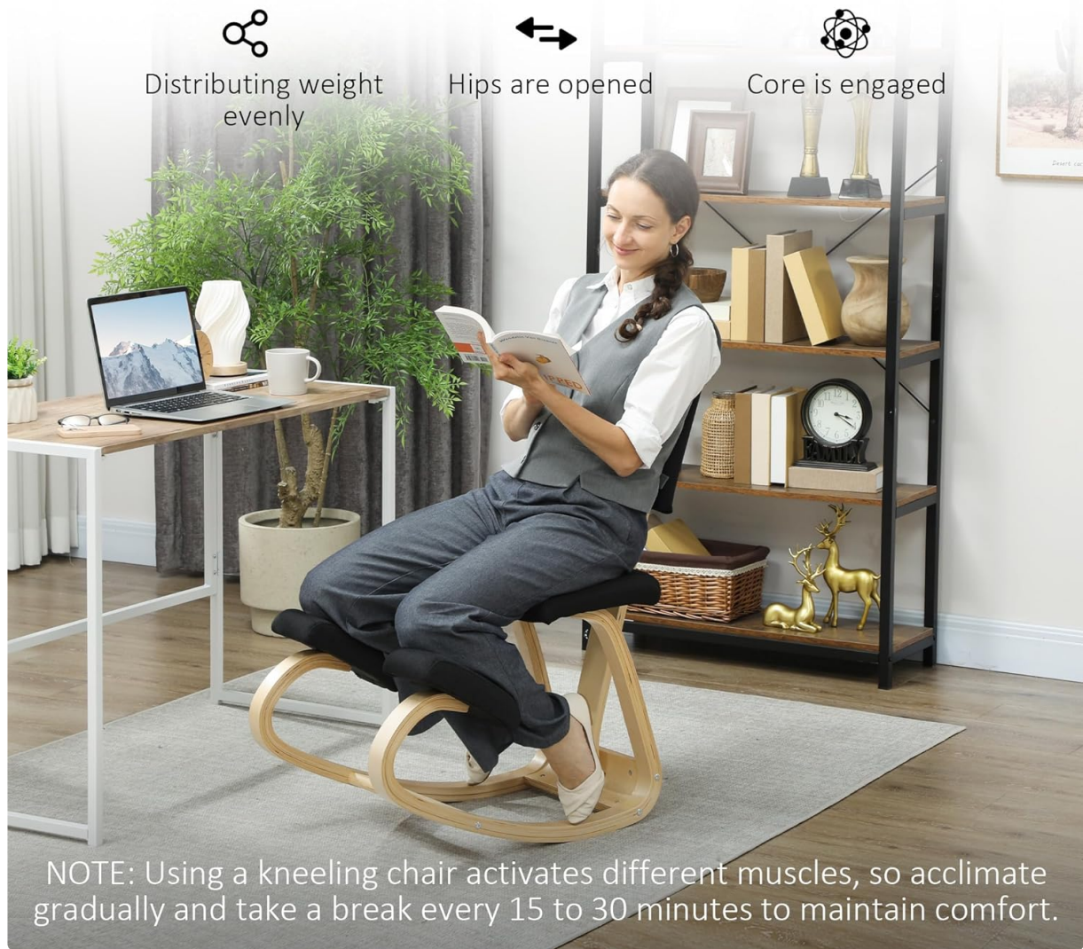
Image 4: Illustration of how the kneeling chair promotes a healthy posture by distributing weight and engaging core muscles.