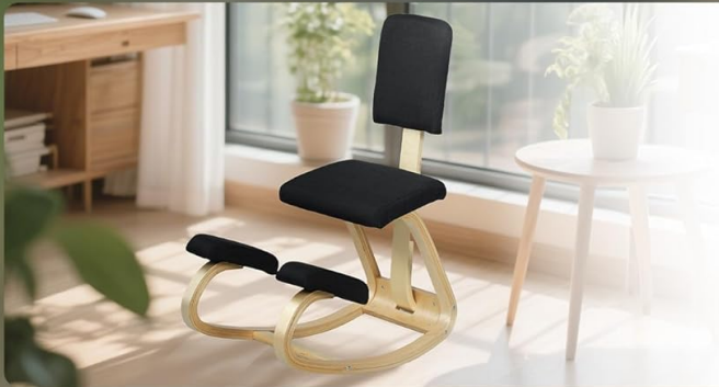
Home Office Chair