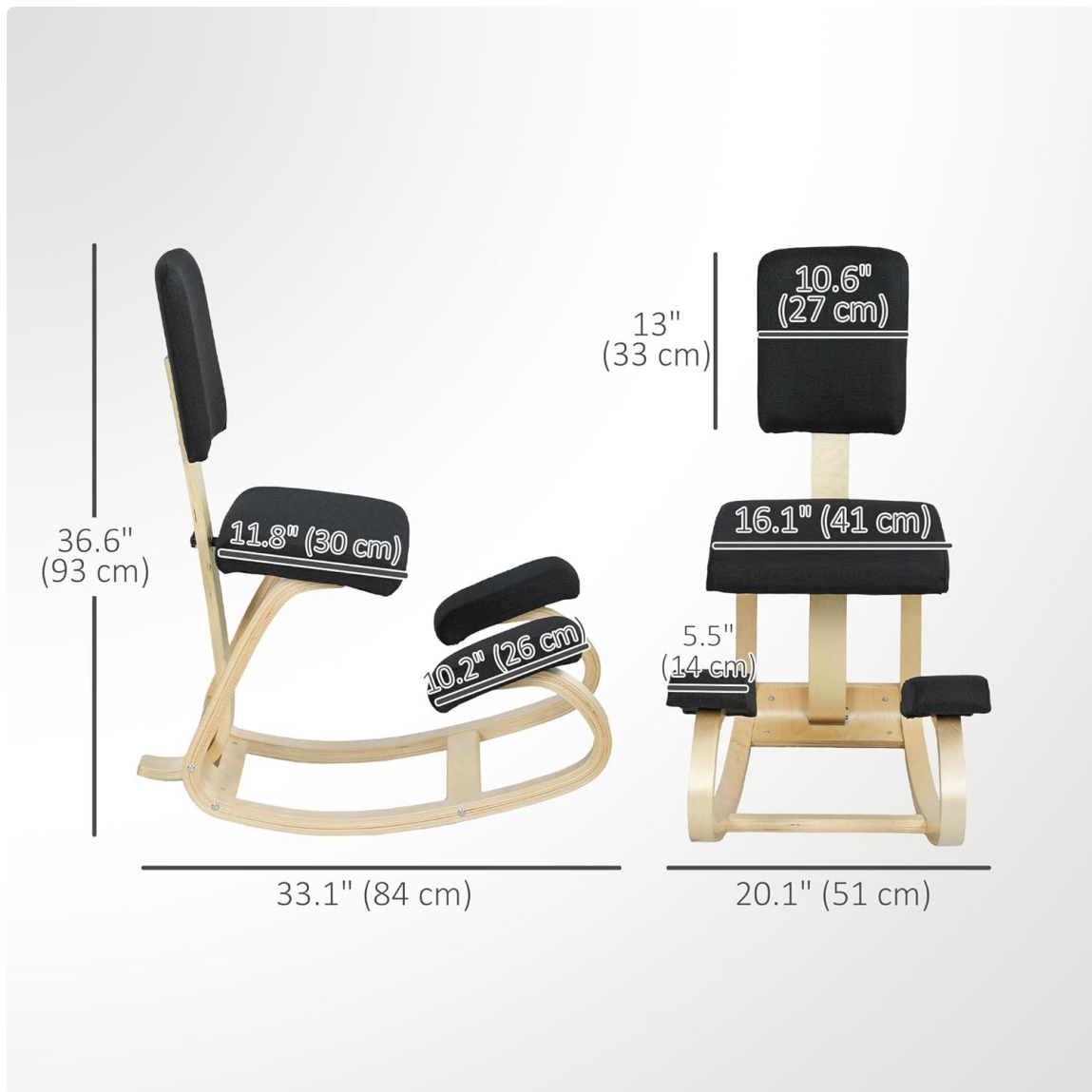
Image 2: Dimensional diagram of the kneeling chair, showing measurements for width, depth, and height.