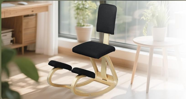
Home Office Chair