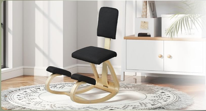
Meditation Desk Chair