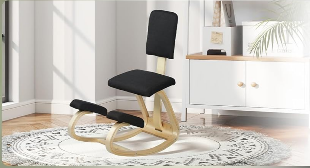
Meditation Desk Chair