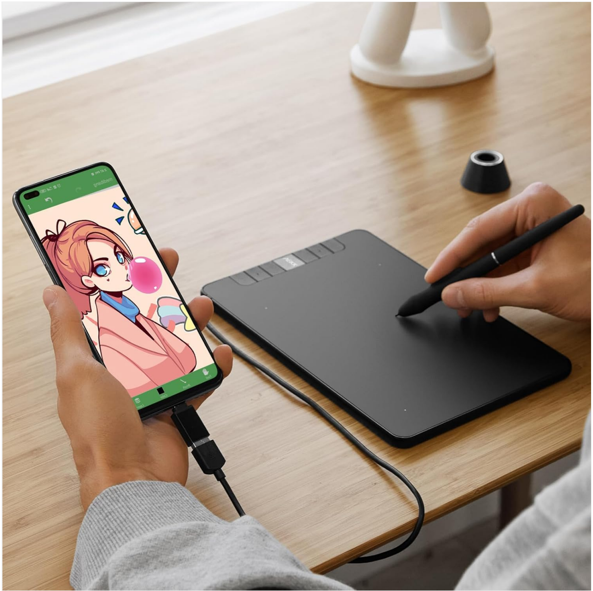
Image: Connecting the VK640 tablet to a mobile device.