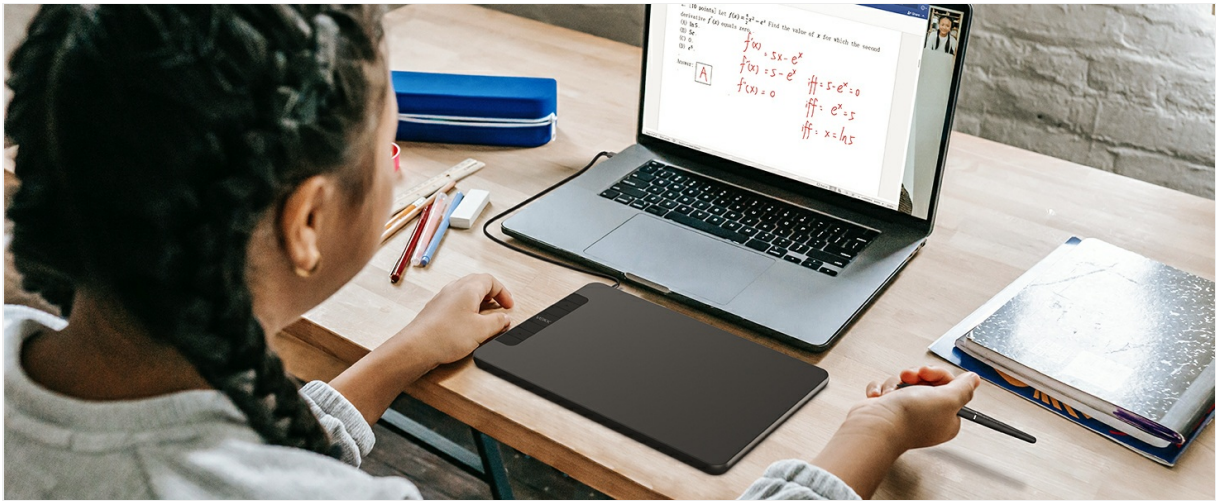
Image: Features of the battery-free stylus, including pressure sensitivity and tilt function.