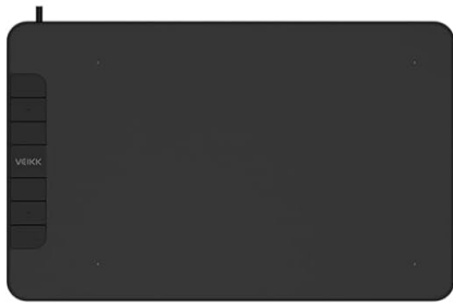
VK640 Pen Tablet