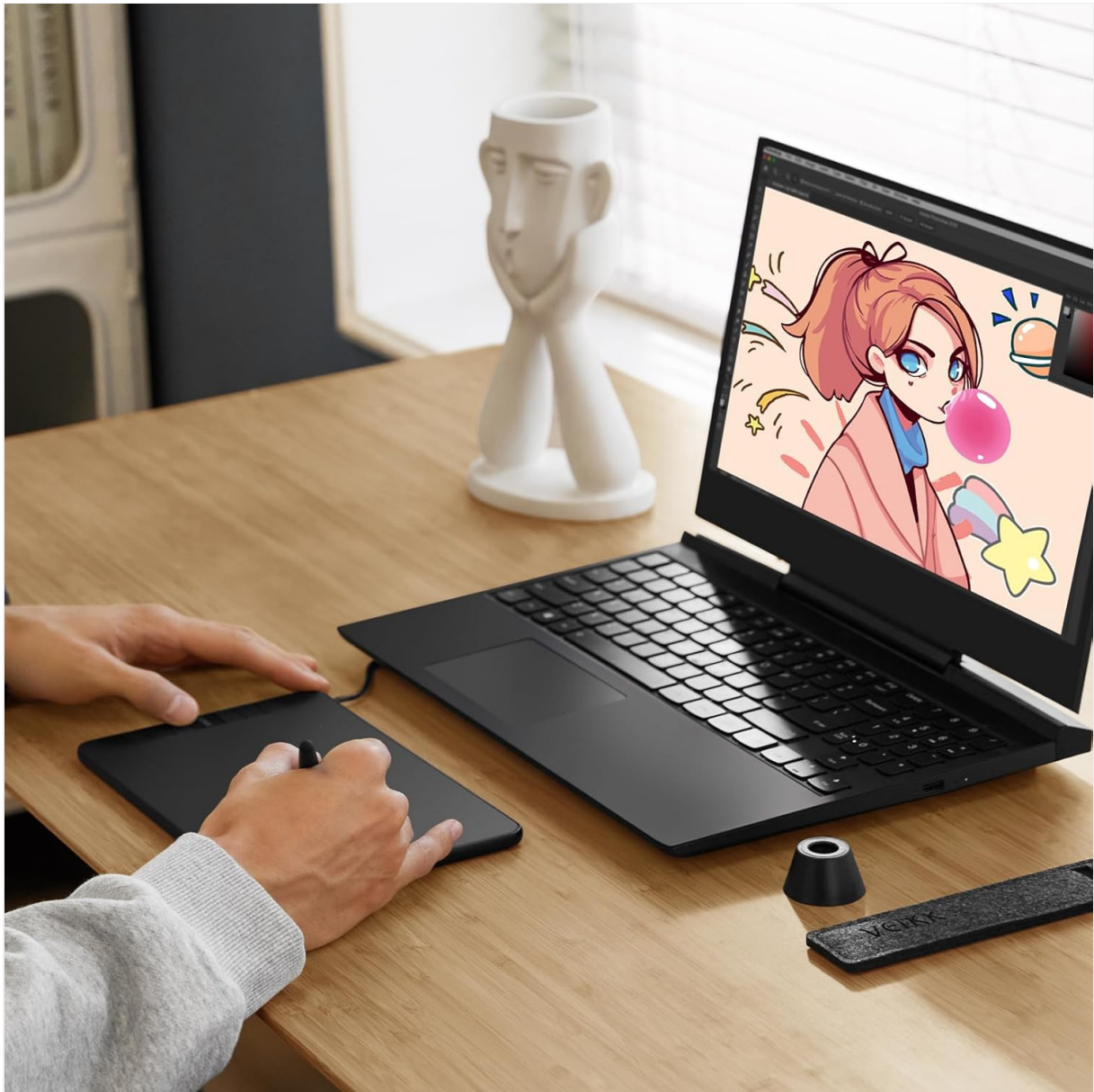
Image: The VK640 tablet connected and in use with a laptop.