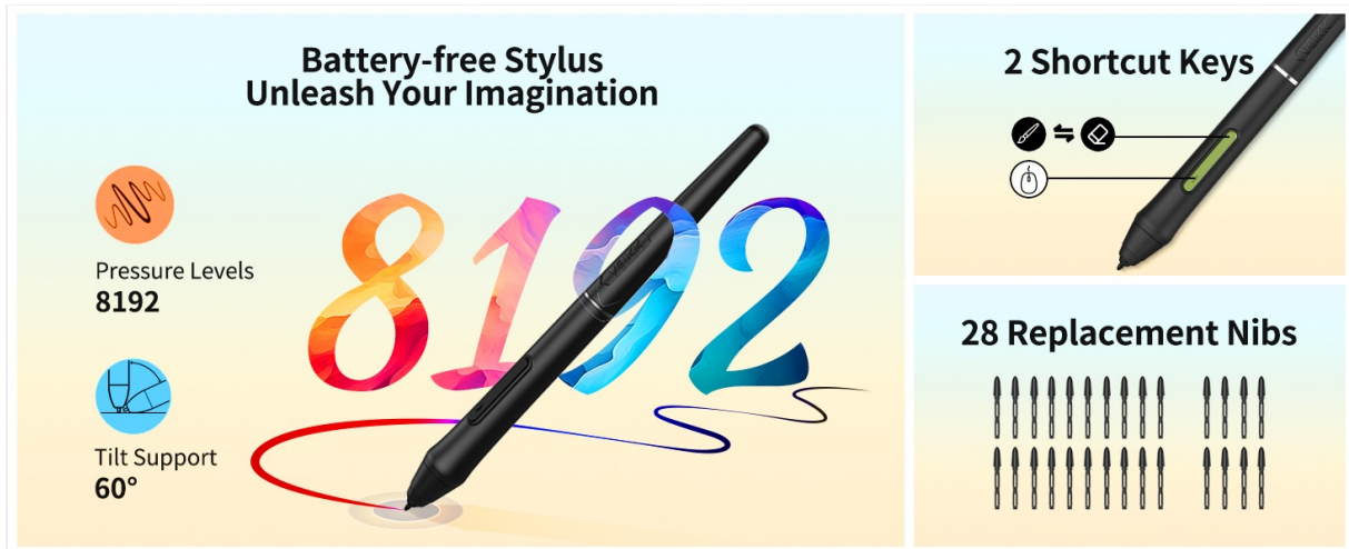
Image: Overview of VEIKK VK640 Graphic Tablet features.

The VEIKK VK640 is a compact digital graphic tablet designed for drawing, design, online teaching, and other creative applications. It features a 6x4 inch active area, 6 customizable shortcut keys, and a battery-free stylus with 8192 pressure levels and 60-degree tilt support.