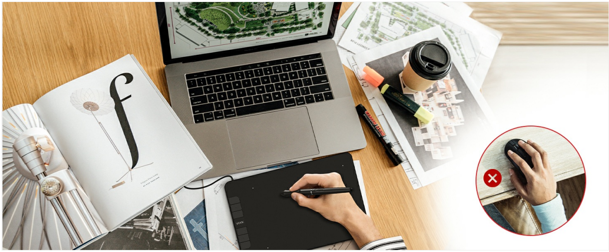
Image: The compact size of the VK640 drawing tablet, ideal for beginners.