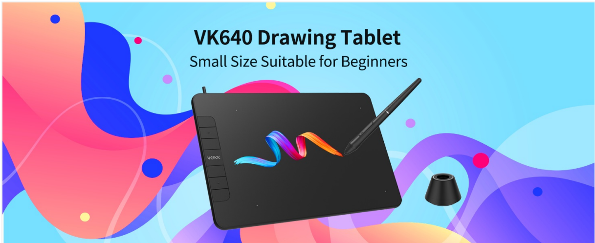
Image: The 6 customizable shortcut keys on the VK640 tablet.

The VK640 tablet is equipped with 6 customizable shortcut keys. These keys can be programmed through the VEIKK driver software to perform various functions, such as undo, redo, zoom in/out, brush size adjustment, or switching tools. Refer to the driver software interface for detailed customization options.