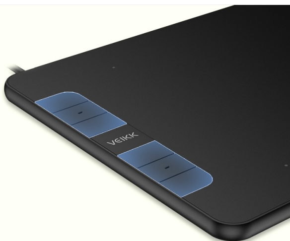
Image: Broad compatibility of the VK640 with different operating systems and creative applications.