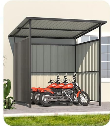
Image: An illustration demonstrating the extra-large storage capacity of the gazebo, showing it can accommodate multiple bicycles, scooters, or even motorcycles, highlighting its versatility as a storage solution.