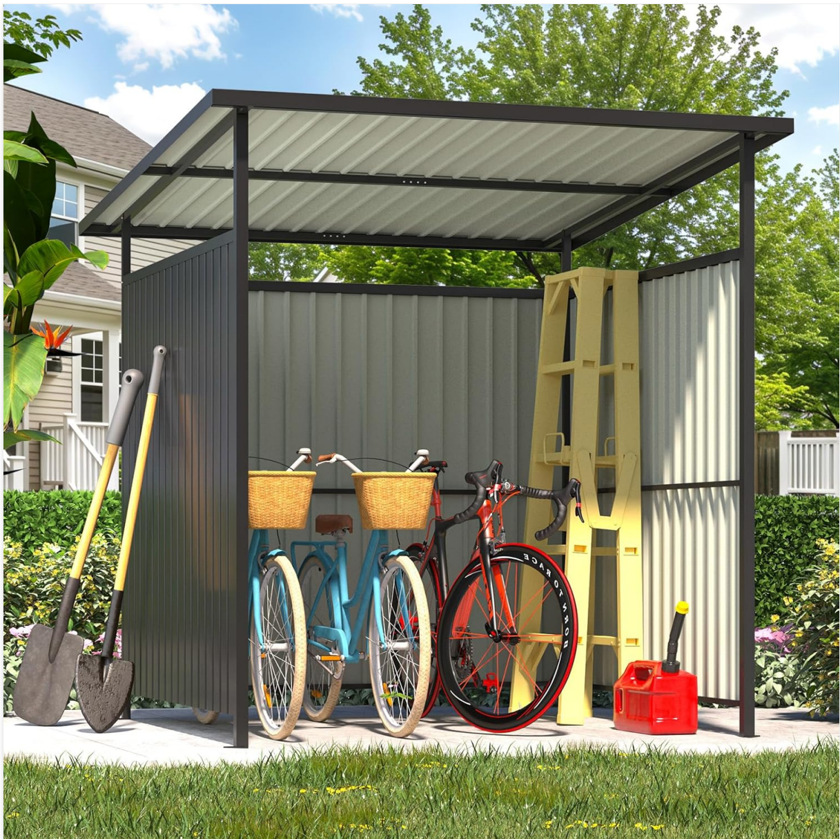
Image: The AECOJOY 6x6 Hardtop Gazebo functioning as an outdoor storage shed, housing two bicycles, a ladder, and other garden tools. The semi-enclosed structure protects items from the elements.