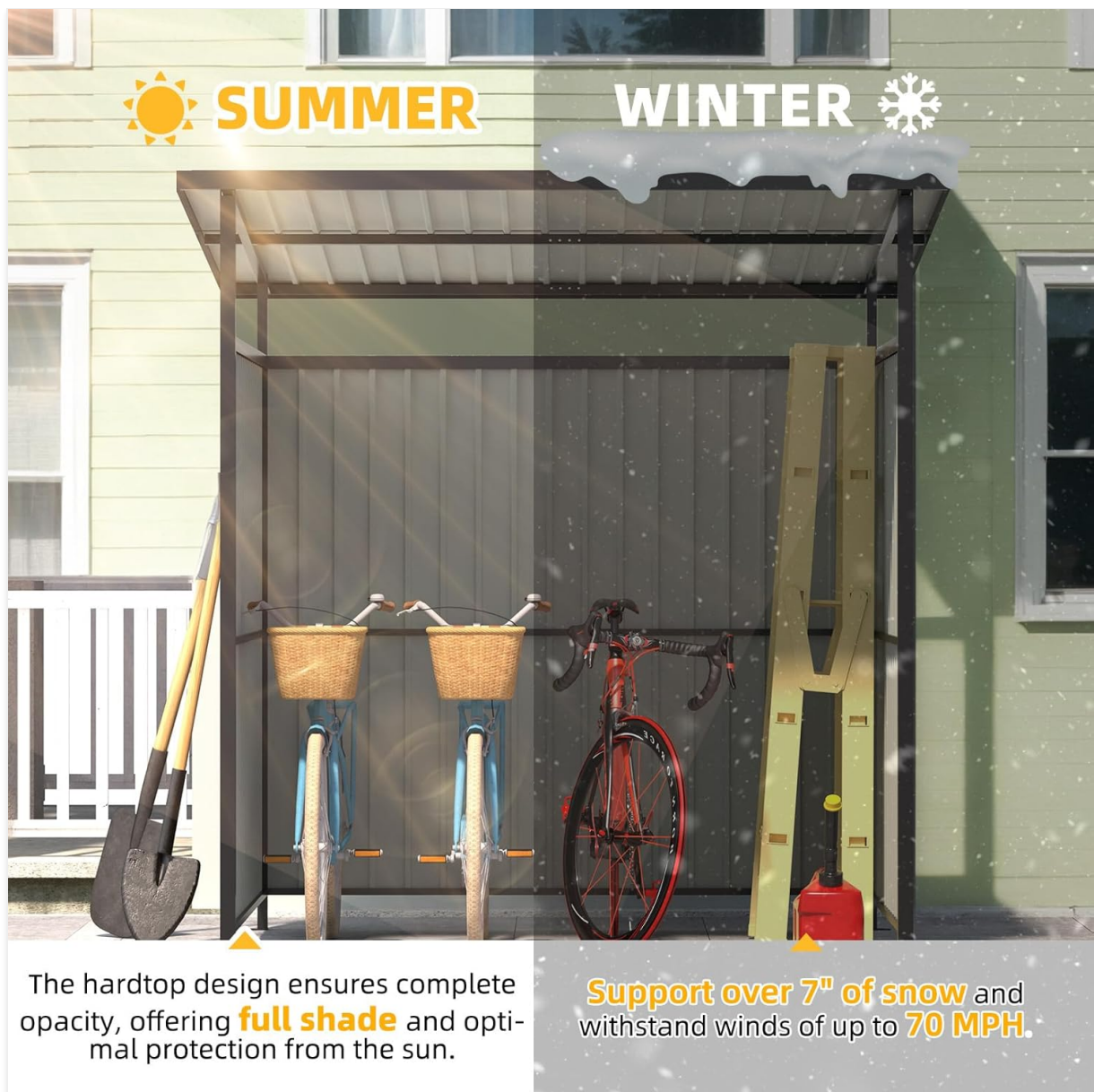
Image: A visual representation showing the gazebo's performance in both summer and winter. In summer, it provides full shade; in winter, it is depicted with snow on the roof, illustrating its snow load capacity.