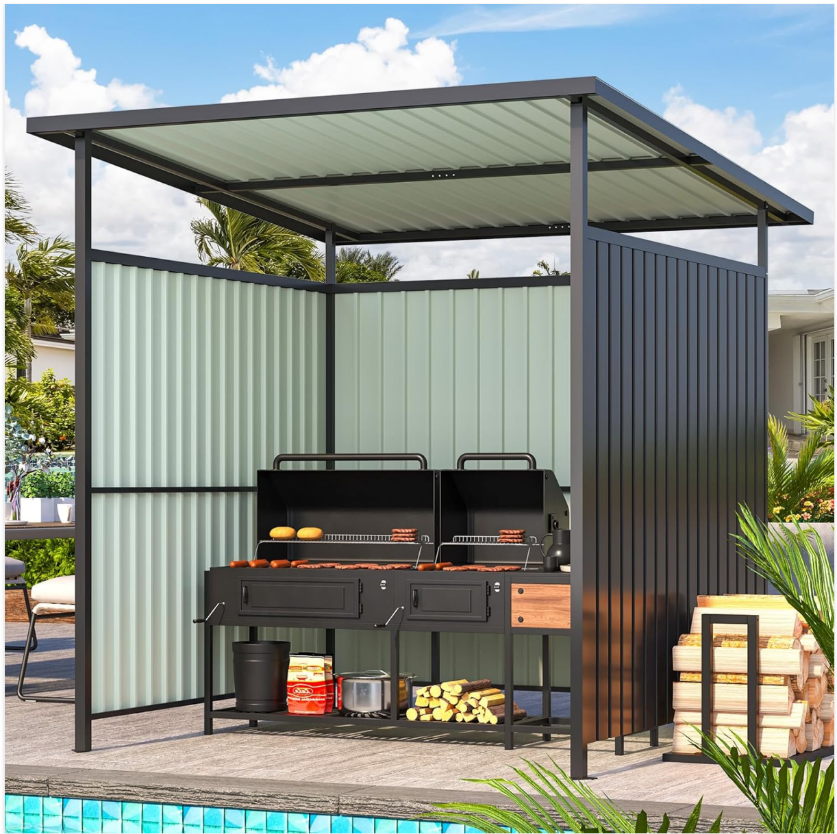
Image: The AECOJOY 6x6 Hardtop Grill Gazebo in use as a BBQ shelter next to a swimming pool. It features a semi-enclosed design with a hardtop roof and side panels, providing shade and protection for grilling equipment.