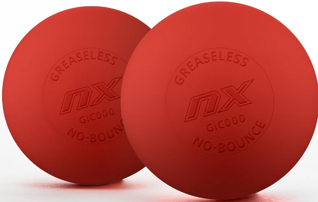
Image 2: Two PEARL NX balls, highlighting their suitability for practice due to reduced rebound.