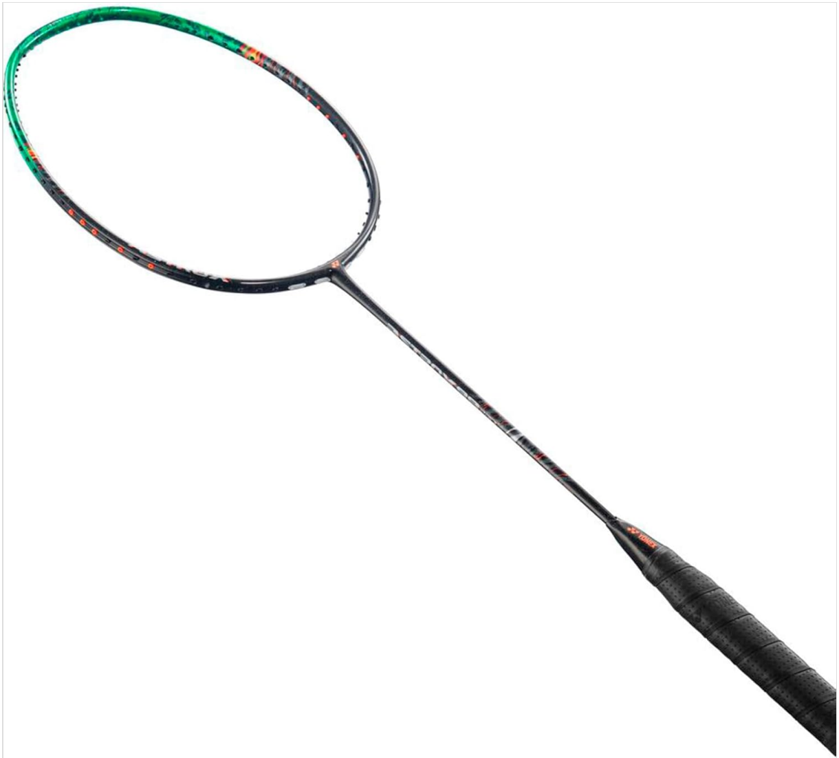
An angled perspective of the YONEX Astrox 99 Game racquet, providing a better sense of its overall shape and balance.