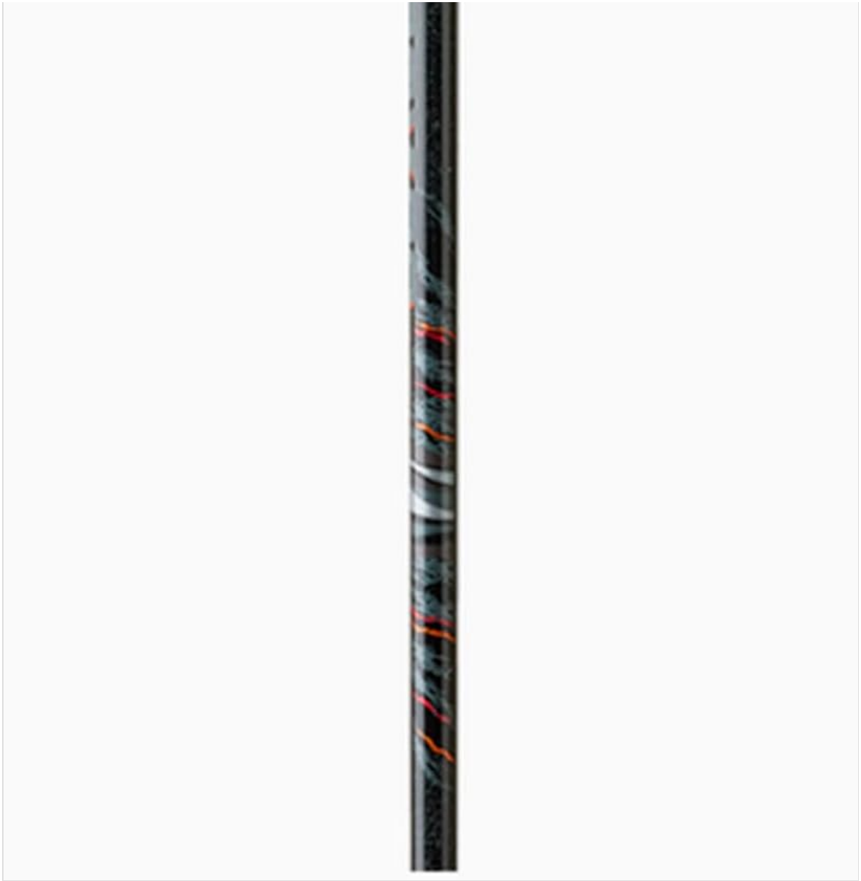
This image focuses on the racquet's shaft and the integrated T-joint, a critical area for stability and power transfer.