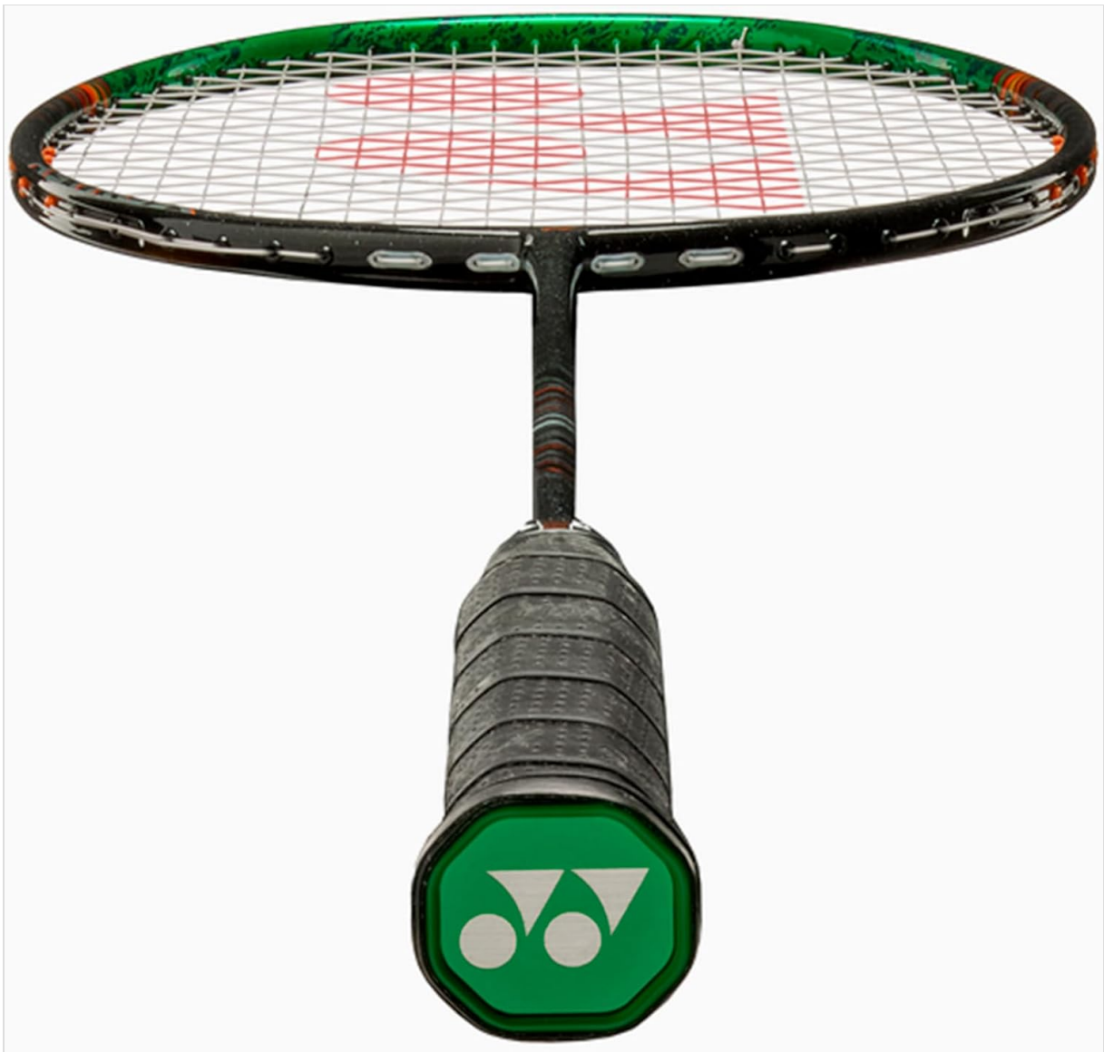
The racquet's handle wrapped with a black grip, and the green butt cap featuring the YONEX logo, indicating the base of the racquet.