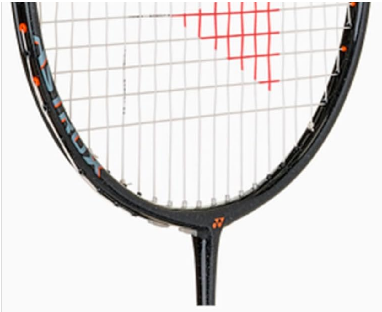
A detailed view of the racquet head, illustrating the precise stringing and the robust frame construction, including the grommets.