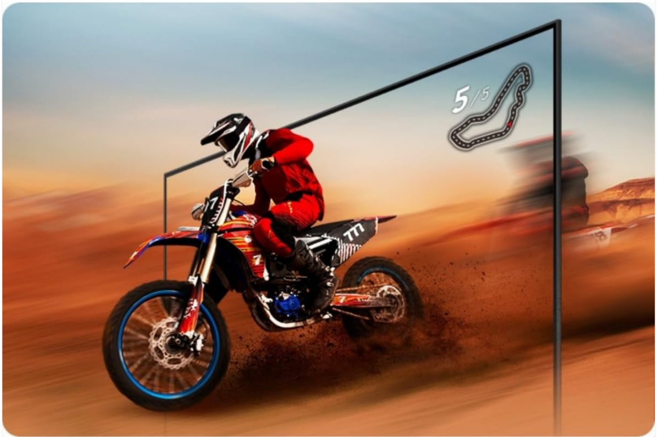
Image: A visual representation of the 'Color Booster' feature, showing how colors are reimagined with richer hues and increased intensity.