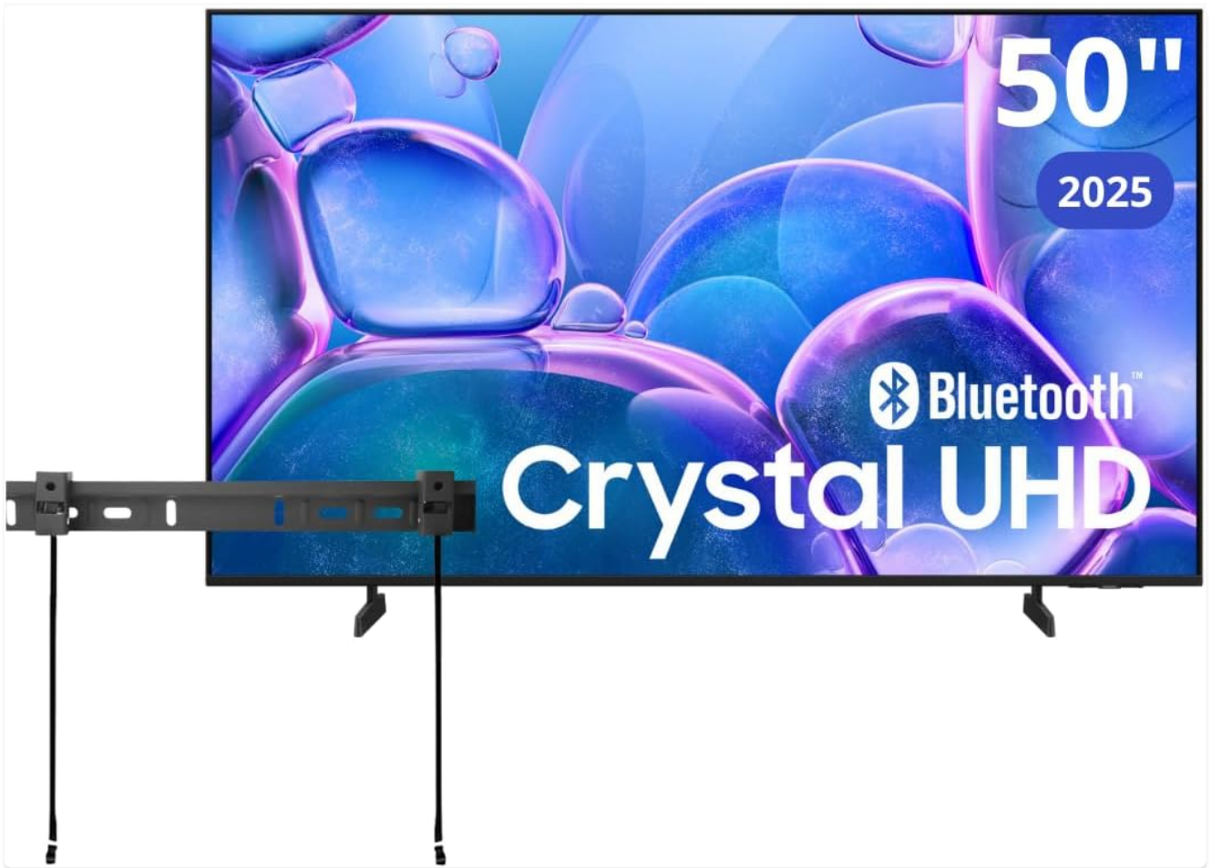
Image: Samsung 50-inch Crystal UHD U7900F TV shown with its included wall mount bracket.