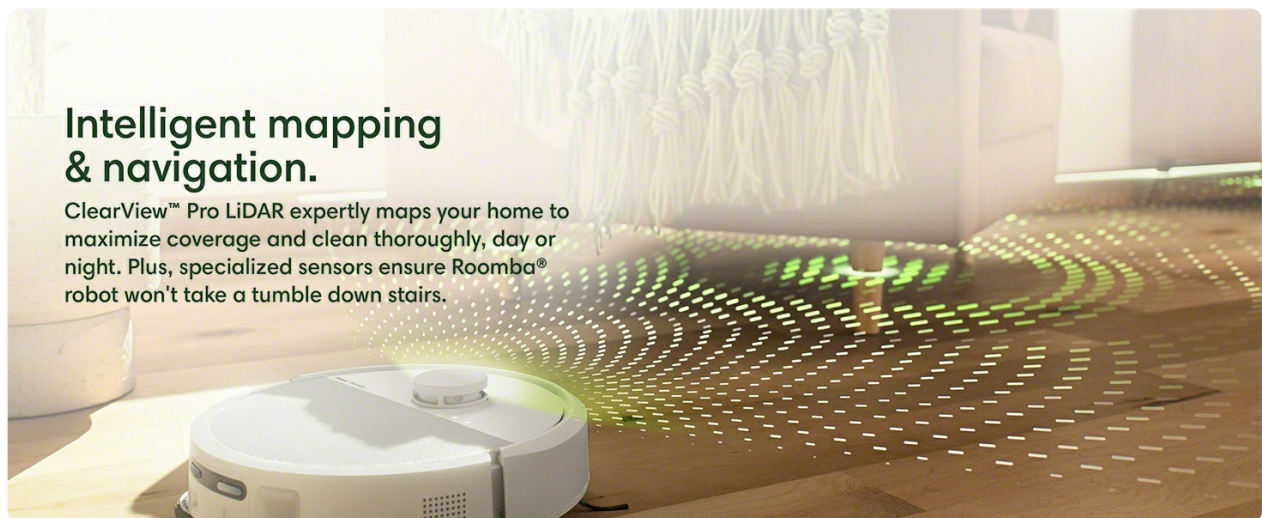
Image: The Roomba 505 using ClearView Pro LiDAR to map a room, showing its navigation path.

Video: Tips on how to optimize your Roomba 505 for best cleaning results.