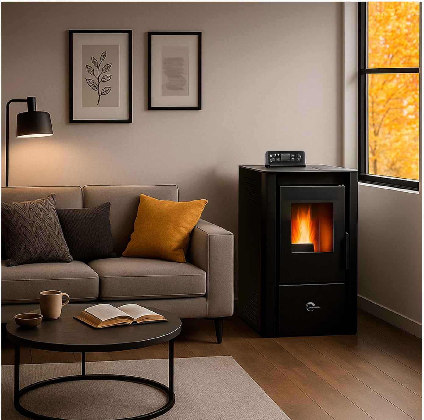
Image 2: The Sannover Anita 9.4 kW pellet stove positioned in a modern living room next to a sofa, demonstrating a typical installation setting. The stove is black, compact, and blends with the room decor.