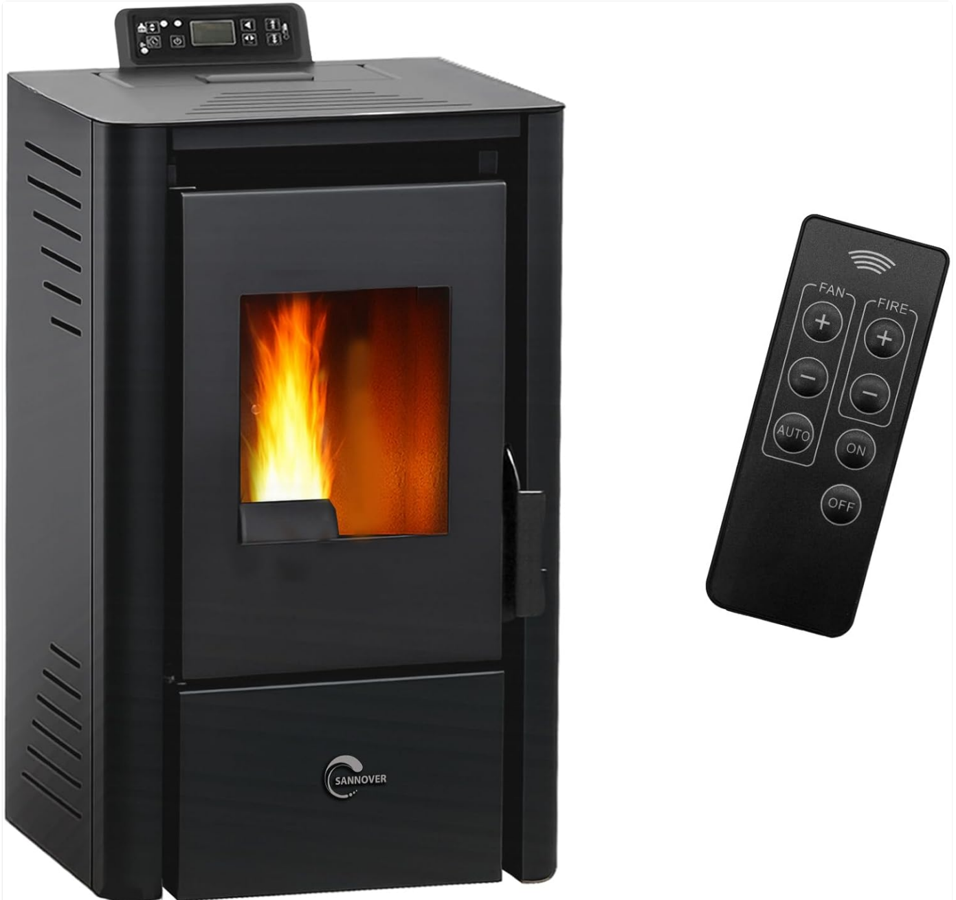
Image 1: Sannover Anita 9.4 kW Sealed Pellet Stove and its remote control. The stove is black with a glass door showing flames, and a control panel on top. The remote control has buttons for fan, fire, auto, on, and off.