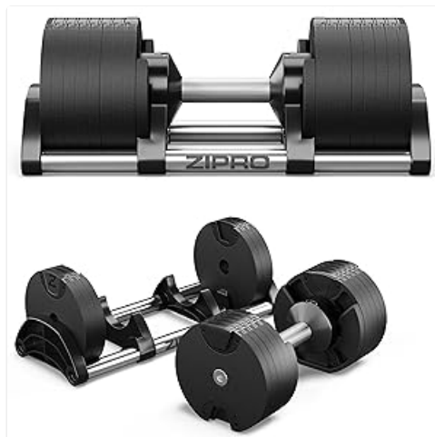
Figure 3.2: Components of the adjustable dumbbell, including the handle, plates, and base.