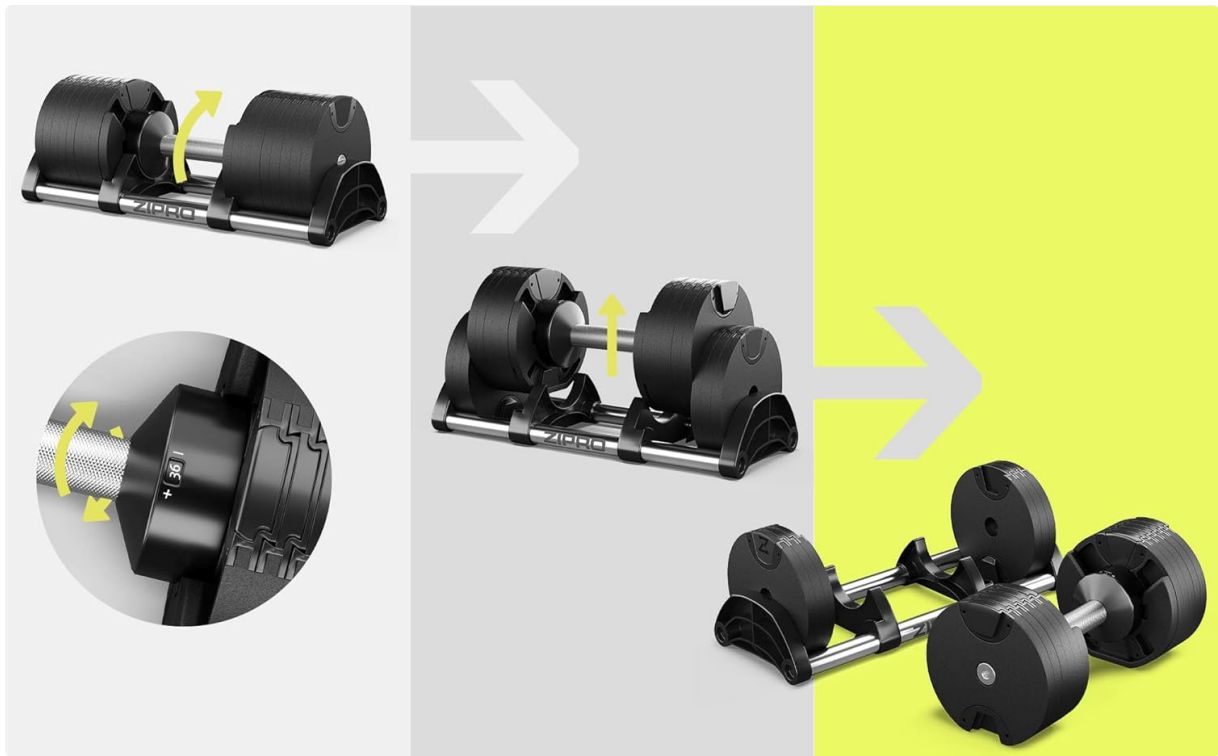
Figure 8.1: Dimensions and weight settings for the 36 kg model.