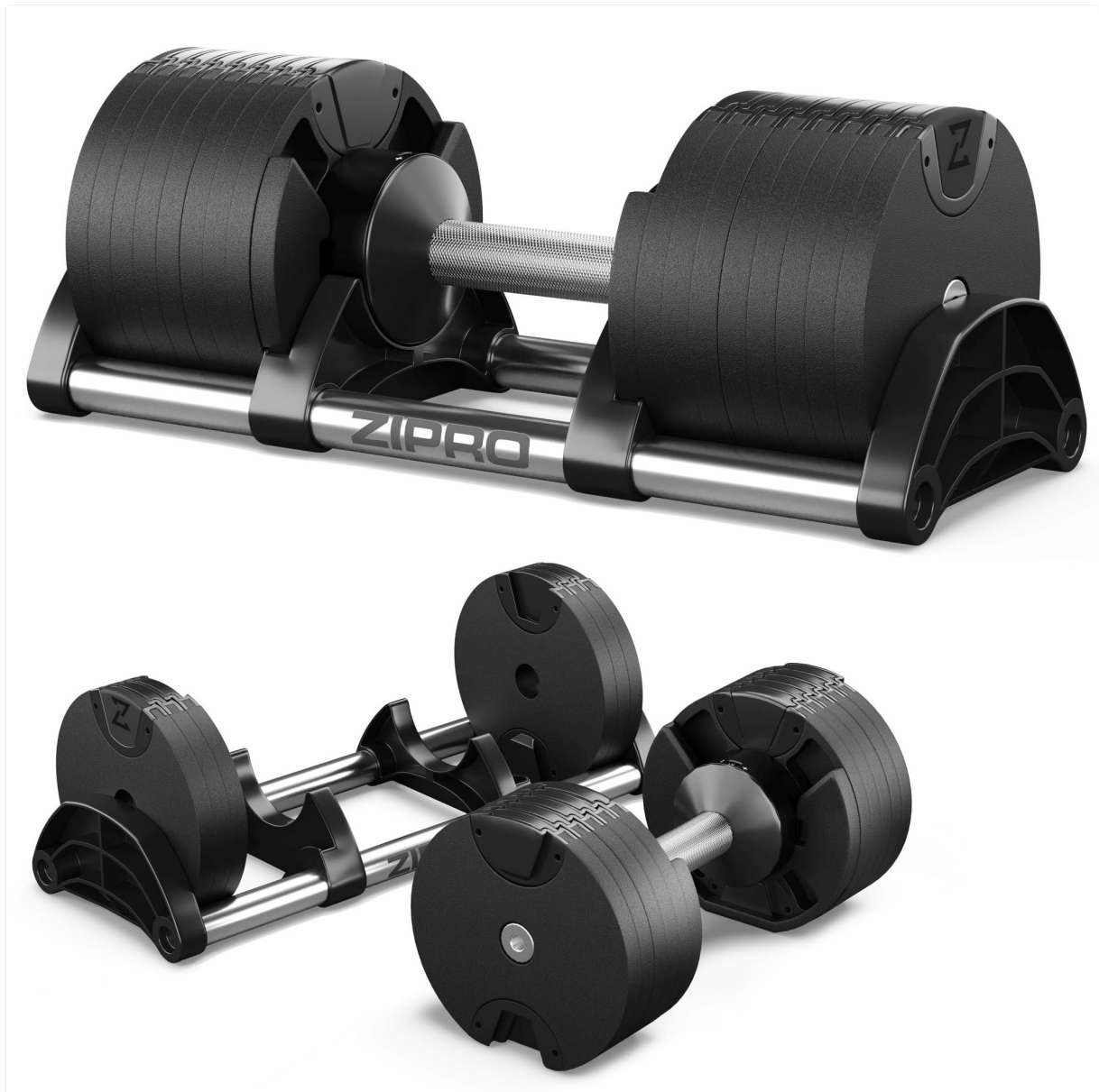
Figure 3.1: The ZIPRO Adjustable Dumbbell on its storage base.