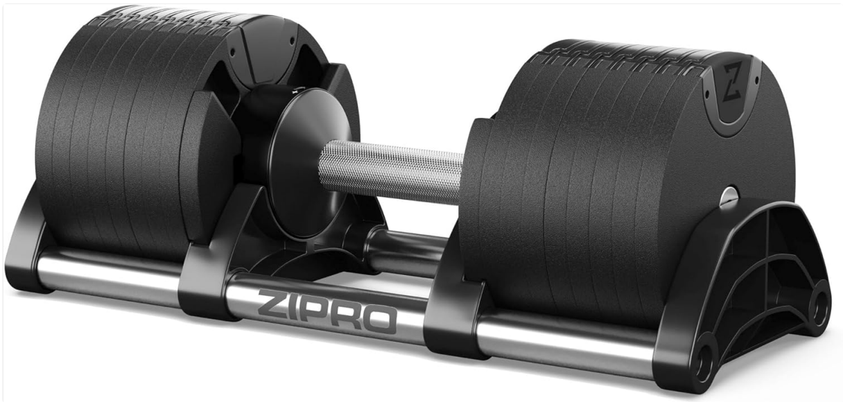
Figure 5.2: The double locking mechanism ensures plates are securely attached.