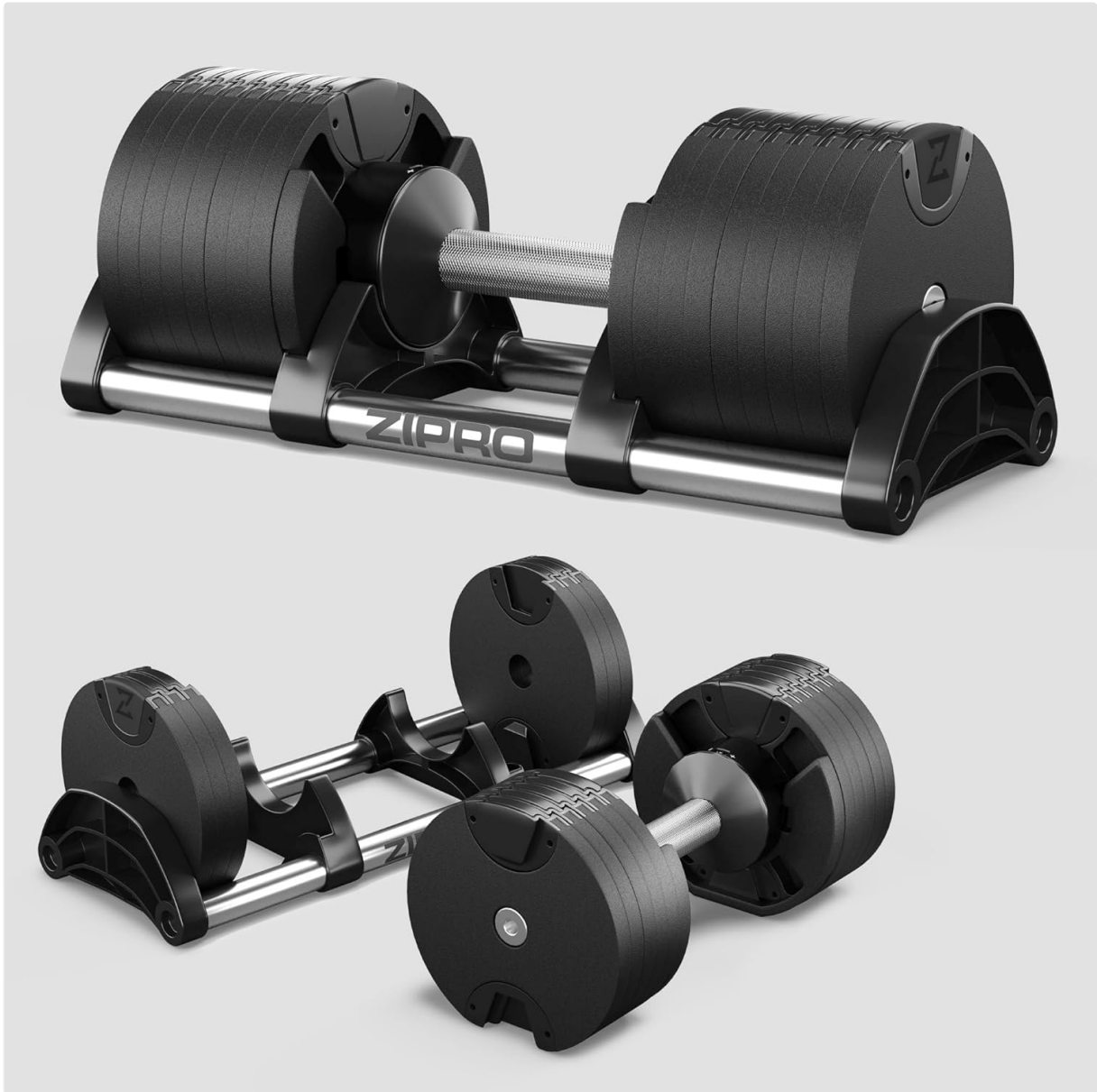
Figure 4.1: Dumbbell correctly placed in its storage base.