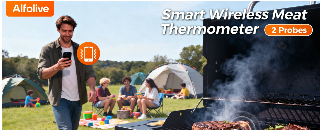
Image: The Alfolive HK-W02 thermometer demonstrating its 800FT long-range stable monitoring capability during an outdoor grilling session.