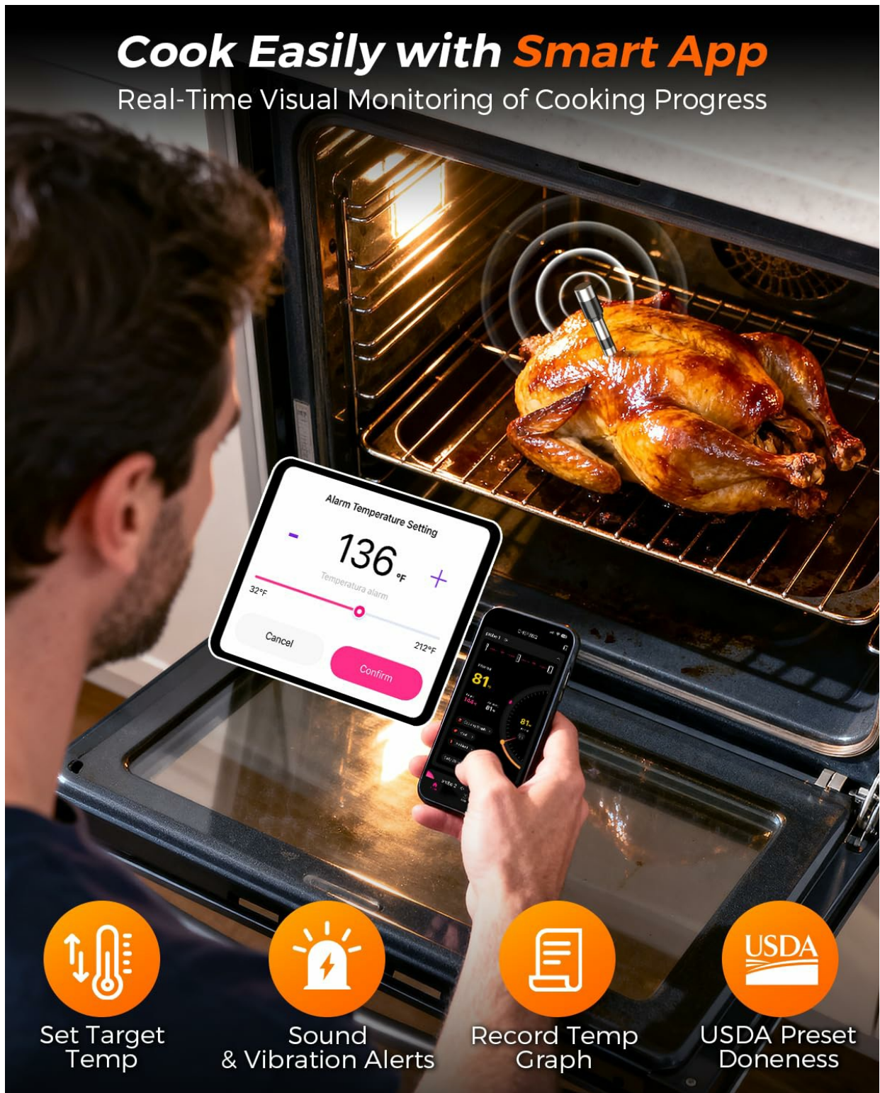
Image: A user monitoring the cooking temperature of a chicken in an oven via the Alfolve smart app on a smartphone.

Real-Time Visual Monitoring of Cooking Progress