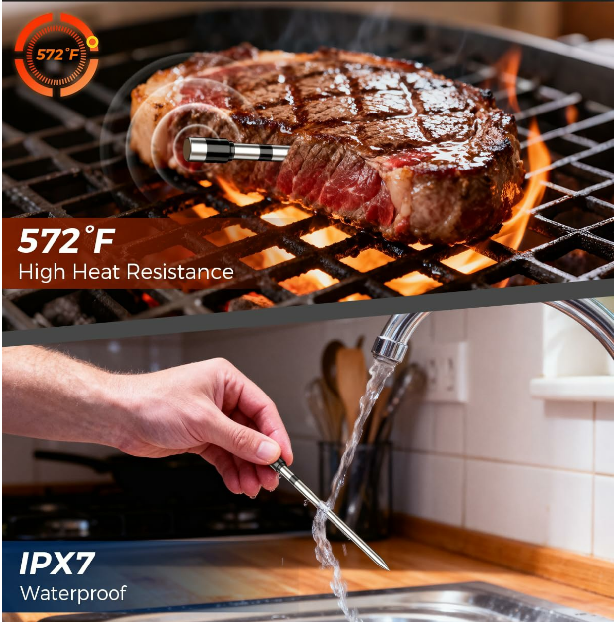
Image: The Alfolive HK-W02 probe demonstrating its heat resistance while in a grill and its waterproof feature being cleaned under running water.

Made of Food-Grade 304 Stainless Steel & Heat-resistant Ceramic