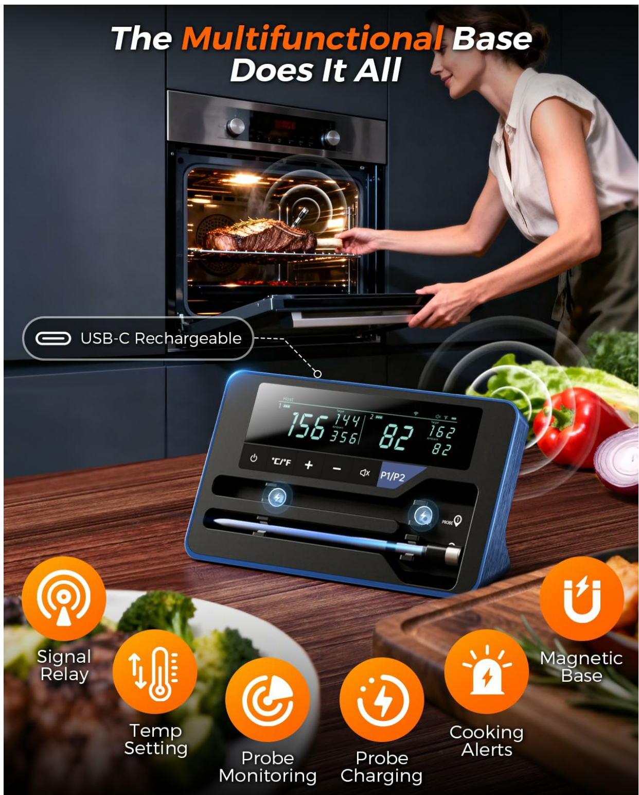
Image: The Alfolive HK-W02 multi-function base showing its display and probes, with a cooked steak in the background.