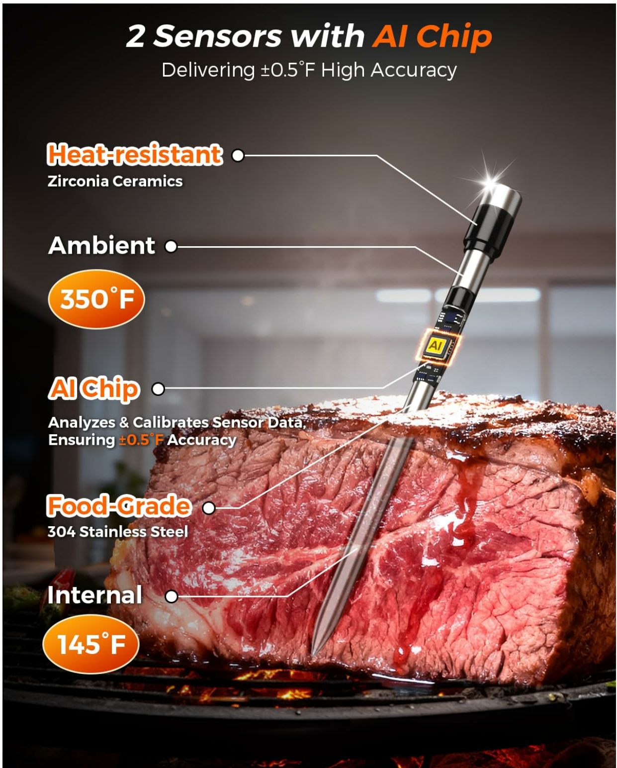
Image: A meat probe inserted into a steak, highlighting the dual sensors and AI chip for accurate temperature readings.