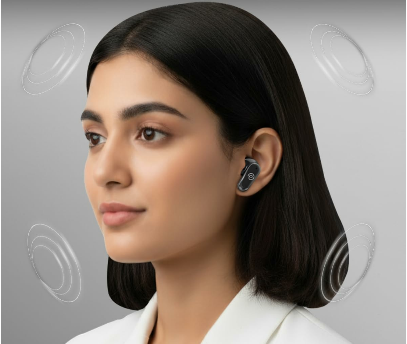
Figure 8: Transparency Mode for situational awareness.