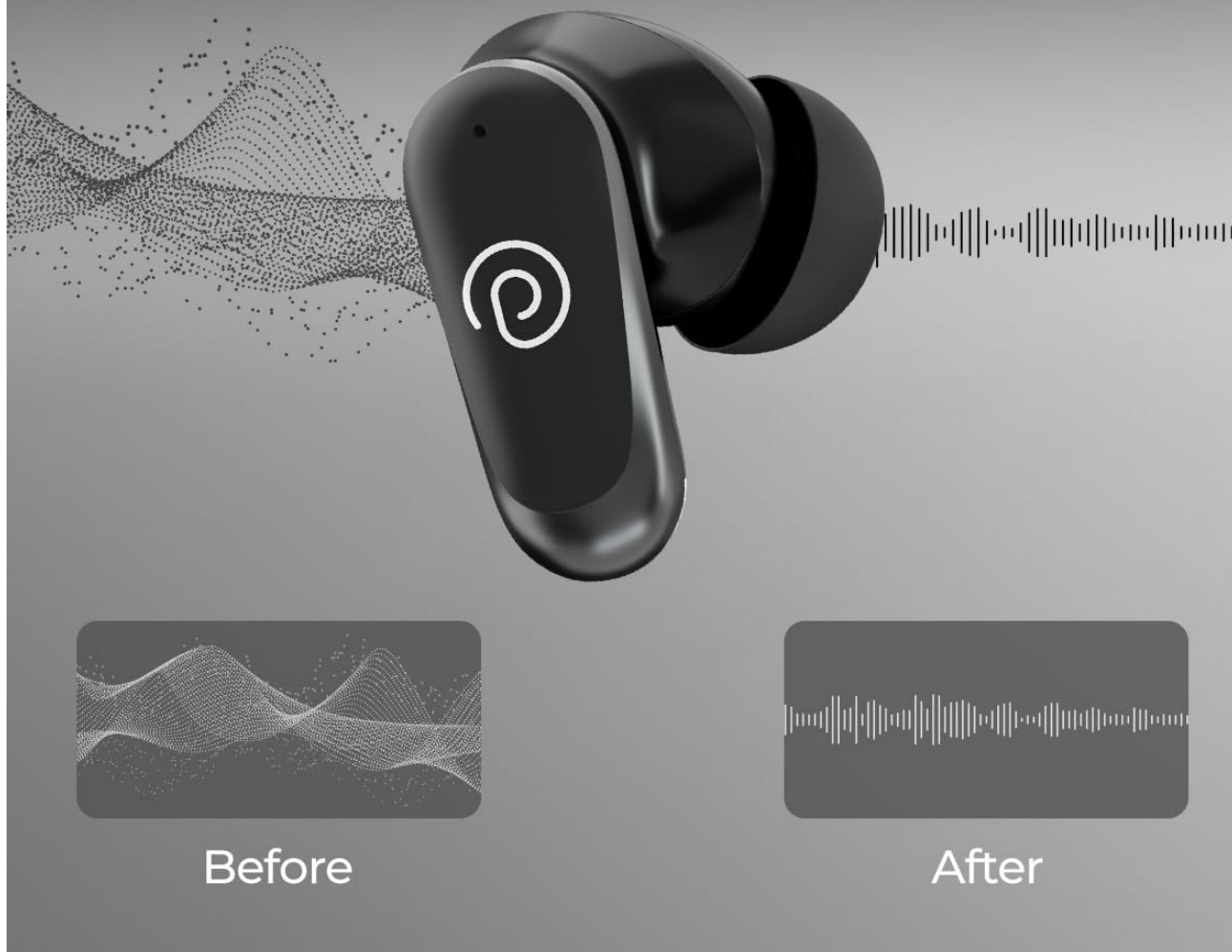
Figure 7: Visual representation of 35dB Active Noise Cancellation.

35dB ANC. Zero Distractions = Pure Focus.