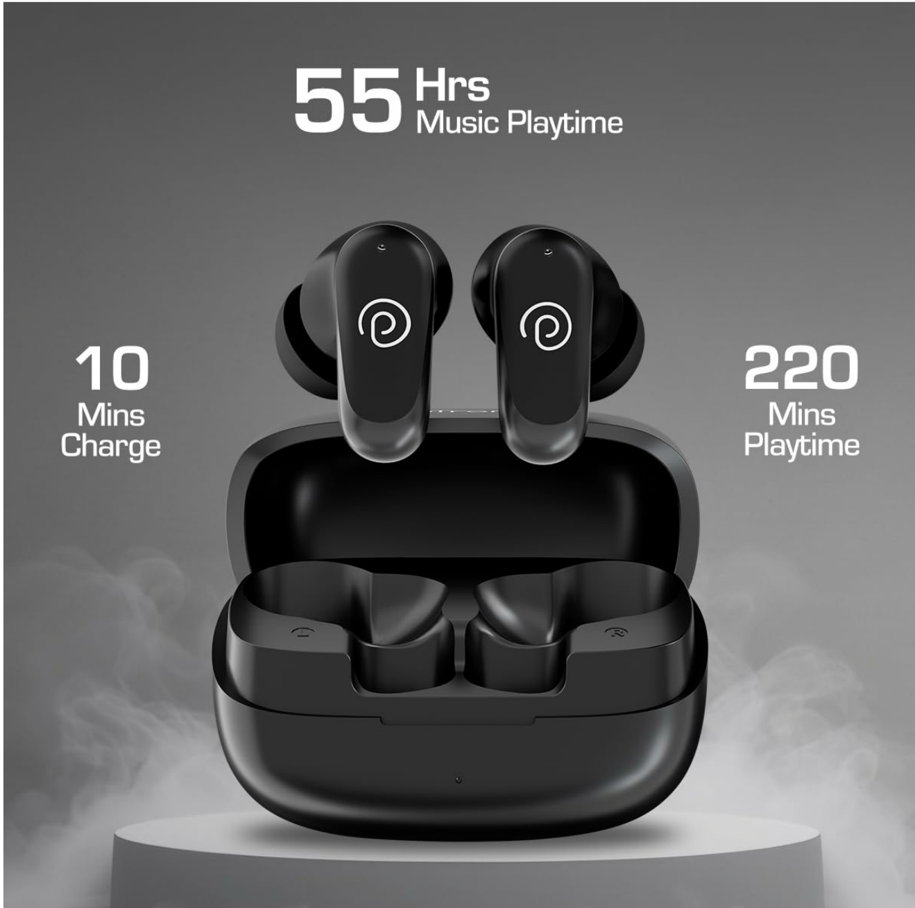
Figure 2: Charging the Bassbuds Zen for quick playtime.

A 10-minute charge provides approximately 220 minutes of playtime.