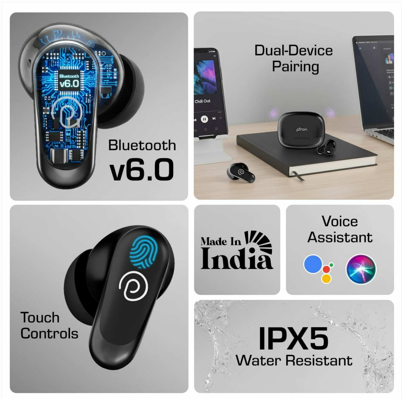
Figure 4: The touch-sensitive area on the earbud for control.