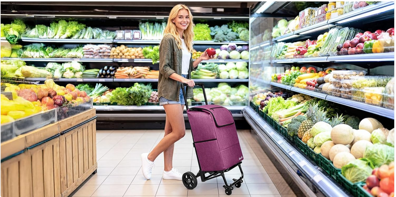
Image: Cart in use at a laundromat, on a street, and in a grocery store.