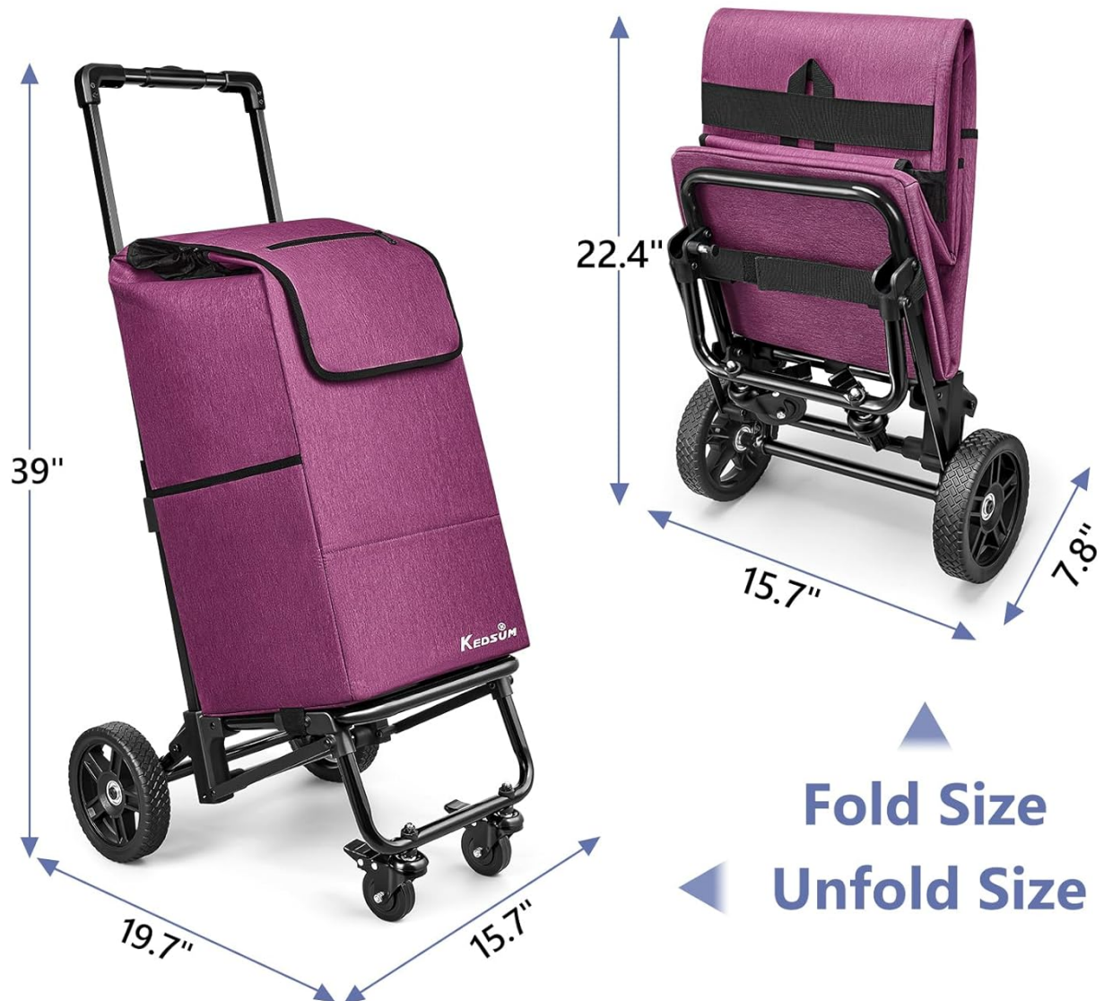
Image: Dimensions of the KEDSUM shopping cart in both unfolded and folded states.