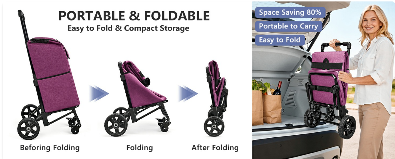
Image: Folding sequence of the KEDSUM shopping cart for compact storage.