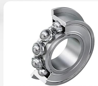
Double Ball Bearing