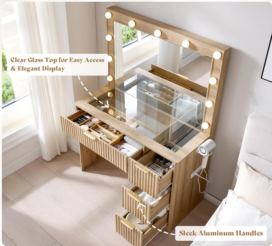
Figure 5: The vanity includes four spacious drawers with sleek aluminum handles for organized storage.