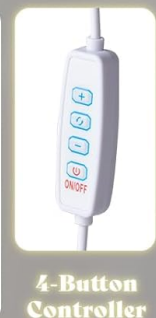
Figure 3: The LED mirror offers three distinct light modes and adjustable brightness for various beauty needs.