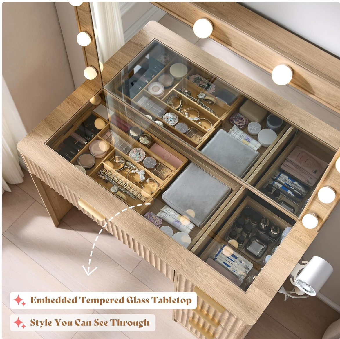
Figure 4: The tempered glass top provides a clear view of organized items in the top drawers, enhancing accessibility.