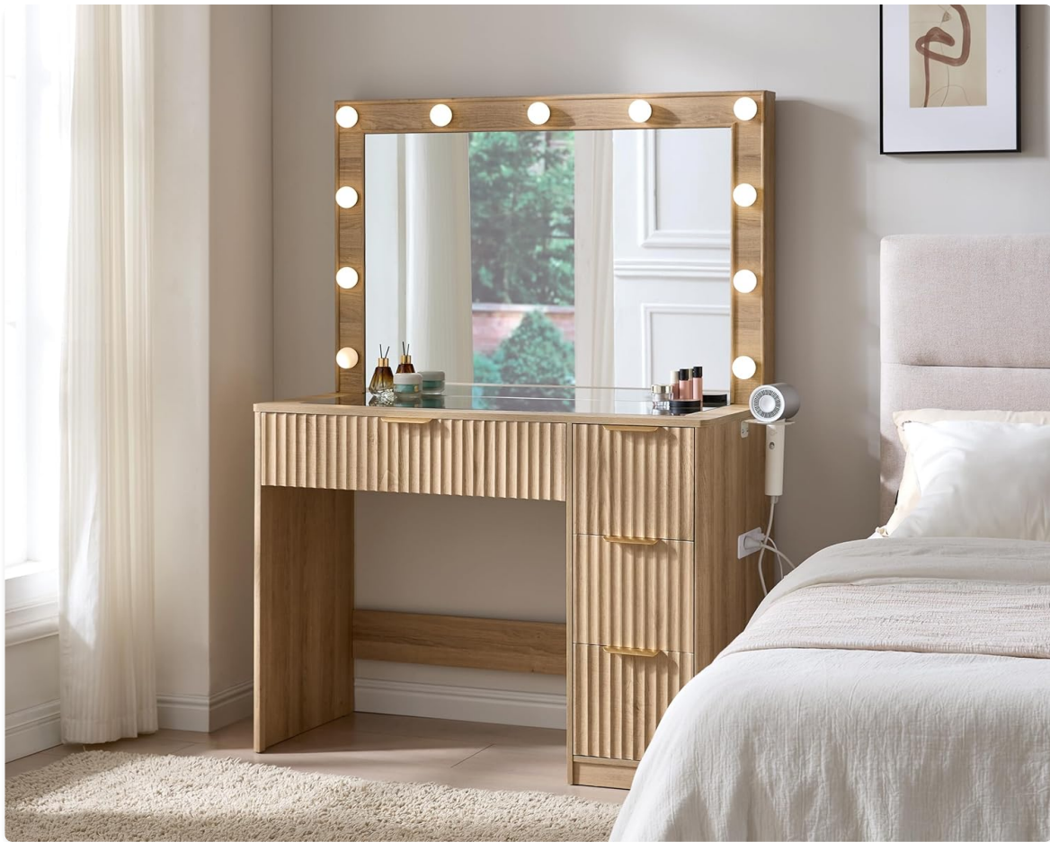
Figure 1: The AMERLIFE 36.2\" Fluted Vanity Desk in Oak finish.