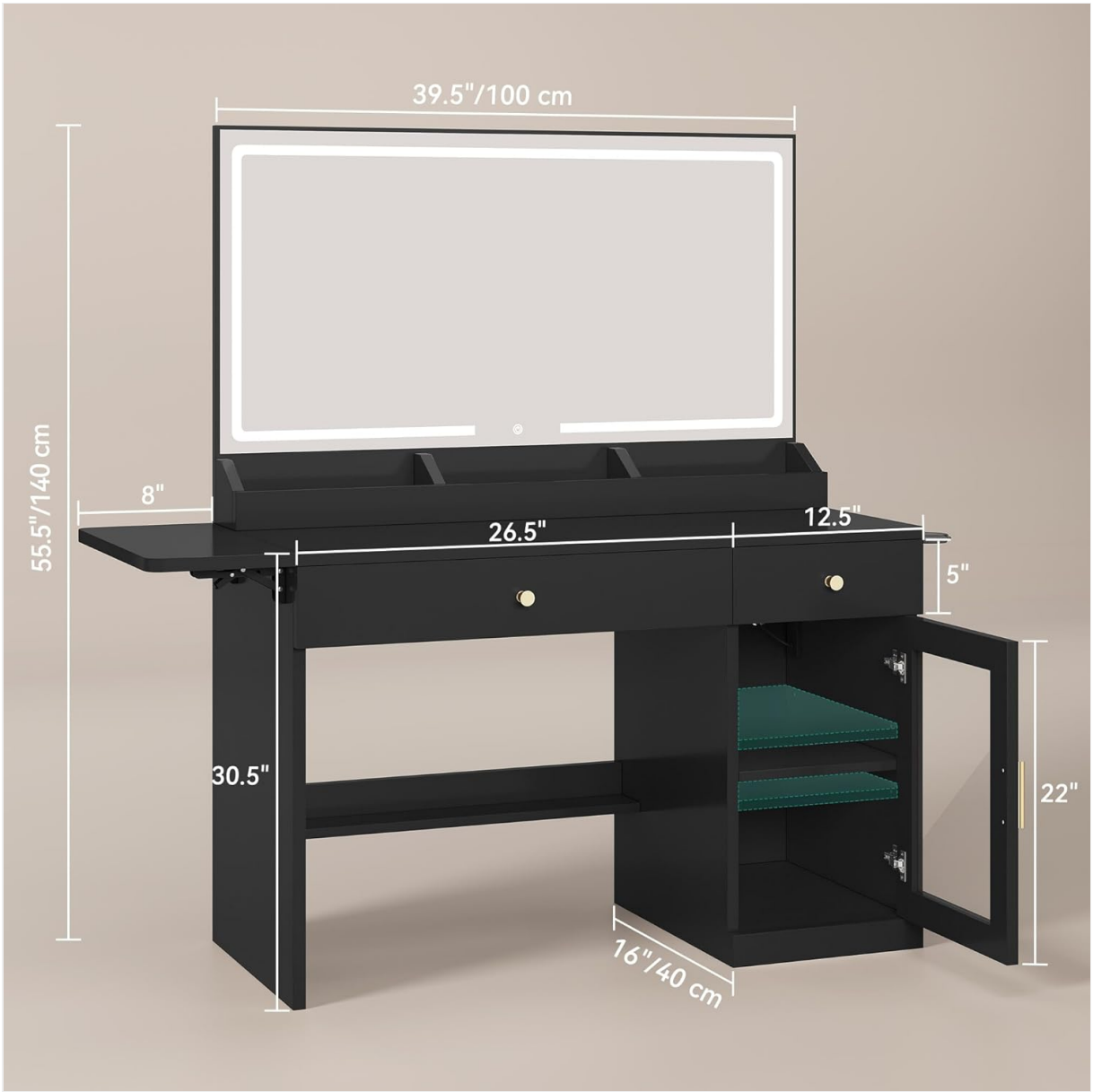
Figure 1: Product Dimensions and Key Features.

Assembly is required for this vanity desk. It is recommended to have two people for certain steps. The process typically takes approximately 2.5 hours. Follow the step-by-step instructions provided in the separate assembly guide included with your product. All parts are clearly labeled for ease of identification.