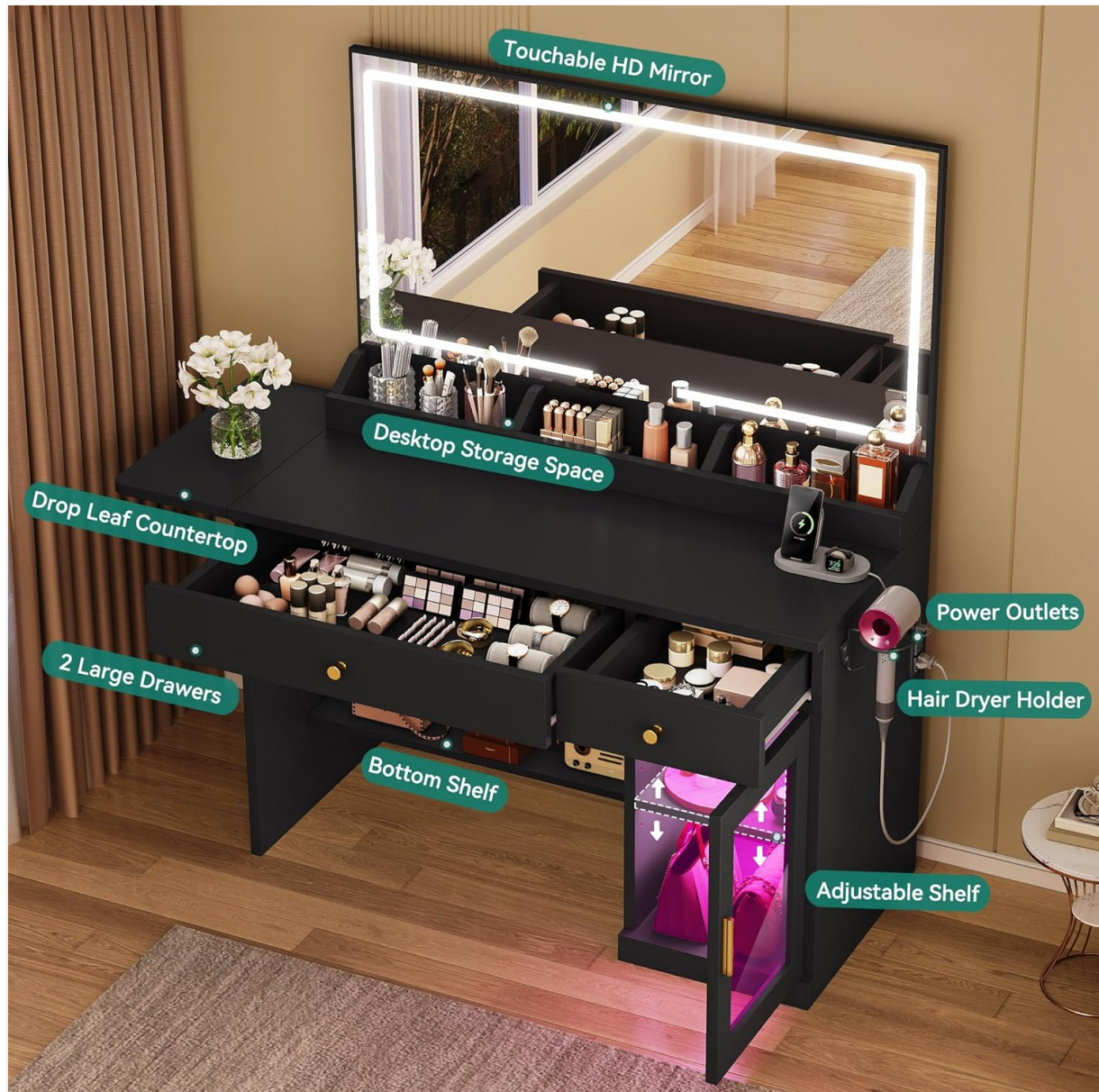
Figure 7: Organized Drawers and Desktop Compartments.