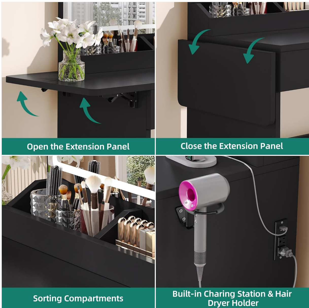
Figure 4: Integrated Power Hub and Hair Dryer Holder.