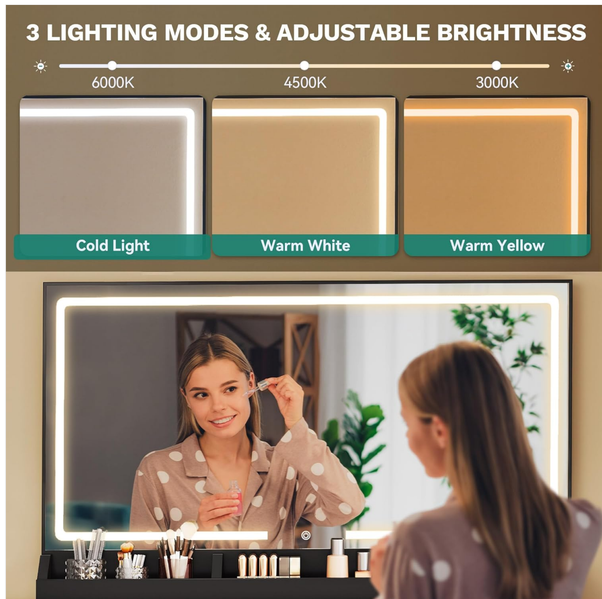
Figure 3: LED Mirror with three adjustable lighting modes.