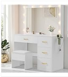
Figure 8: Smooth-sliding drawer mechanism.