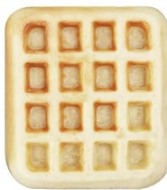
light & fluffy