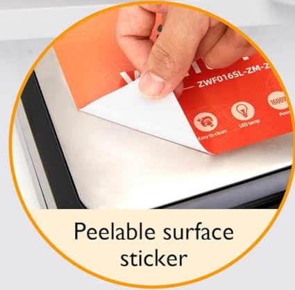
Peelable surface sticker