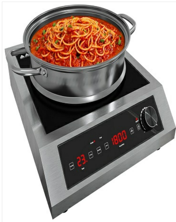
Image: Ensure all protective films and stickers are removed from the appliance before initial use. The labels are designed for clean removal without leaving residue.