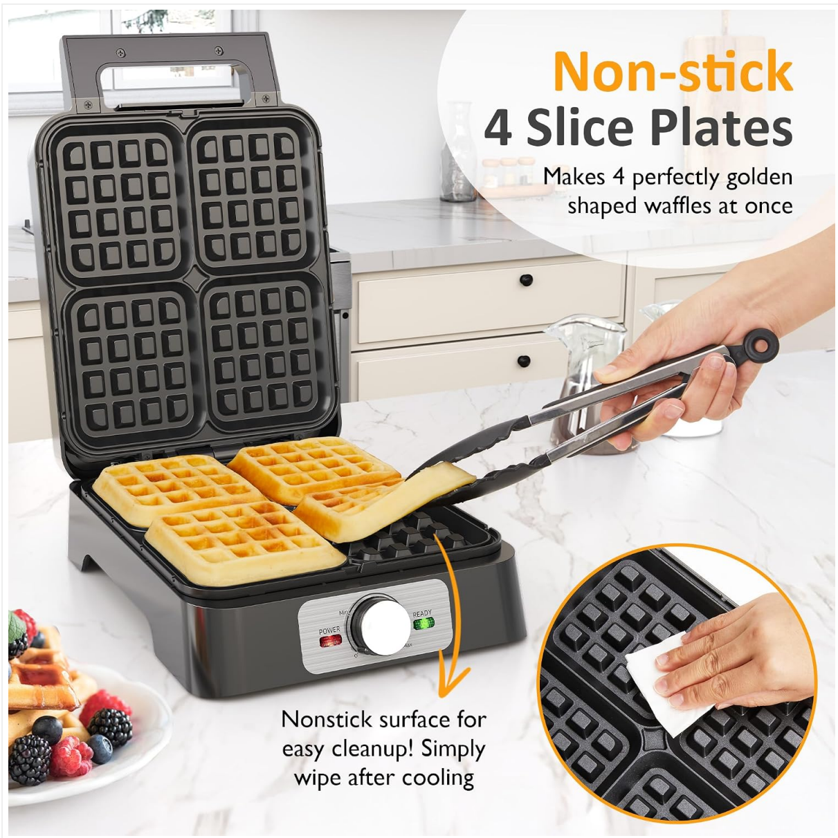
Image: The non-stick surface allows for easy cleaning. After the unit has cooled, simply wipe the plates with a damp cloth to remove any residue.