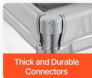
Image: Detail of the playpen's reinforced structure, highlighting strong suction cups, thickened iron tubes, and durable connectors for enhanced stability.