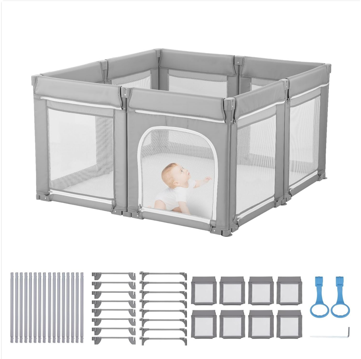
Image: All components of the VEVOR Baby Playpen, including fabric covers, tubes, connectors, and tools.

Verify that all components are present before beginning assembly.