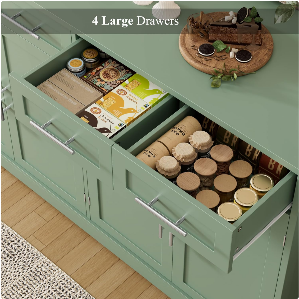
Image: A close-up view of the sideboard with its drawers open, showing their depth and capacity for organizing smaller items.