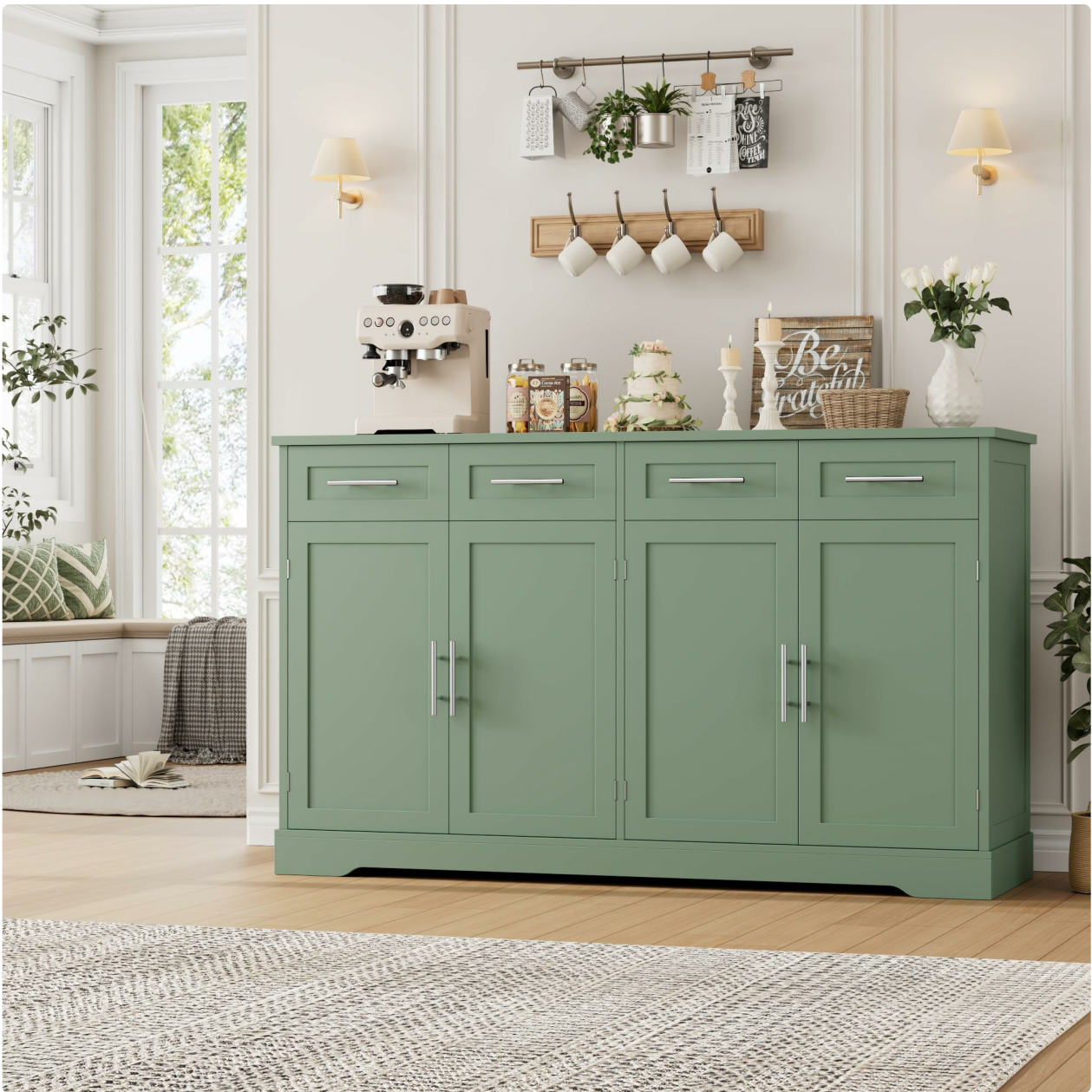
Image: Overall view of the HOSTACK 60-inch Buffet Sideboard in green, showcasing its design and size.