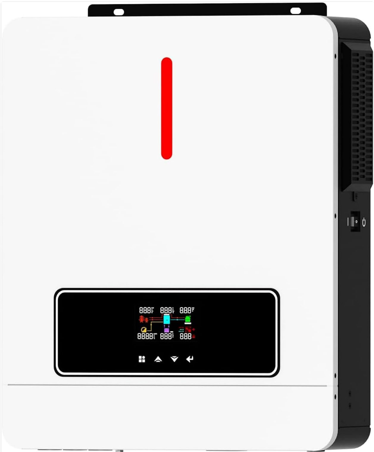
Figure 3.1: Front view of the SWIPOWER 3600W Hybrid Solar Inverter, showing the LCD display and control buttons.