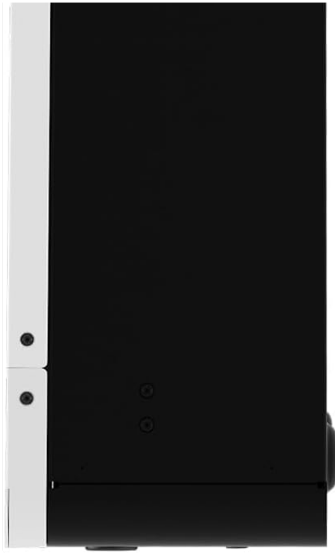
Figure 4.1: Side view of the inverter, illustrating the mounting brackets and ventilation.