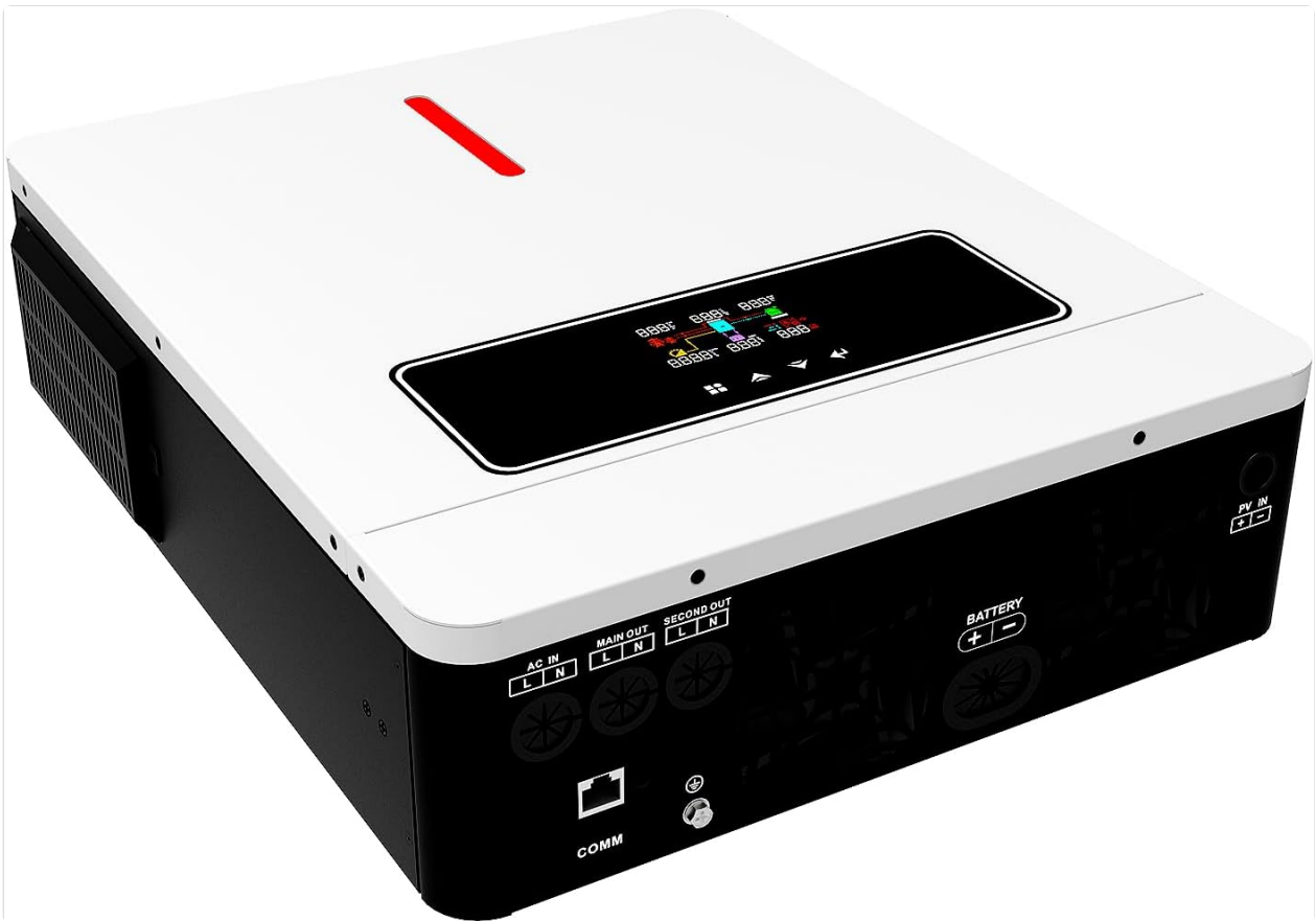
Figure 3.2: Angled view of the inverter, highlighting the various input and output terminals on the rear panel.